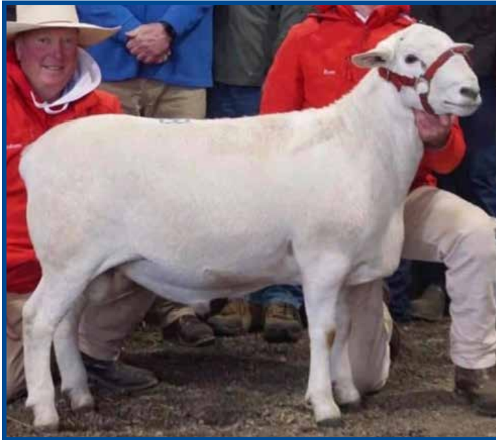
Tattykeel "COVID" 191019