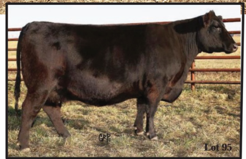
Dam of Remington

Remital Toonie 541T D: LLB Rosebud Lass 87W Mountain Ash Rosebud Lass 5T