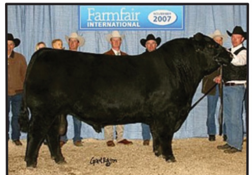
Sire of Remington