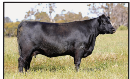
Full ET Sister

An exciting outcross Canadian imported embryo bred bull.