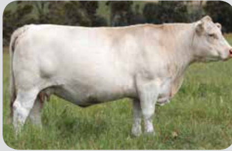
Venturon Jemma J3