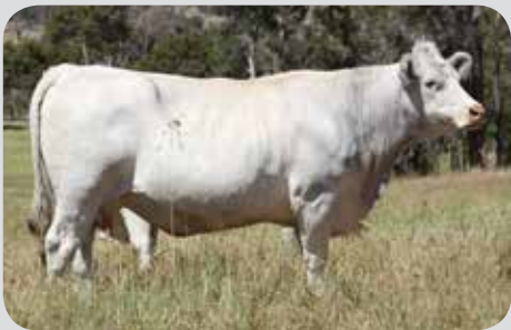
Venturon Kate K22