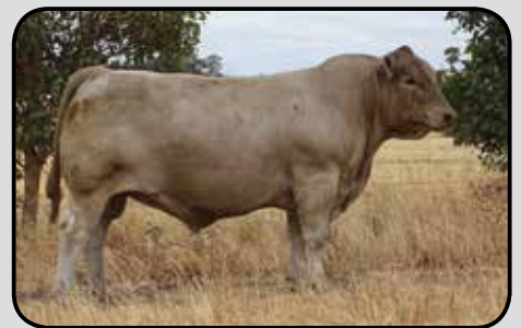
8 Murray Grey

For Independent Sale Advice contact Tom Wilding-Davies 0429 570 504