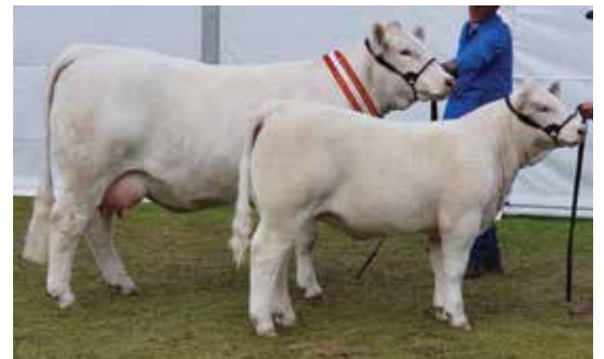
Dam: Venturon Naughty But Nice (P)