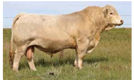
Sire: Turnbulls Duty Free 858D (P)

KOOYONG KIRWAN (H2E K58E) (P) D: VENTURON NAUGHTY BUT NICE (VE7 N31E) (P) VENTURON GAYLE (VE7 G35E) (P)