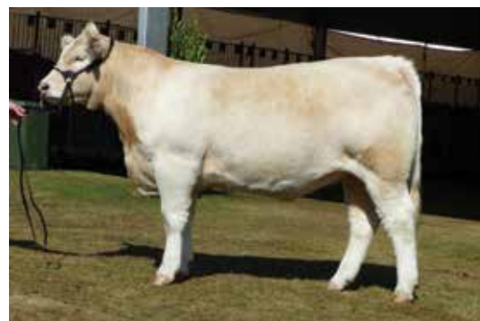
Dam: Venturon Hillary P27 (P)

Comments: Here is one of the best Charolais bulls to sell in the West this year! R1 really does Raise The Bar for Venturon standards. We believe this is the most exciting herd sire prospect we have ever sold at auction. Not often do you get a homozygous polled bull with as much power and body mass as this guy has that moves so well and appeals to the eye. He is one of the first WC Milestone 5223 P sons to sell in Australia and you can see how well he is working for us. For anyone that follows our program, you'll know how good his female line is. This is the first calf out of our favourite Sparrows Kingston daughter- Hillary P27. His dam was junior champion female at the 2019 Adelaide Royal Show and a class winner at the 2019 Sydney Royal Show. This bull offers such a unique package of outcross genetics backed by an exceptional female line. True stud sire prospect. Raise The Bar R1 will be entered for Sydney Royal 2022 pending buyers approval, Free delivery to NSW if shown at Sydney Royal show.