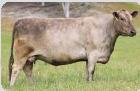
Waroona Pearl J39