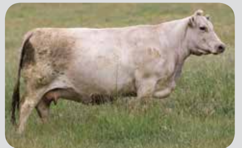
Bundaleer Kuri H65