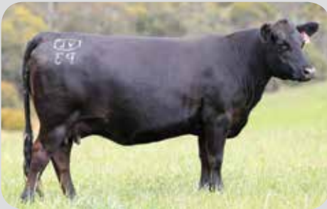
Venturon Pandora P3