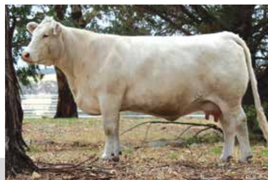
Grand dam: Venturon Hillary (P)