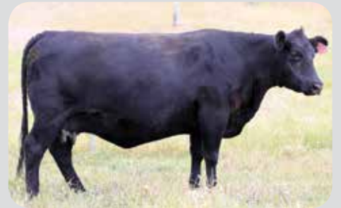
Diamond Tree Birthstone M97