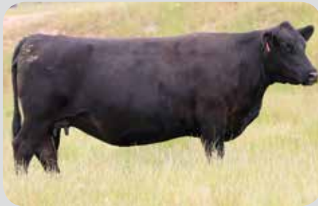
Diamond Tree Southside M132