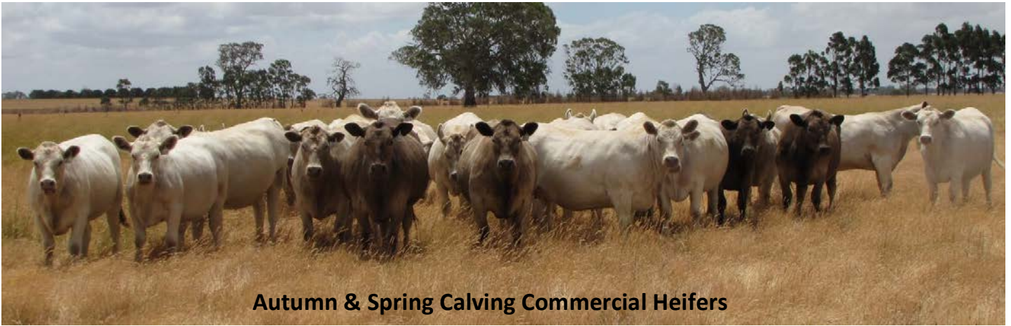
Autumn & Spring Calving Commercial Heifers

Depastured to stud MG bulls from 26/10/21 - 16/12/2021