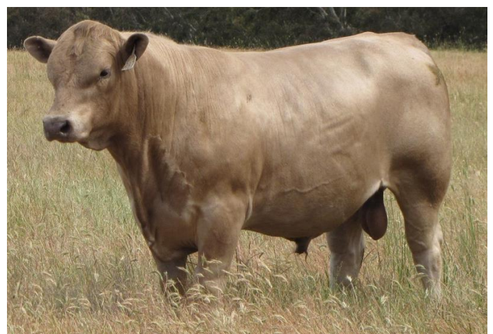
Lot 24 Lindsay Rainmaker R67