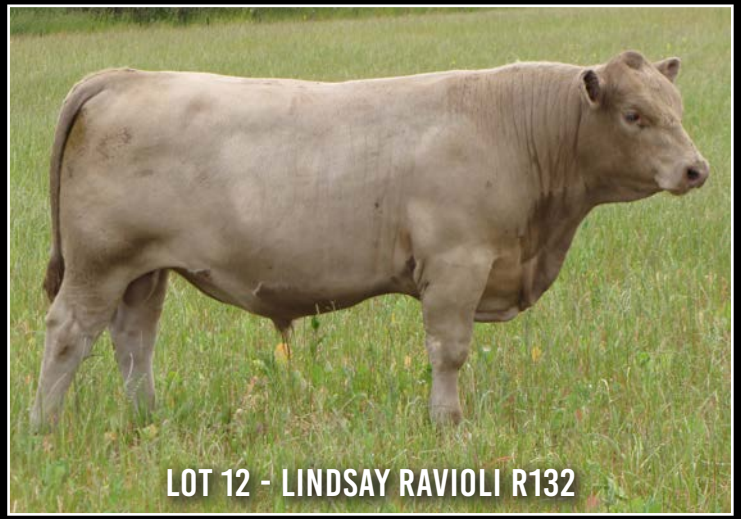
LOT 12 - LINDSAY RAVIOLI R132