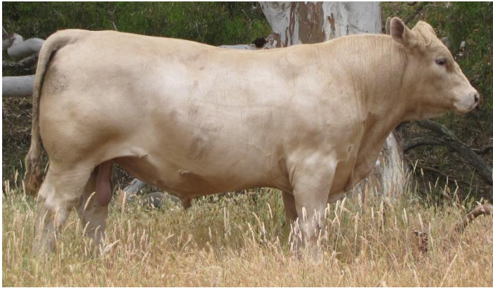
Lot 3 Lindsay Rajah R41

From Naracoorte travel to Edenhope, then Harrow. From Harrow take the Coleraine Road for 17km. Property on the right.