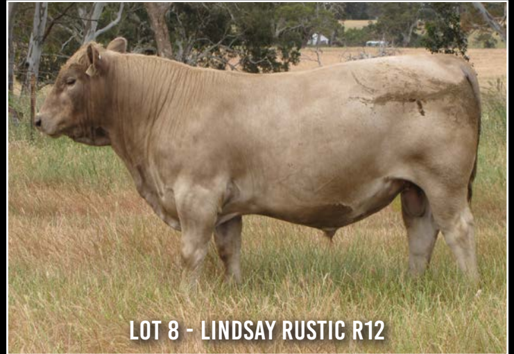
LOT 8 - LINDSAY RUSTIC R12