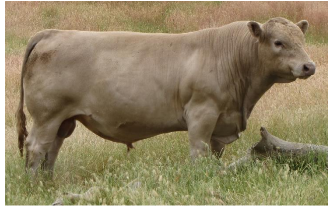
Lot 21 Lindsay Raccoon R20