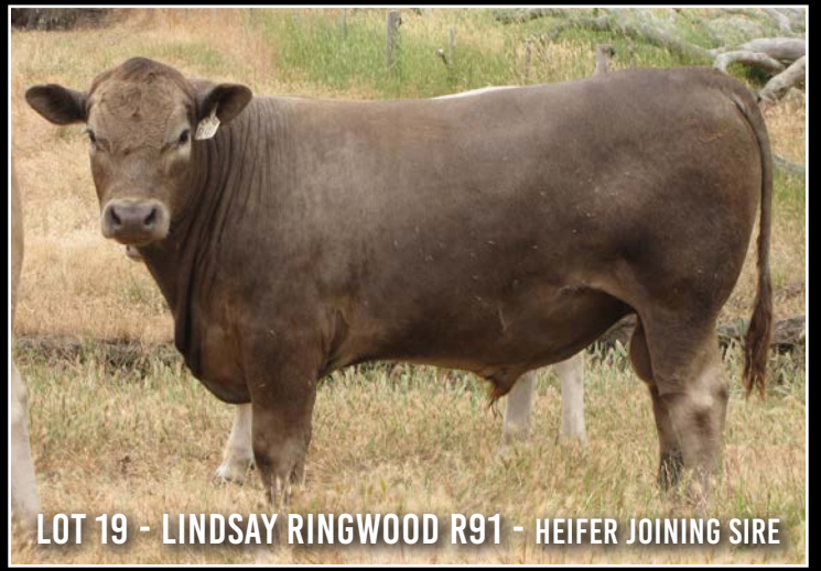
LOT 19 - LINDSAY RINGWOOD R91 - HEIFER JOINING SIRE