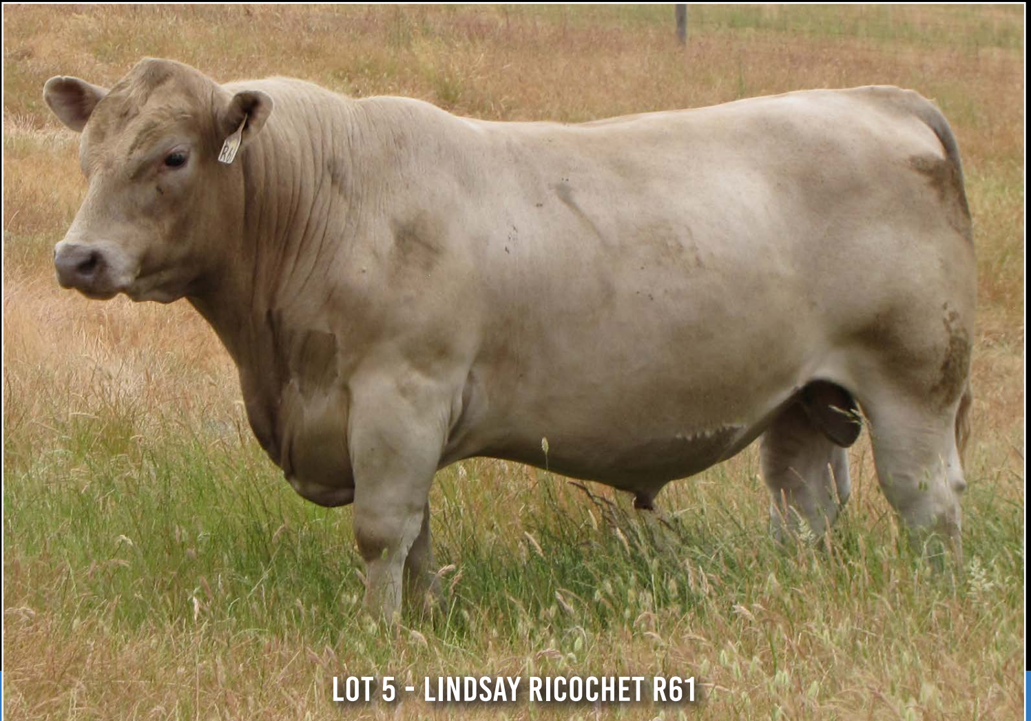
LOT 5 - LINDSAY RICOCHET R61