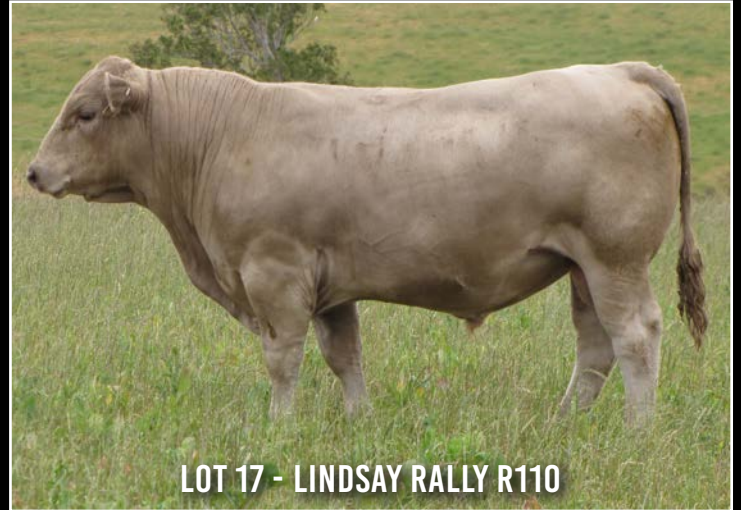
LOT 17 - LINDSAY RALLY R110