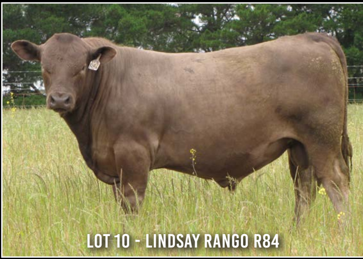
LOT 10 - LINDSAY RANGO R84