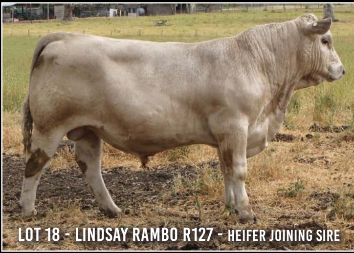
LOT 18 - LINDSAY RAMBO R127 - HEIFER JOINING SIRE