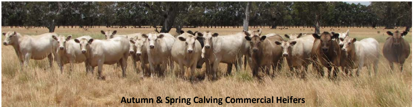
Autumn & Spring Calving Commercial Heifers

Commercial Heifers are not eligible for freight assistance, but maybe worked in on route with bulls if possible (no guarantees)