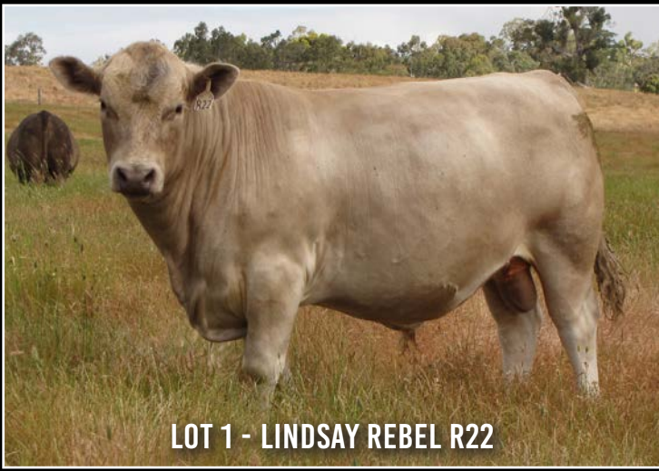
LOT 1 - LINDSAY REBEL R22