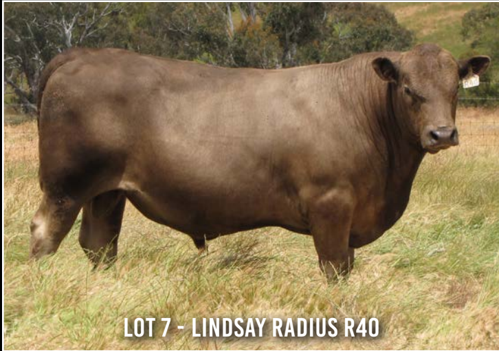
LOT 7 - LINDSAY RADIUS R40