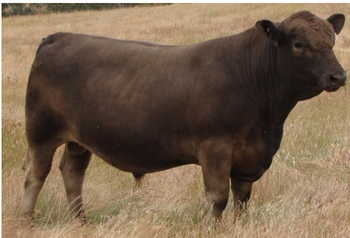
Lot 6 Lindsay Rafter R63