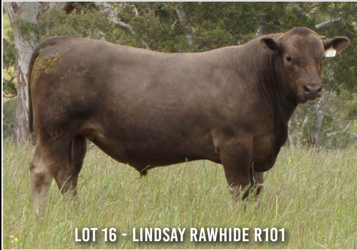
LOT 16 - LINDSAY RAWHIDE R101