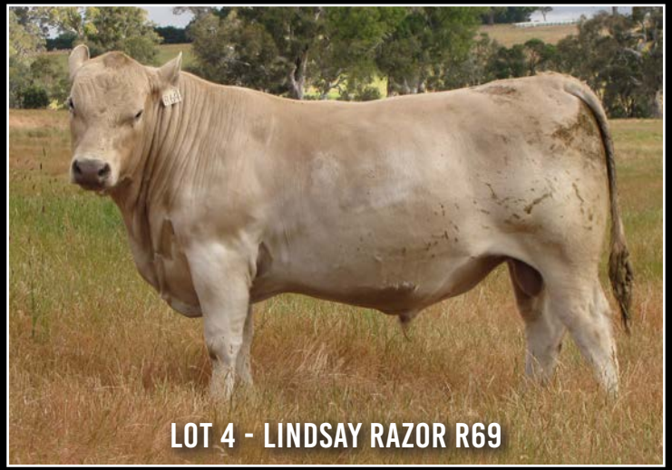
LOT 4 - LINDSAY RAZOR R69