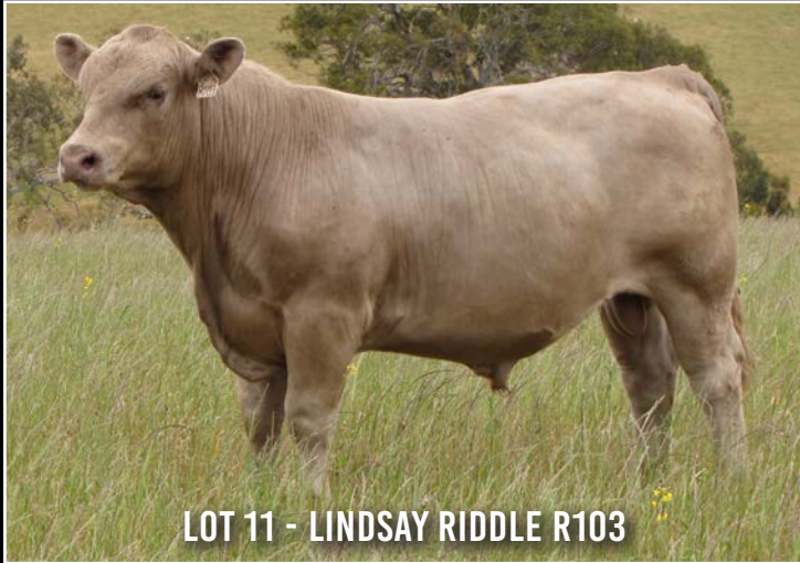
LOT 11 - LINDSAY RIDDLE R103