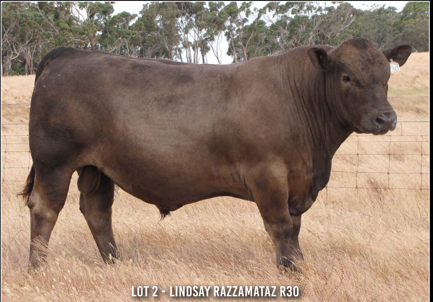
LOT 2 - LINDSAY RAZZAMATAZ R30