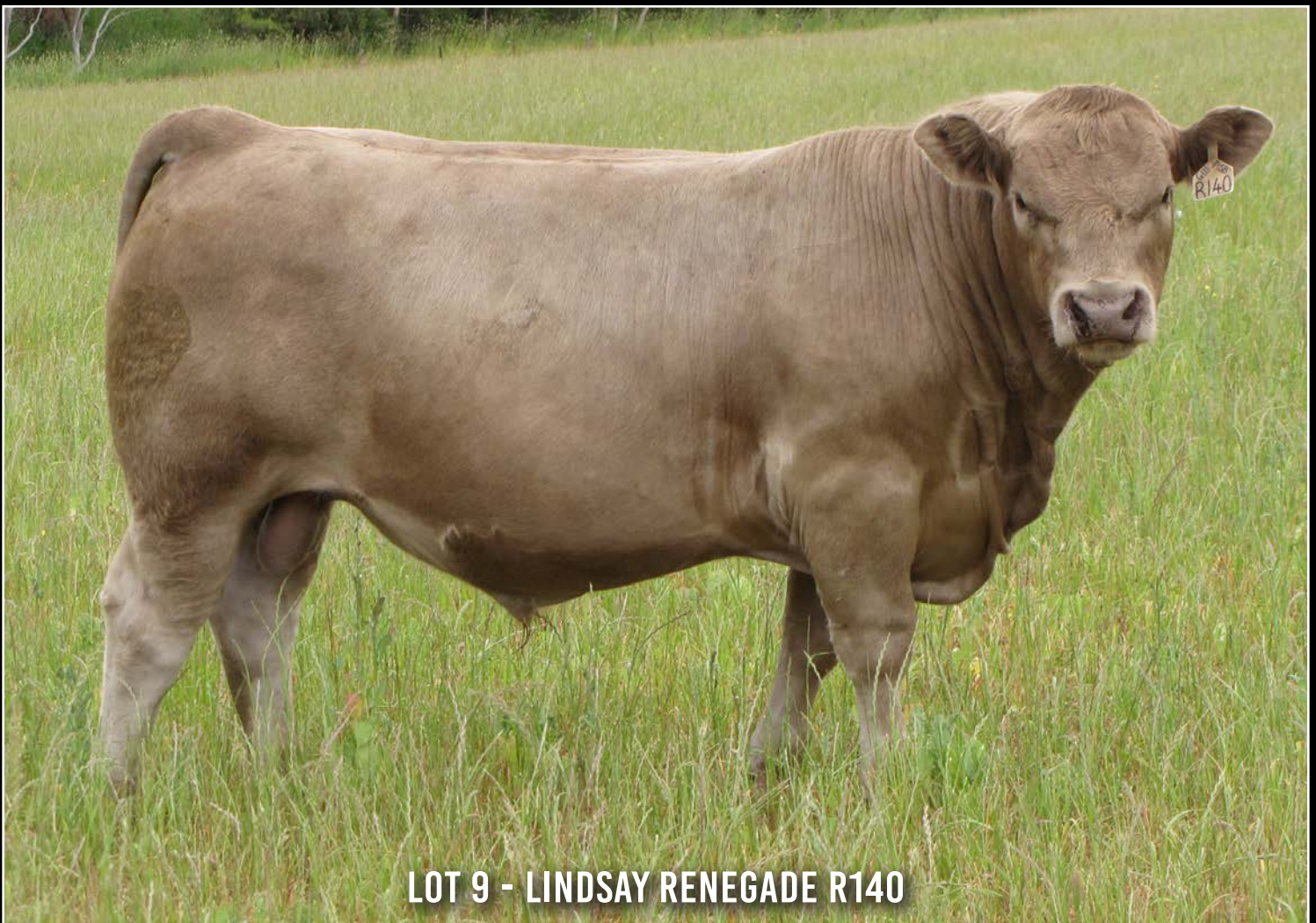
LOT 9 - LINDSAY RENEGADE R140