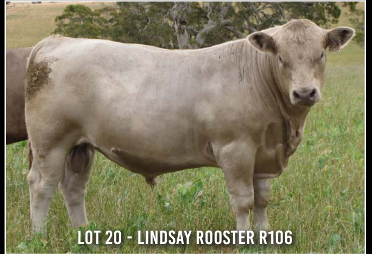
LOT 20 - LINDSAY ROOSTER R106