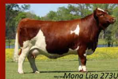
Mona Lisa 273U

ZEUPR017 - HORNED - 100/100 BORN 29/3/20