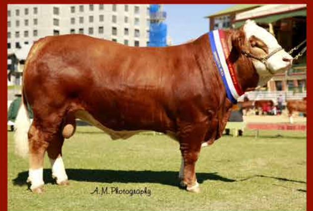
Valley Creek Joker