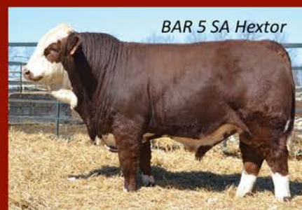
BAR 5 SA Hextor

Our good fortune with ET results on Fashionista's genetics means we have a few spare to share. Selling 2 embryos both sired by Bar 5 SA Hextor - we have proof mating works, check out lot 2 and 15. Can't guarantee pregnancies on this mating as these are the only embryos we have on this mating however with our past results we are confident in these embryos!