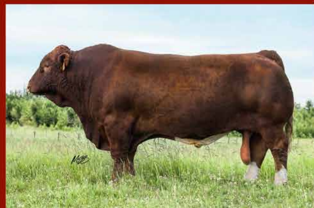
Double Bar D Spitfire