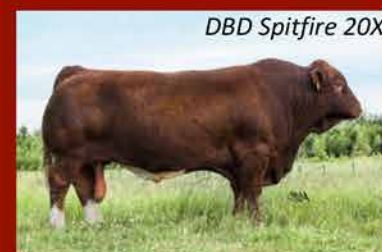
DBD Spitfire 20X