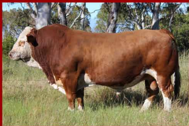
Grangeburn Masters Pride