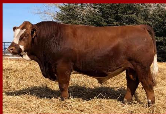
JB CDN Captain Call - 13 months.

'Captain' is the bull we'd been searching for, he's got the pedigree, the performance and the cosmetics that we all like to see and watch perform. Out of the strong Freysia line of females, and sired by Double Bar D Chisholm, he represents a new sire line for Australia. Cosmetically he's cherry red, full pigmented and polled.