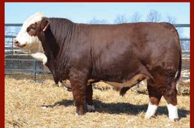
Bar 5 Hektor