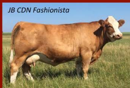
JB CDN Fashionista