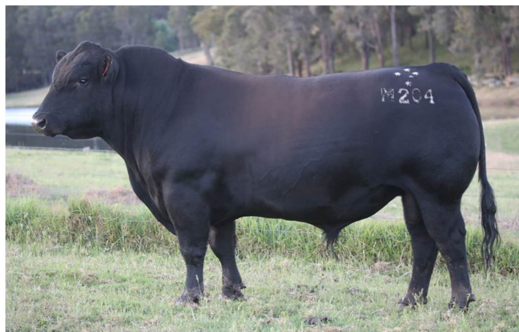
SIRE Black Market Midland M204 (Sire of Lots 3, 8, 9, 10 & 12)