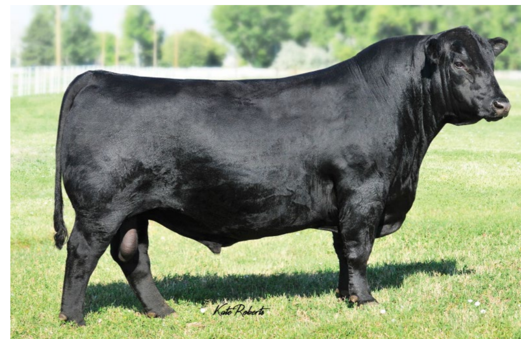
SIRE Bruns Blaster (Sire of Lot 1)