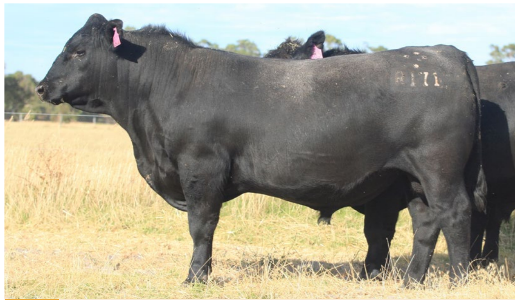
LOT 39 Black Market Pardi R171