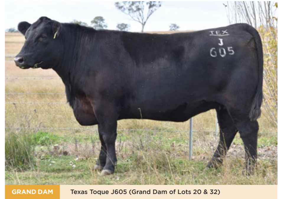
GRAND DAM Texas Toque J605 (Grand Dam of Lots 20 & 32)

Traits Observed: BWT,200WT,400WT(x2), Scan(EMA,Rib,Rump,IMF),Genomics