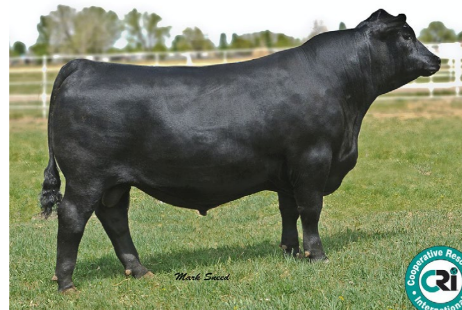
SIRE Sitz Investment (Sire of Lots 2 & 16, Grand sire of Lots 7, 20, 21, 22, 24, 25, 28, 29, 30, 31, 33, 34, 35, 39, 40)

Lots in sale: 20, 21, 22, 24, 25, 28, 29, 30, 35, 39