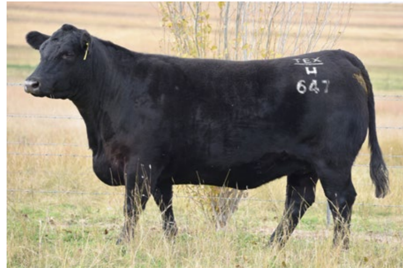
GRAND DAM Texas Undine H647 (Grand Dam of Lot 28)