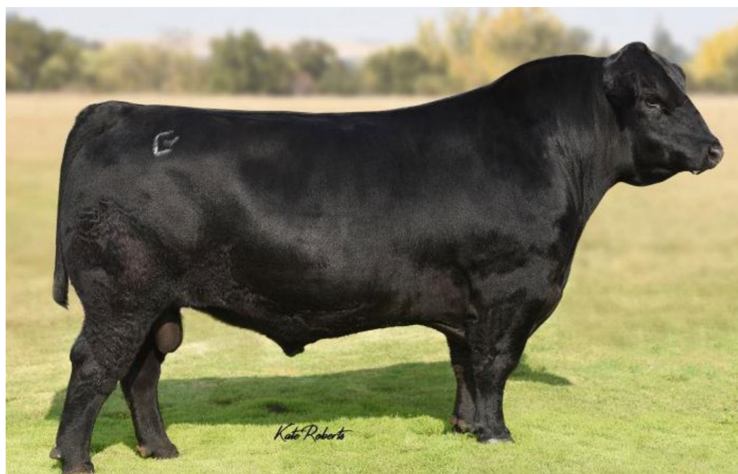
SIRE Baldridge 38 Special (Sire of Lot 15)