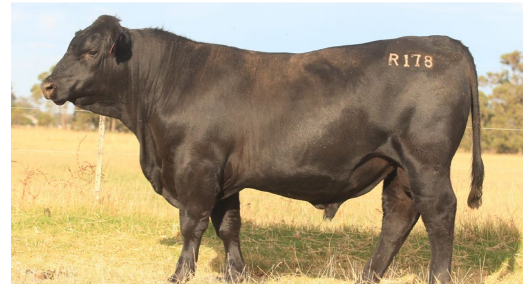
LOT 40 Black Market Pardi R178