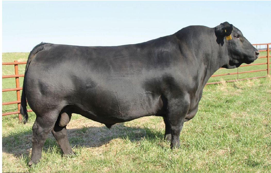
SIRE SAV Resource (Sire of Lots 5, 6, 11, 13, 23, 27, 32)