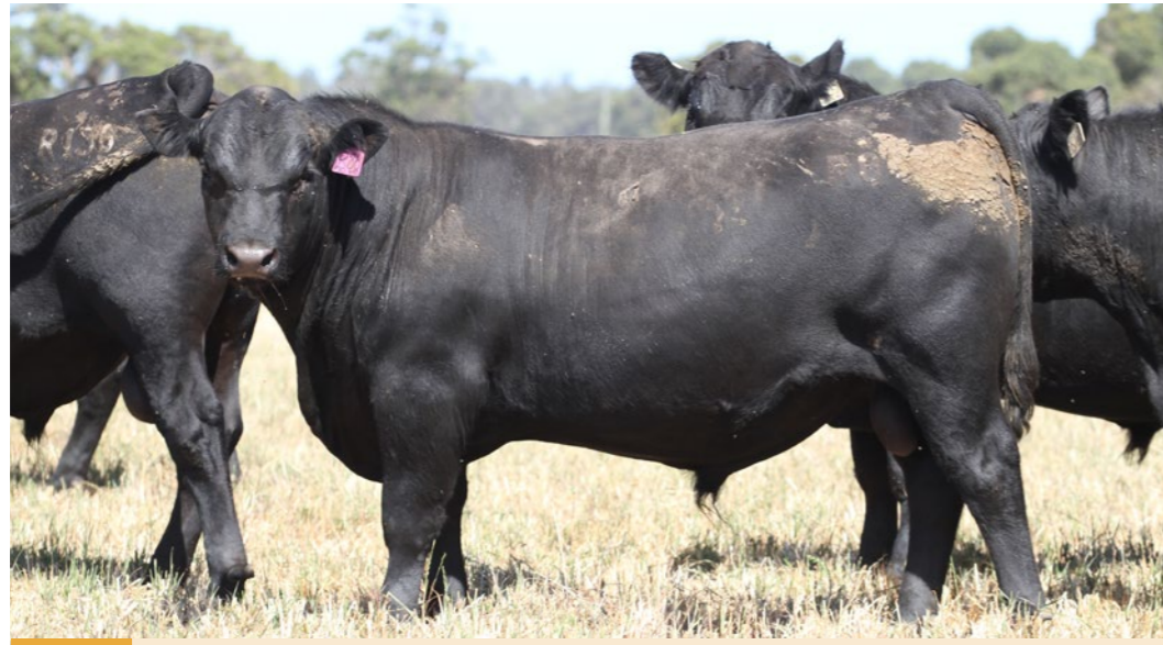
LOT 25 Black Market Pitney R083