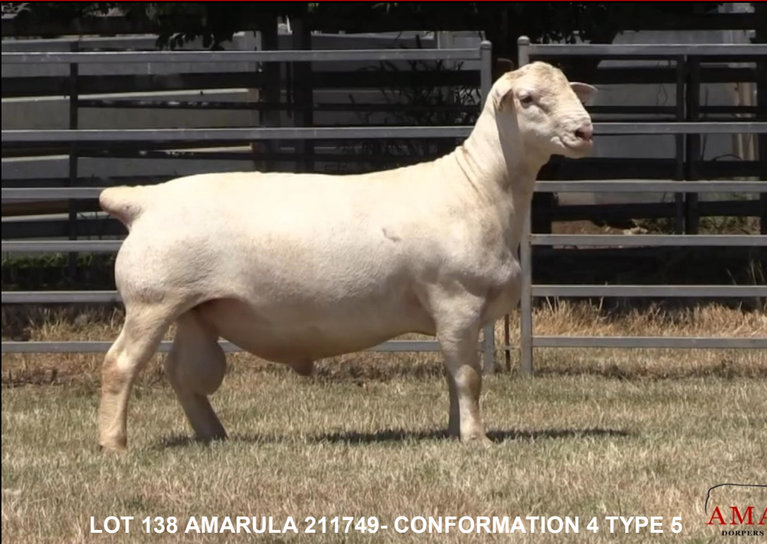
LOT 138 AMARULA 211749 - CONFORMATION 4 TYPE 5