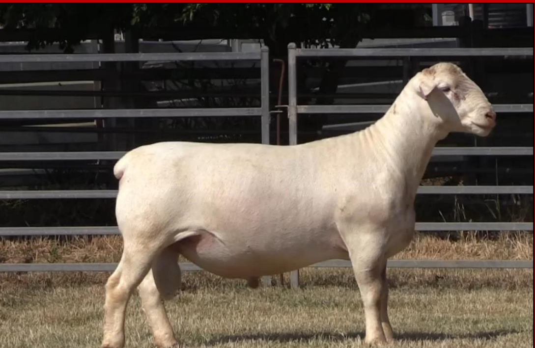
LOT 116 AMARULA SMOOTH 201685 - CONFORMATION 5 TYPE 5