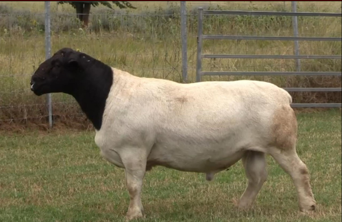
LOT 20 AMARULA STORM 187562 - CONFORMATION 5 TYPE 5