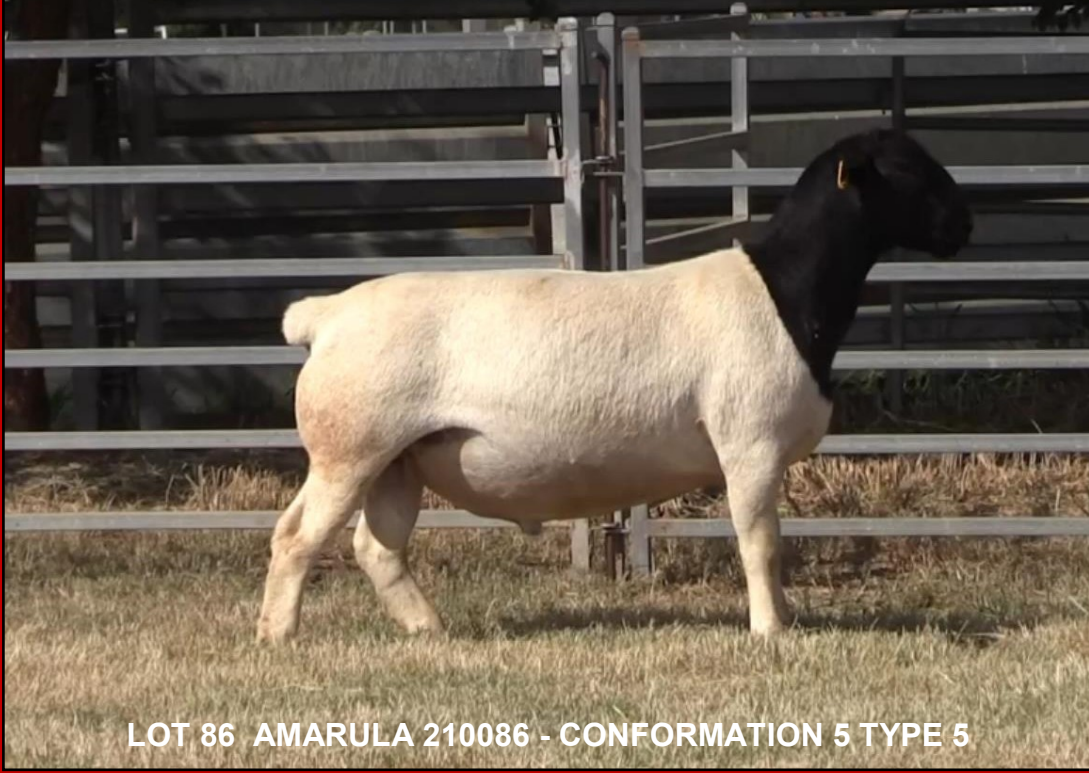
LOT 86 AMARULA 210086 - CONFORMATION 5 TYPE 5