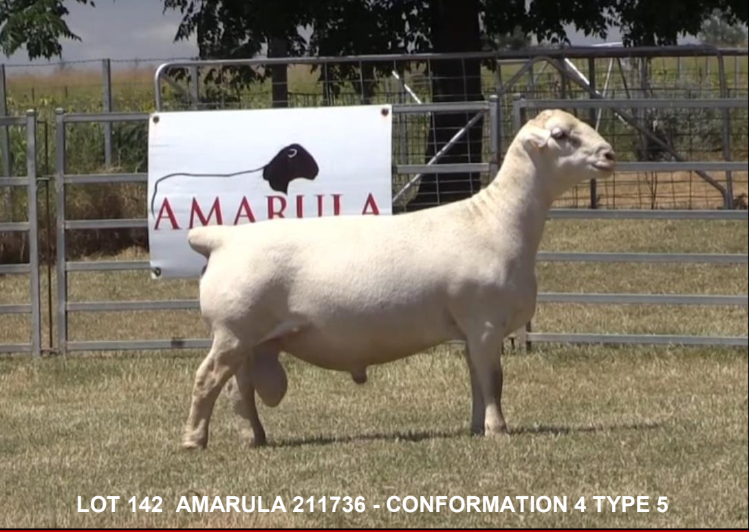
LOT 142 AMARULA 211736 - CONFORMATION 4 TYPE 5