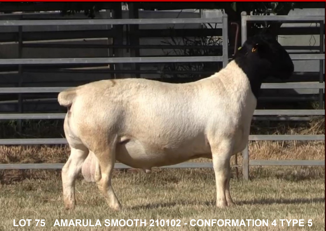
LOT 75 AMARULA SMOOTH 210102 - CONFORMATION 4 TYPE 5