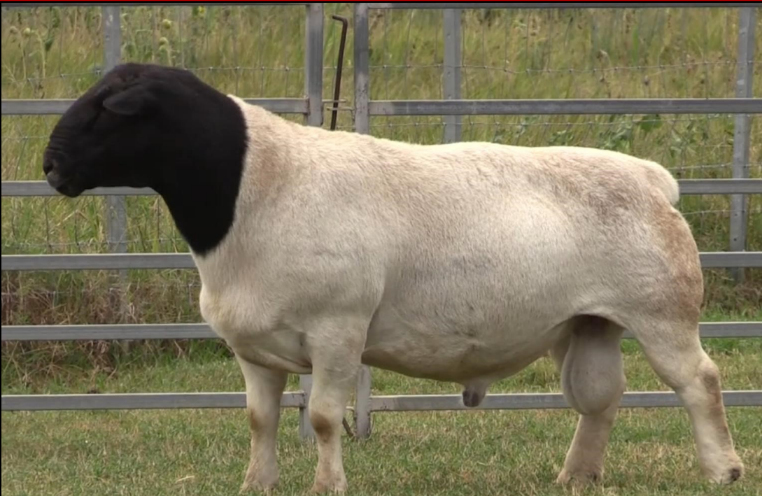
LOT 19 AMARULA FLYNN 187779 - CONFORMATION 5 TYPE 5