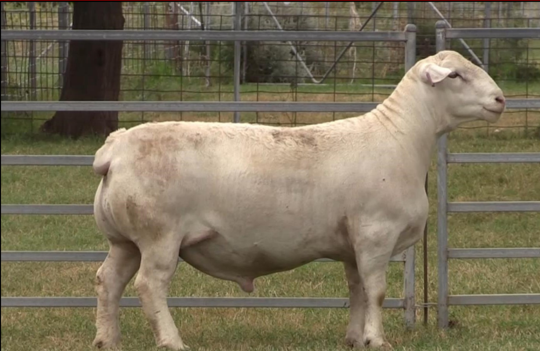
LOT 121 AMARULA SLICK 201503 - CONFORMATION 5 TYPE 5