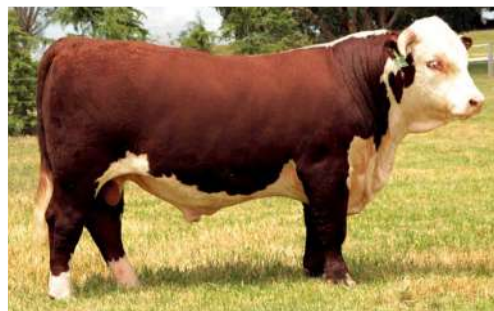
MATERNAL BROTHER: Mawarra Challenger Purchaser: Sheldon Park Herefords - $17,000 2015 Herefords Australia National (Wodonga)