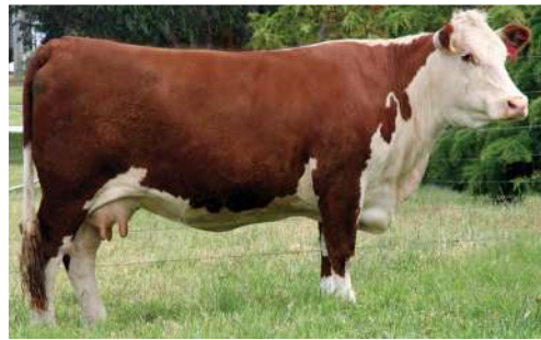
DAM: Mawarra Minerva 817