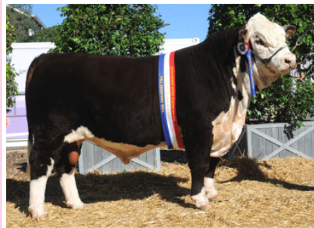
SIRE: Tycolah Jovial $80,000 Grand Champion 2012 Herefords Australia National (Dubbo)