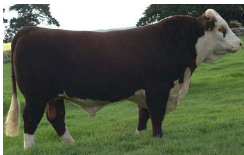
MATERNAL BROTHER: Mawarra You Beaut Purchaser: Lindsay family - $16,000 2012 Herefords Australia National (Wodonga).