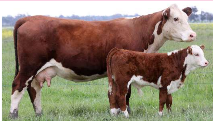
LOT 18: Minerva 1087