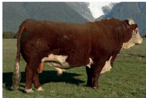
SIRE: Pourakino Downs Jasper (IMP NZL) (H)