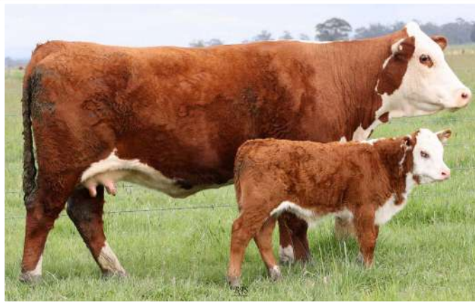
LOT 57: Mawarra Miss Titania 121