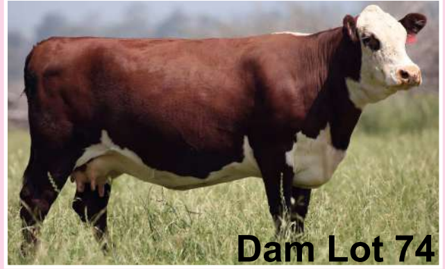
Dam Lot 74