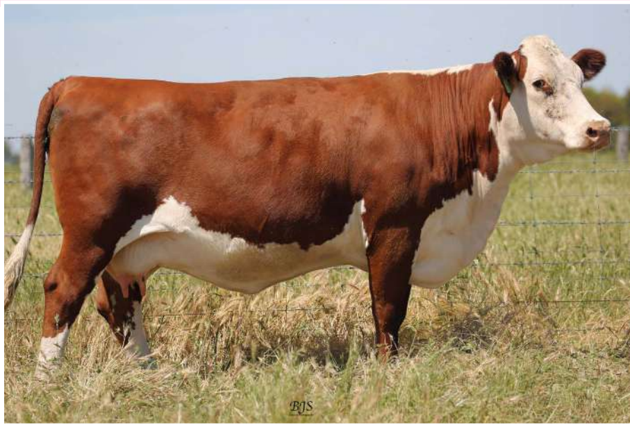
LOT 22: MAWARRA MINERVA 932