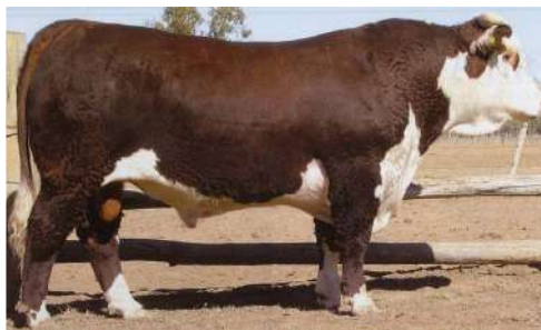
SIRE: Cootharaba Magnum