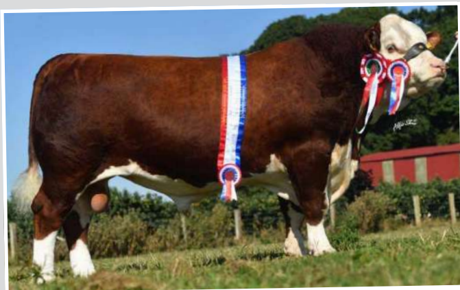
Richmount 1 Treadstone - Grand Champion National Balmoral Show, Northern Ireland. Sired by Mawarra Mustang J166.