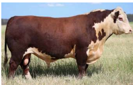
MATERNAL BROTHER: Showtime P277 Retained sire. Semen exported to UK & numerous EU countries