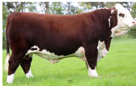
MATERNAL BROTHER: Terminator Q274 $53,000 - Oak Downs & Morganvale. NZ rights to Stoneburn Herefords - 2020 Herefords Australia National (Wodonga)