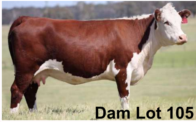
Dam Lot 105