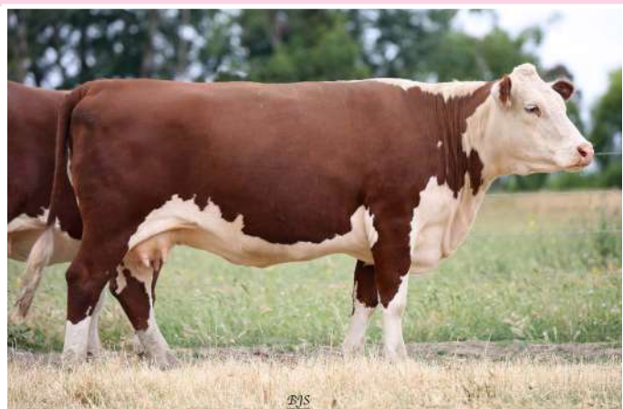
DAM LOT 42: Mawarra Irish Rose 004