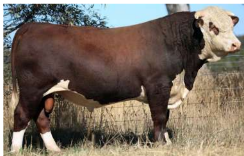
FULL BROTHER: Mawarra Hawkeye Purchaser: Phelan Herefords - $22,000 Top Price 2020 Mawarra Sale