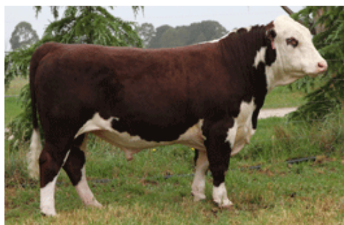
MATERNAL BRO.: M. Nothin'But A GoodTime Purchaser: Tummel Herefords - $15,000 Top price (Poll bull) 2016 Mawarra Sale