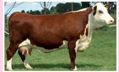
DAM: Mawarra Minerva 554