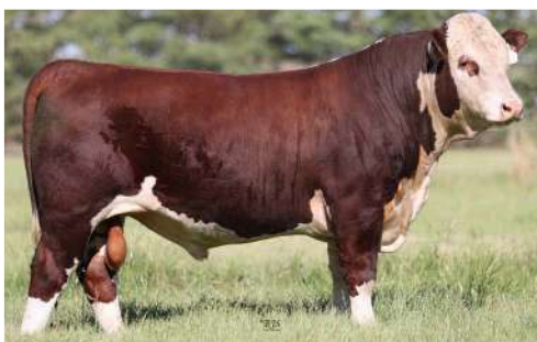
FULL BROTHER: Mawarra Jack R394 Retained Sire