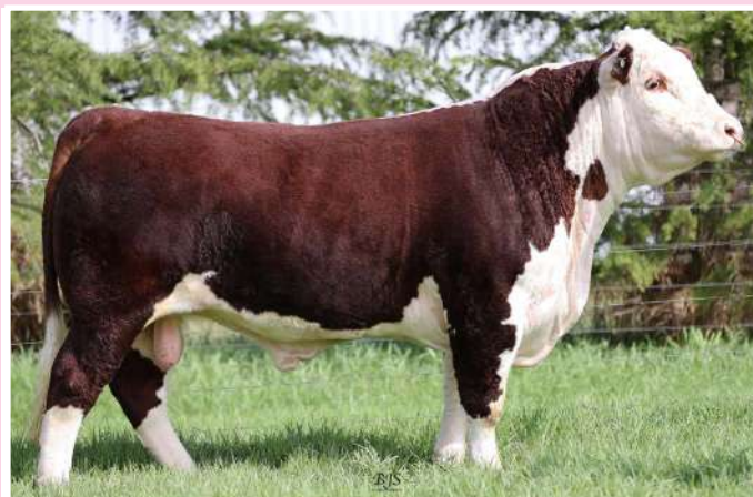
FULL BROTHER LOT 41: Mawarra Jabiru Purchaser: Melrose Herefords - $22,000 2022 Herefords Australia National (Wodonga)