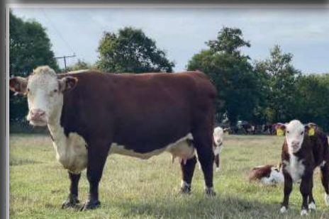
Mawarra Influential Q162 calves at Pulham Herefords, England.