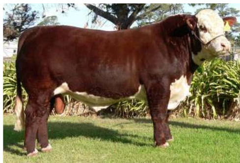
SIRE: Bowmont Storm C093 (H)