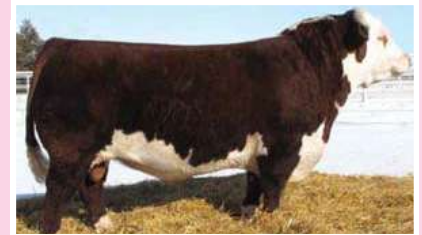
SIRE: SLDK Vendetta V-9