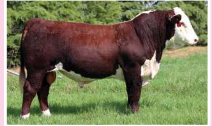
FULL BROTHER: Mawarra Rising Moon $5,000 Sleigh Pastoral