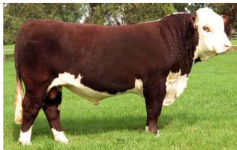
SIRE: Mawarra Little Ripa - $12,000 Purchaser: Oak Downs Poll Herefords Snr Champ. 2014 Herefords Aust. National (Dubbo)