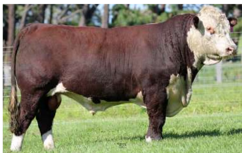
TOP SELLING SON: Mawarra Sahara Purchaser: Russell Foster - $22,000 2020 Sale