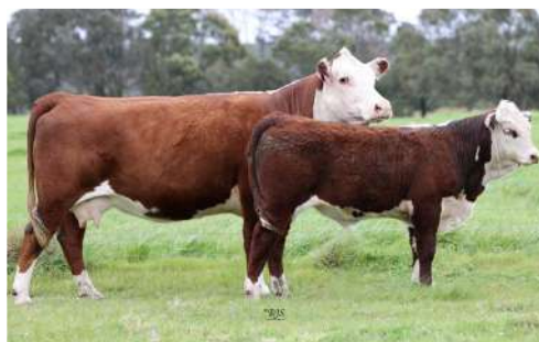
MISS TITANIA 087 (P) with 2022-born Star Attraction P033 calf at foot