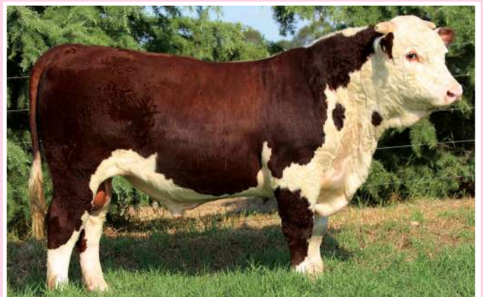
LOT 55 FULL BROTHER: M. Gangster - $10,000 Purchaser: Brendan Fitzgerald - 2019 Mawarra Sale