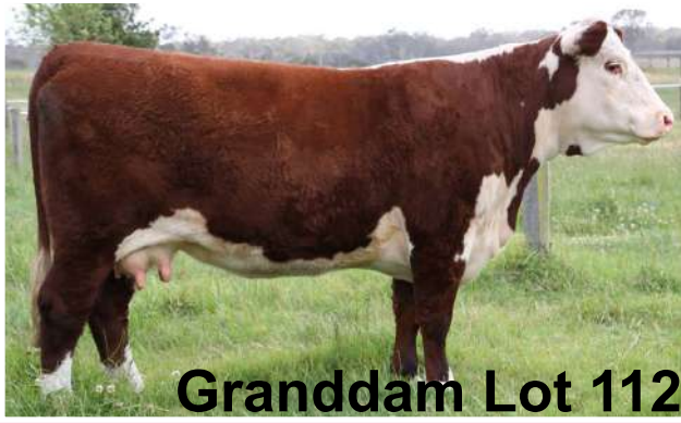
Granddam Lot 112