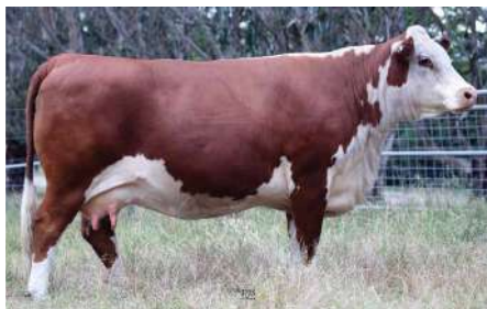
DAM: Mawarra Miss Titania 054 Two sons have averaged $46,500, and another two are retained as sires. Seven daughters currently in herd.