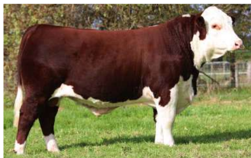
FULL BROTHER: Mawarra Ransom (P) Purchaser: SACUL Investment - $14,000 2019 Herefords Australia National (Wodonga)