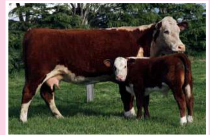
GRANDDAM: M. Impulse 63 - $3,000 Purchaser: S Reardon, 2016 Ladies Day