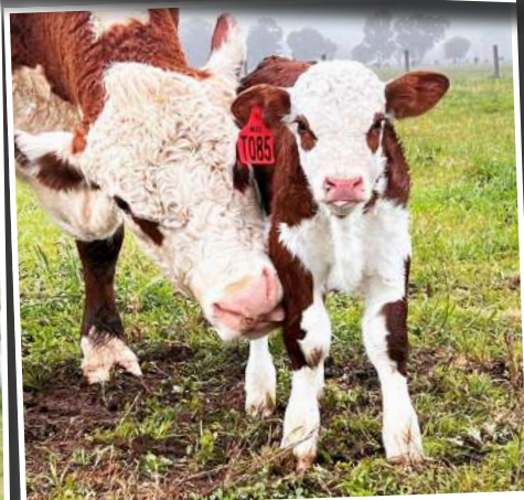
Mawarra Terminator Q274 son at Stirling Ag, Avenel.