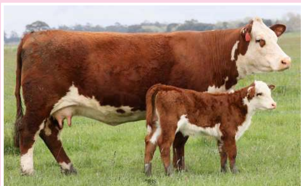
LOT 47 Mawarra Minerva 133