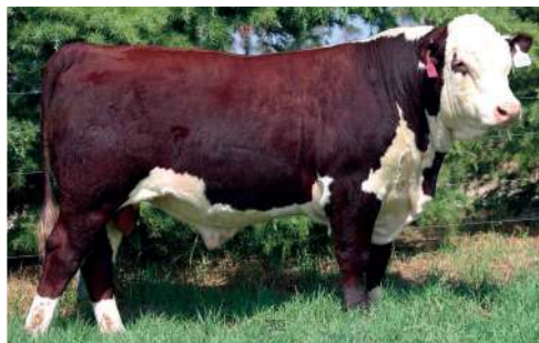
FULL BROTHER: Mawarra Ringer N201 Purchaser: K & K Skews - $13,000 2019 Mawarra Sale