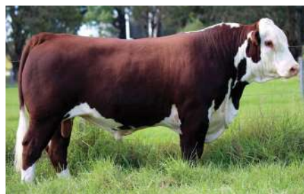
MATERNAL BROTHER: Private Eye M013 Retained Sire