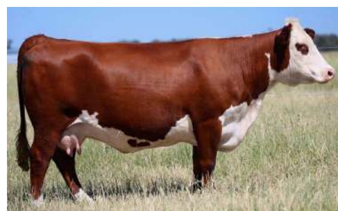
MATERNAL SISTER: Mawarra Minerva 996 - retained in herd