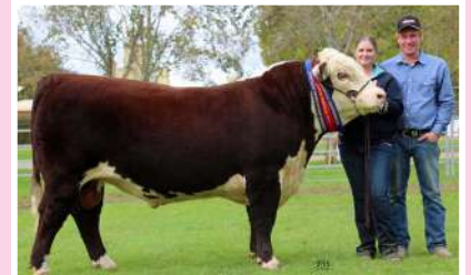
MATERNAL BROTHER: $13,000 Gunsmith - 2021 Herefords Australia National (Wodonga)