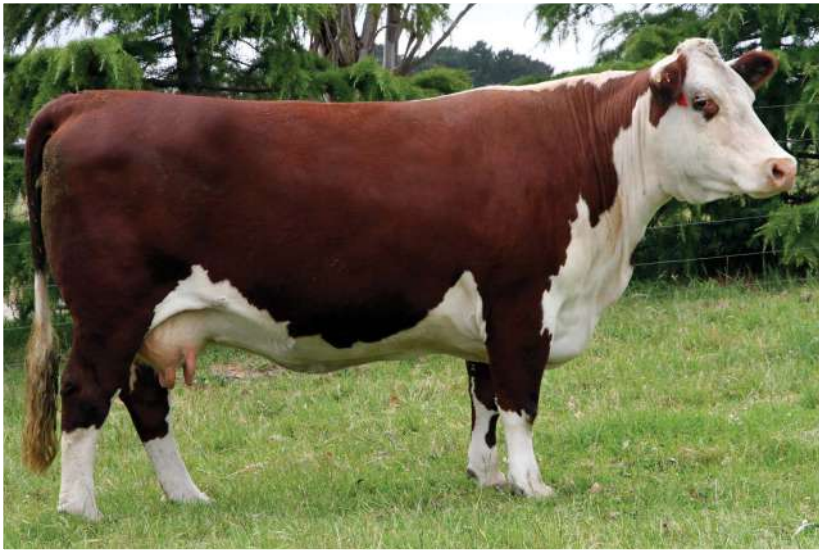
LOT 17 DAM: Minerva 816