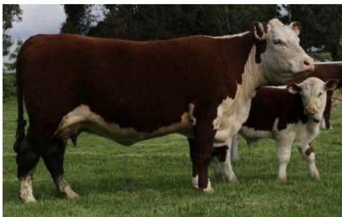
DAM: Mawarra Minerva 020