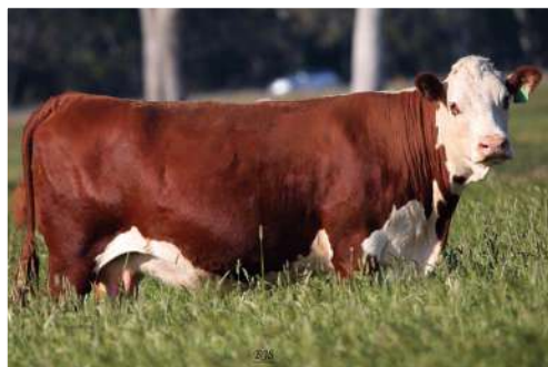
DAM: Mawarra Minerva 828