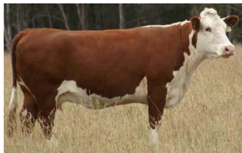
DAM: Mawarra Minerva 620 (H)