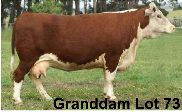
Granddam Lot 73