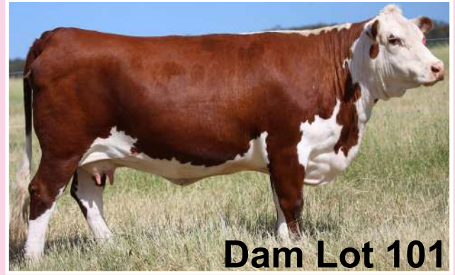
Dam Lot 101