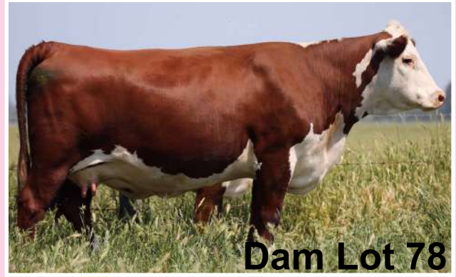
Dam Lot 78