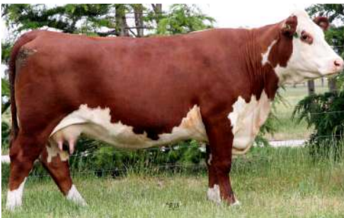
DAM: Mawarra Minerva 855 - DONOR $6,000 - Graham Genetics - 2020 Ladies Day Sale