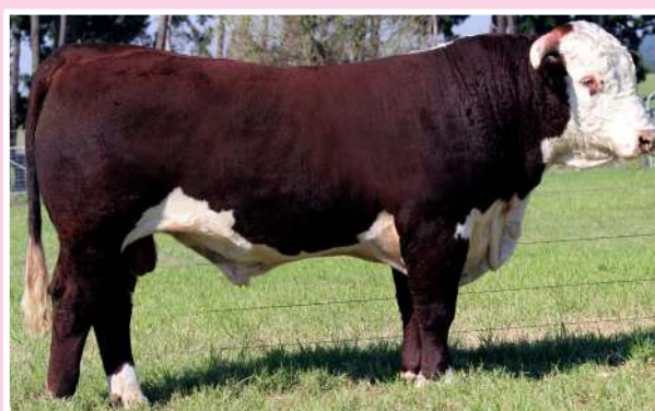
Maternal brother to Lot 47: Mawarra Extra Special - $12,000 Pretty family - 2017 Herefords Aust. National (Wodonga)