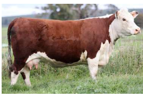
MATERNAL SISTER: Minerva 1044 Sire: Mawarra Daybreak