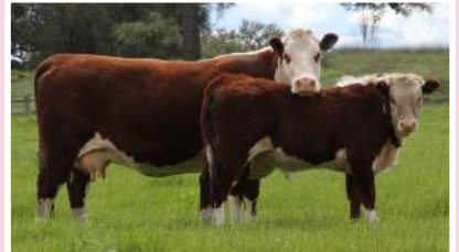
DAM & MATERNAL BROTHER: Minerva 816 with Mawarra Five Star (7 months)