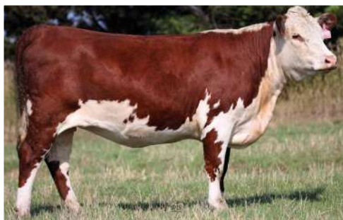
MATERNAL SISTER: Mawarra Tabitha 046 (P) Purchaser: Robrick Lodge - $9,000 2020 Ladies Day Sale