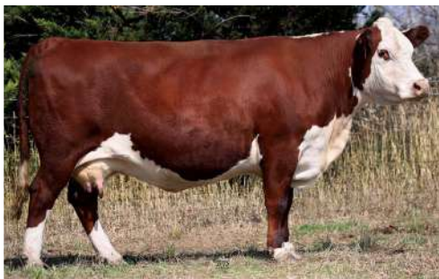
DAM: Mawarra Miss Titania 043