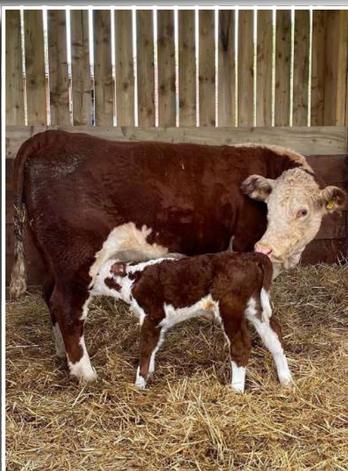
A brand new Showtime P277 calf at New Dawn Herefords, England.