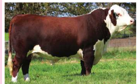
MATERNAL BROTHER: Rhinestone $40,000 - Yarram Park Herefords 2019 Herefords Aust. National (Wodonga)