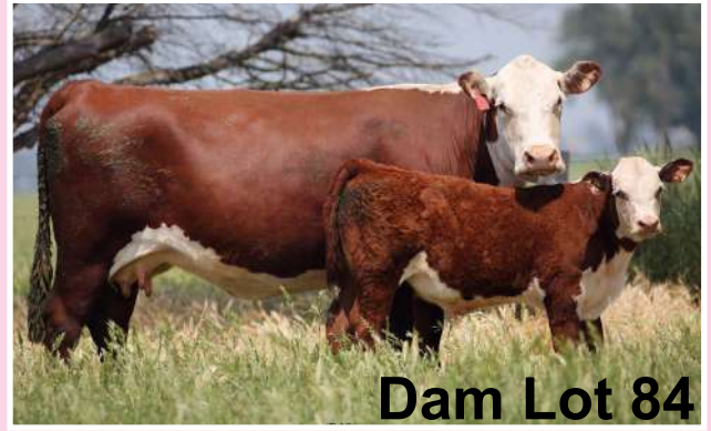
Dam Lot 84