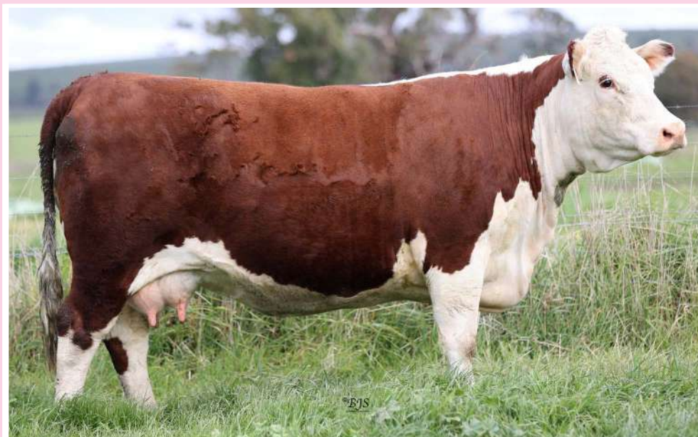
LOT 55 FULL SISTER: Mawarra Minerva 1044