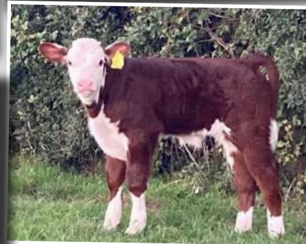
Mawarra Influential Q162 calf at Haven Herefords, England.