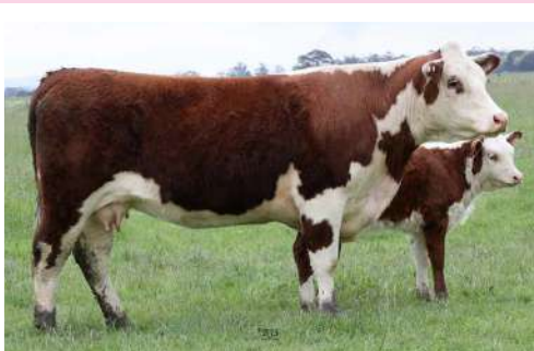
FULL SISTER: Mawarra Minerva 1089