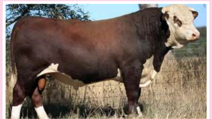
FULL BROTHER: Mawarra Hawkeye

POURAKINO DOWNS JASPER (IMP NZL) (H) MAWARRA DAYBREAK (AI) (ET) (H) MAWARRA DOREEN 225 (H)