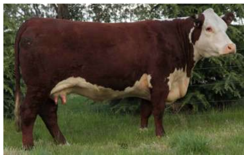
DAM: Mawarra Tabitha 006 (P) 5 sons to $35,000 av. $15,800 and granddam of $130,000 Mawarra Ultra Star R182