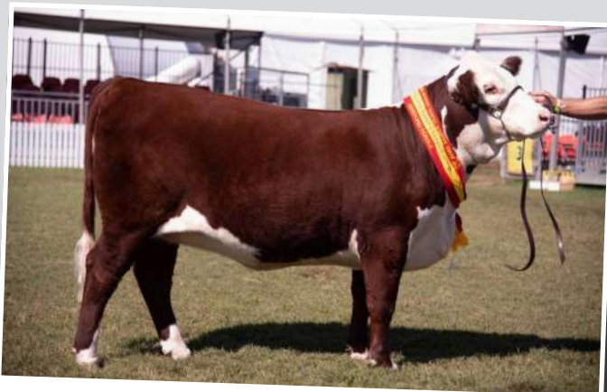
Kianma Matchless R010 - sired by Mawarra Outstanding L140 - Reserve Junior Champion Heifer - 2022 Royal Sydney Show.