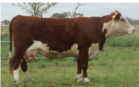
GRANDDAM: Mawarra Minerva 549 - DONOR Sons sold to $16,500