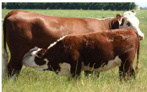
DAM: Mawarra Miss Titania 302 with Mawarra Miss Titania 440 at foot