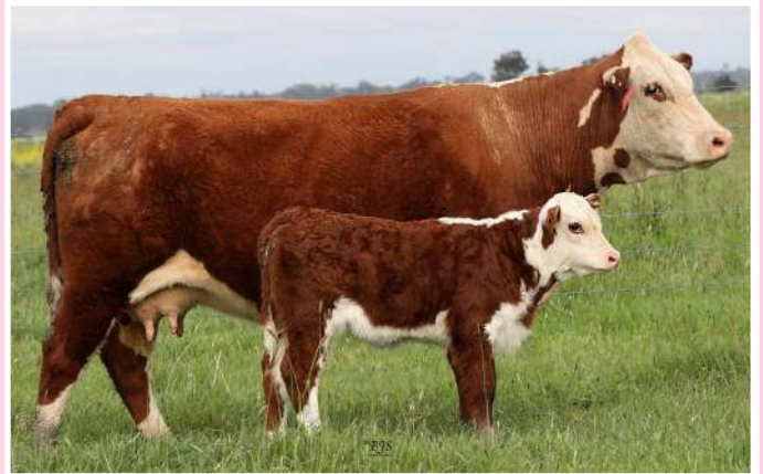
LOT 61: Mawarra Tabitha 039