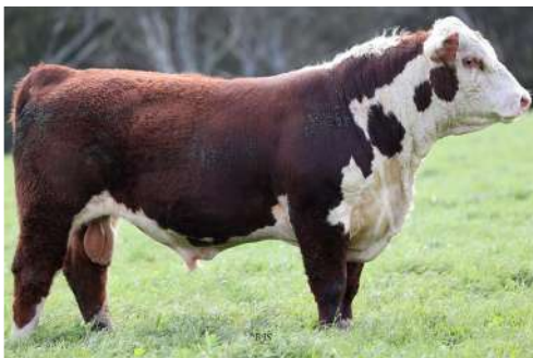
SON: Mawarra Vodka S037 Sire: Mawarra Showtime P277