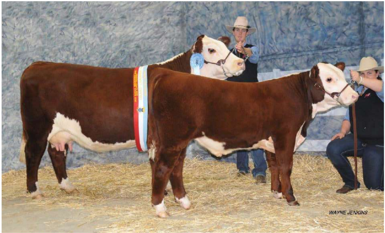
LOT 19 DAM: MAWARRA MISS TITANIA 458