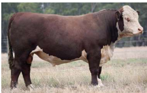
SON: Mawarra Superior - $30,000 Purchaser: Yarram Park Herefords Top Price 2020 Mawarra Sale