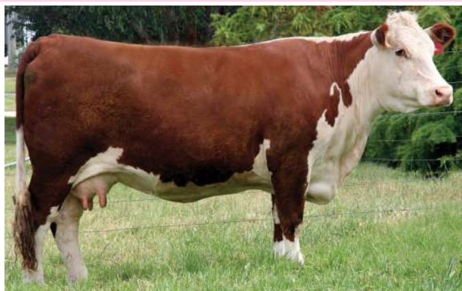
LOT 55 DAM: Mawarra Minerva 817