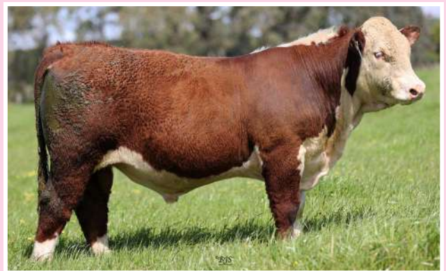
Mawarra Kit Kat S202 (H) - To be offered in 2023 Dam: Mawarra Minerva 1087 Sire: Mawarra Hugo P190 (H)