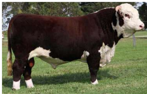
SIRE: Mawarra Daybreak K451