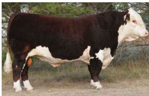
SIRE: Minlacowie Jubilant J123 (PP) $95,000 - 2016 Herefords Australia National (Wodonga)