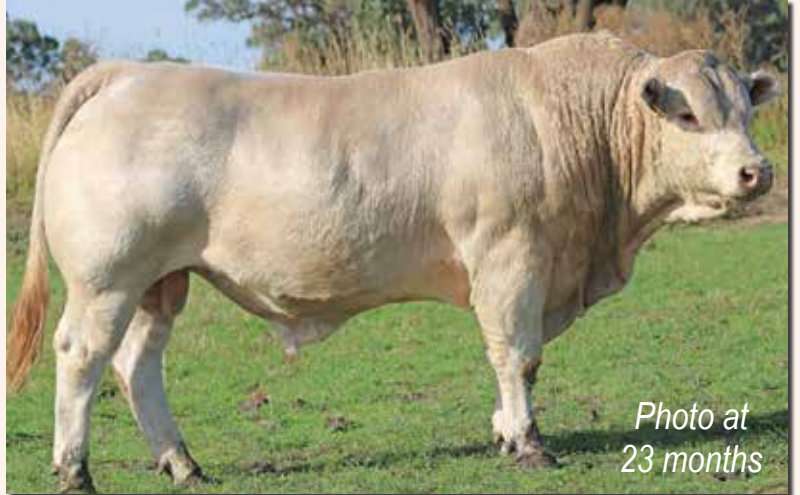
Photo at 23 months