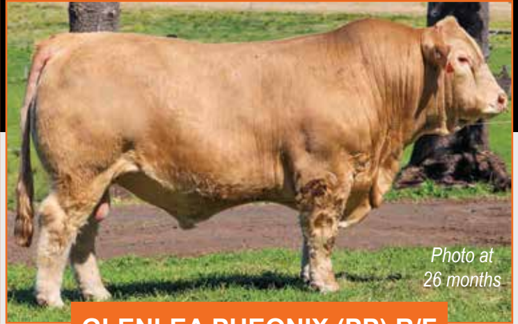
Photo at 26 months

Powerful sire. Carcass and growth with 100% apricot calves out of white cows. His first yearling progeny sell in 2023.