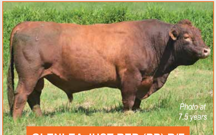
Photo at 7.5 years

Powerful carcass sire leaving 100% apricot progeny from white cows. His first release of progeny at this sale last year, as calves at foot, created high interest. Wait till you see his yearling progeny in 2023!