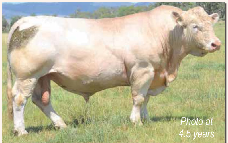
Photo at 4.5 years

After inspecting many sires meeting our selection criteria (including being pp polled, extra quiet temperament, sound feet, strength of type) Leopold was the best beef type bull. Having the added yield and doability that the Allednaw cattle are known for so that his progeny will have real world commercial appeal and many sons will make sale bulls and heifers be retained. So many low BW bulls just produce male progeny that have no carcass or doability and are just plain types that become average steers. Finding low BW sires that produce seedstock progeny is always a great challenge. We are confident Leopold R45 is one of those bulls.