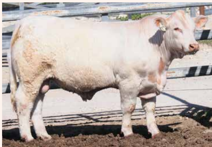
Our top priced yearling bull (16 months old) at our recent Roma Bull Sale, MAW Glenlea Neptune S31 (PP) sold for $24,000. "

Videos will be produced well ahead of the sale of both cow and calf at foot, and will be available to view on the AuctionPlus website.