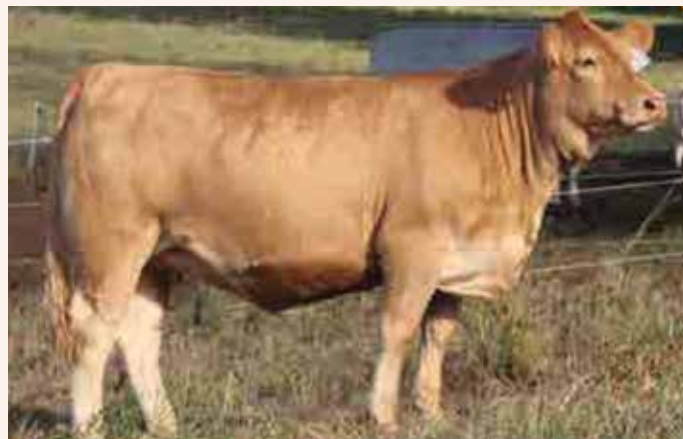
Lot 1 in this sale Glenlea Chiffon 10th (P) R/F when she was 12 months old.

Videos will be produced well ahead of the sale of both cow and calf at foot, and will be available to view on the AuctionPlus website.