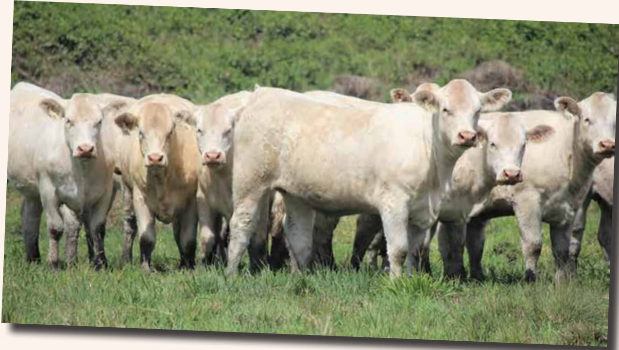
Joined Glenlea / Fairfield Heifers in the sun.