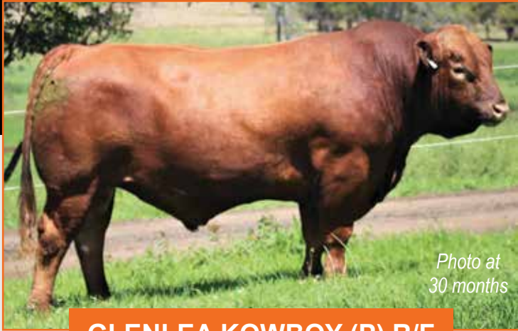
Photo at 30 months