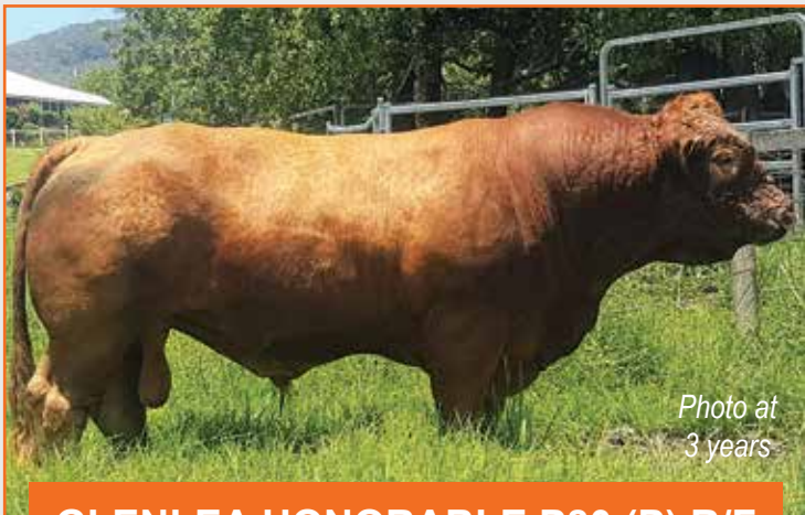
Photo at 3 years

Fast becoming a trait leading sire for all growth traits, top 1% of the breed. We will have 2-year-old progeny for sale in 2023.