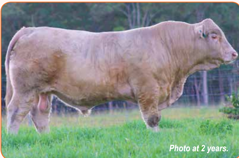
Photo at 2 years.

COMMENTS: Trait leading sire for growth, fat cover with moderate BW and excellent EMA.