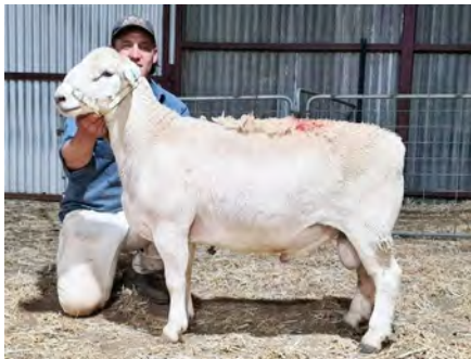
Anden 19-1868: Top priced UltraWhite ram of $16,300 in 2020.