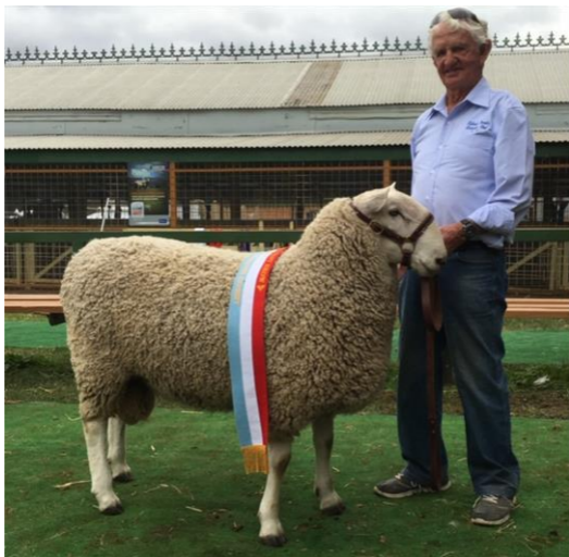
TALKOOK CENA 8/2014 F8447 Magnificent wool sheep Sired by Retallack 1107/2011 F5638