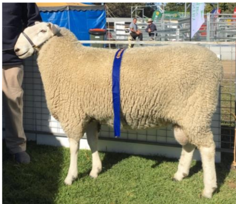
TALKOOK MOUNTAIN 28/2014 F8448 This ram has been responsible for consistently producing huge eye muscle in any offspring he Sires Sire Retallack 215/2007 F1226