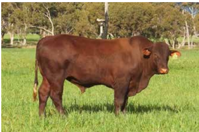
Rockingham Ritchie R134 (P) – Lot 12