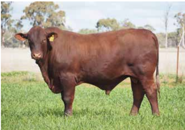
Rockingham Rover R118 (P) – Lot 4