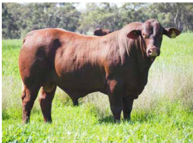
Rockingham Roulette R140 (P) - Lot 5