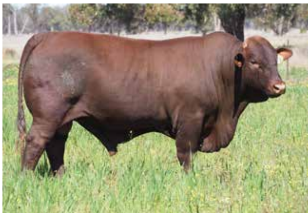
Rockingham Rogue R176 - Lot 3