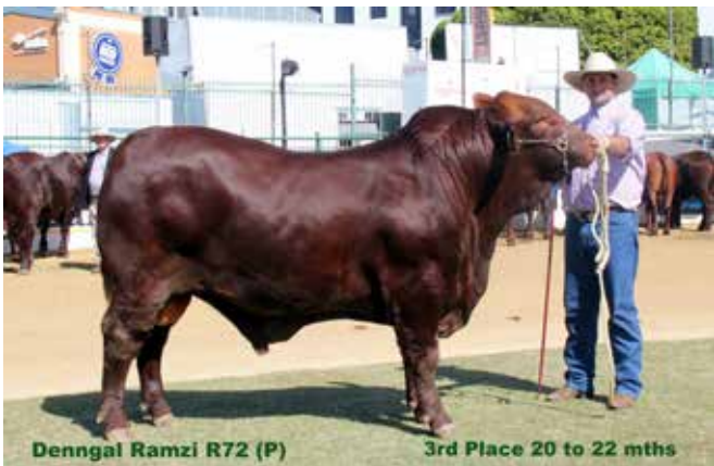
Dennal Ramzi R72 (P) – Lot 25