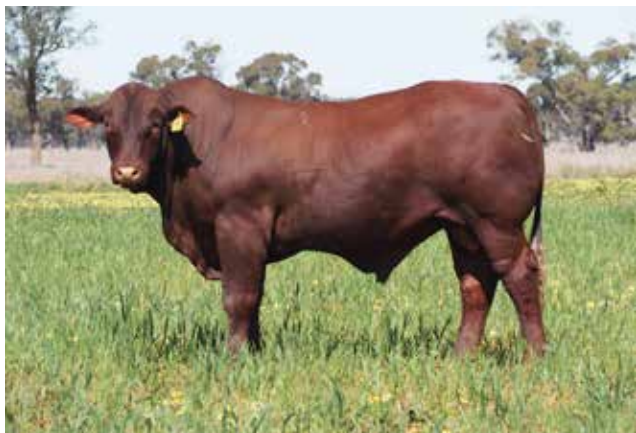
Rockingham Romano R130 (PS) - Lot 10