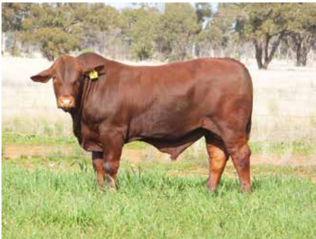
Rockingham Ringo R14 (P) – Lot 2