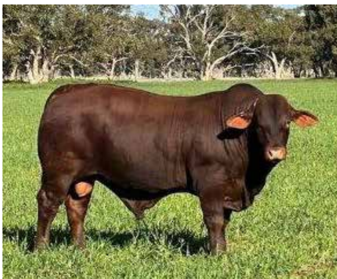
Rockingham Riverina R210 - Lot 13