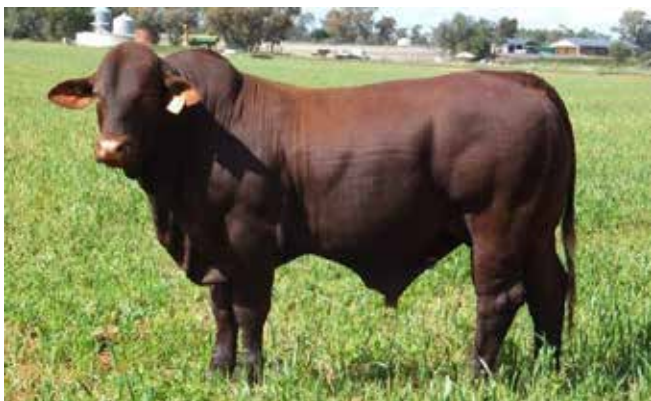
Rockingham Rocco R200 (P) – Lot 21