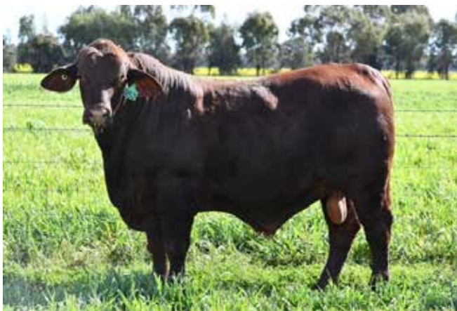
Denngal Ruben R52 (P) - Lot 27