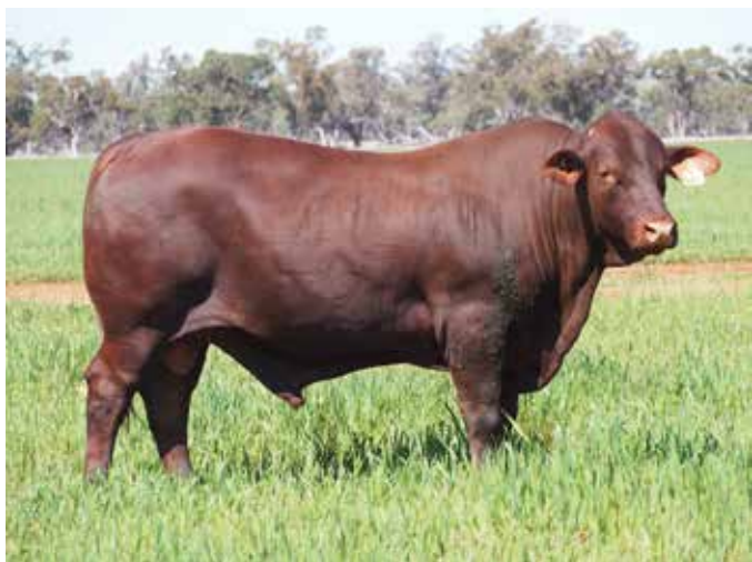
Rockingham Rufus R204 (P) - Lot 1