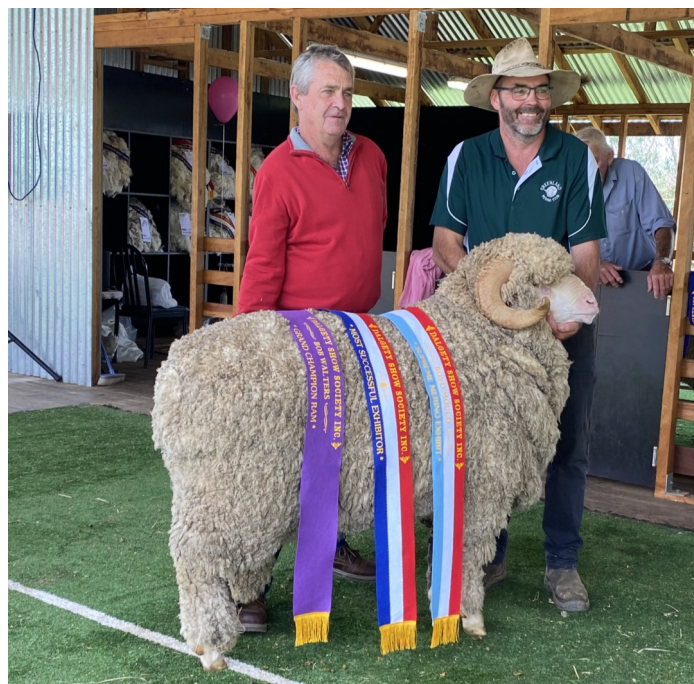
Ram Won Supreme at Dalgety Show 2022

One of the most important decisions to consider when breeding Merinos is to aim for a well balanced sheep. To do this you must avoid focusing on extreme traits. The best performers for balance is the average or a little above average for all the measurable traits. The ultimate aim at Greenland has always been to breed the very best quality wool as possible. Wool quality is the key to success in eliminating fleece rot and dermatitis. The fibre must have distinct crimp definition with well aligned fibre of white waterproof wool with the correct chemistry. Good quality wool that dries quickly is the answer to dramatically reducing fly strike and thus extremely important as the industry is already experiencing chemical resistance. Good quality wool and micron are key drivers for good competition at the wool sales