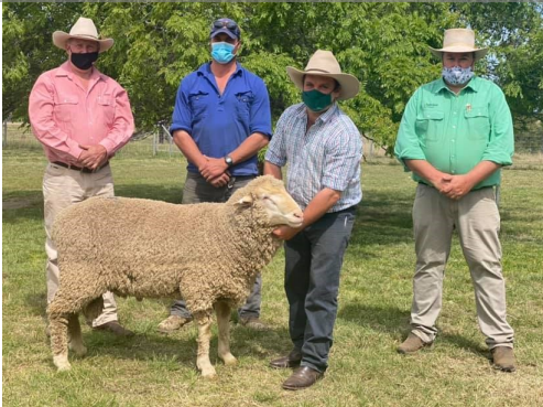
Top Price CP Poll - $8,250 to Temerity Pastoral, Coolah

Our 2021 Ram Sale was a great success, with a full clearance of 100 rams. We will be offering 100 rams again this year, with 66 polls and 34 horned rams. We would like to thank everyone who supported us at the 2021 ram sale, as well as throughout the year.