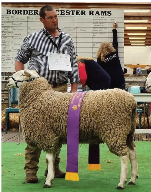
Above: Reserve Junior Champion and Grand Champion Ram - Adelaide Royal 2022.