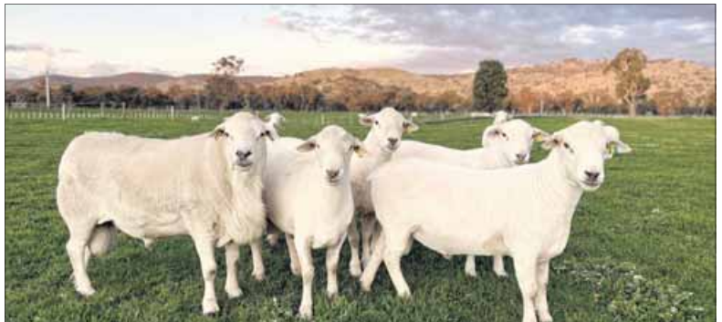
HANDSOME BOYS: 'Number 1' on left, is the outstanding sire of the majority of ram lambs going to auction at Balmattum's October sale.

"We've never been disappointed with any of his progeny.