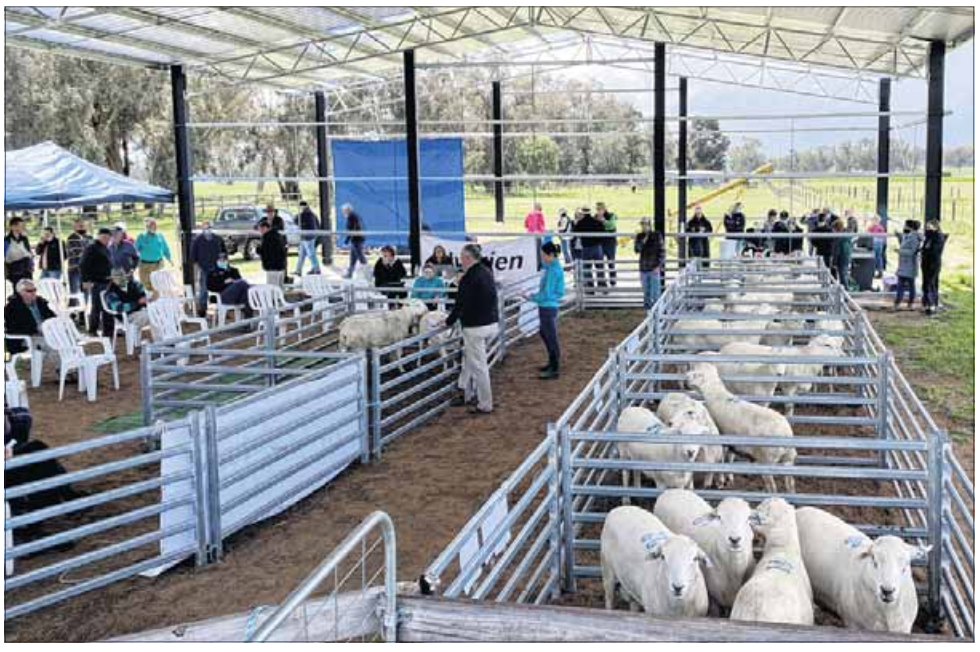
WHITE GOLD: Balmattum's 2021 inaugural ram sale was a huge success, with this year looking to be bigger and better with up to 30 rams going under the hammer.

With dams from Tattykeel, Campden Park and some Balmattum-bred beauties, the October line-up of ram lambs are an investment in the future, with all sheep going under the hammer wearing the blue tag of authenticity to the breed.