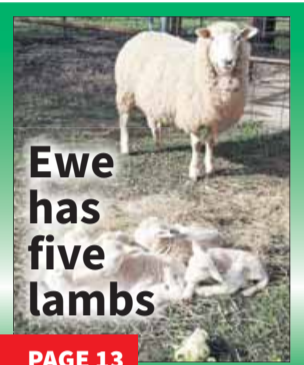
Ewe has five lambs