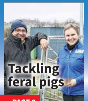
Tackling feral pigs