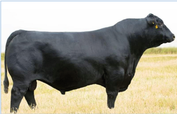
Jindra Megahit USA17731559