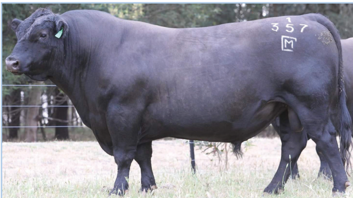
Pathfinder Genesis SMPG357