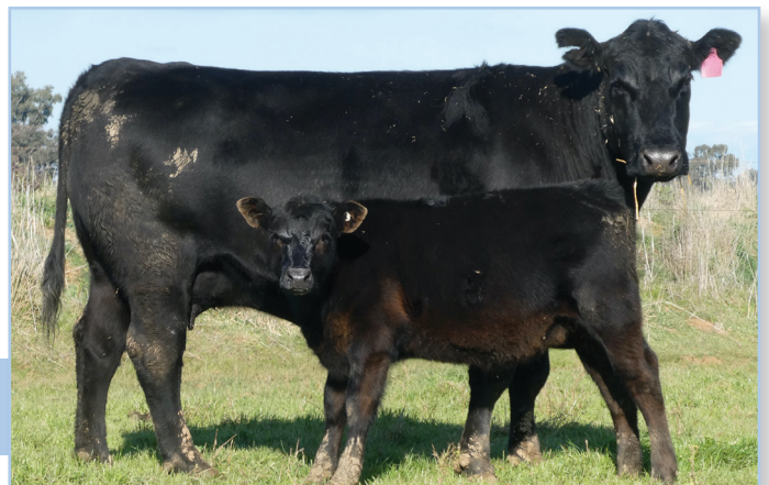
Pathfinder Total 854, Dam of Lot 16 (Calf sired by Andes Seven Bart R34)