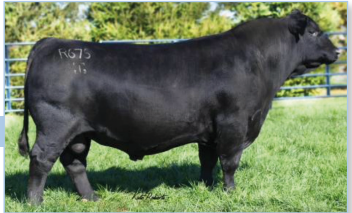
GAR Reliant USA18669357