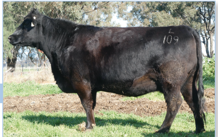
Anvil Eclipta, Dam of Lot 2