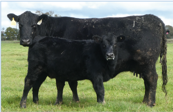
Anvil Champagne, Dam of Lot 7 (Calf sired by Exar Pillar)