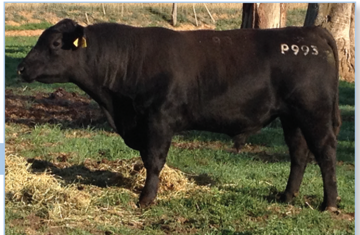
Landfall Discovery TFAP993