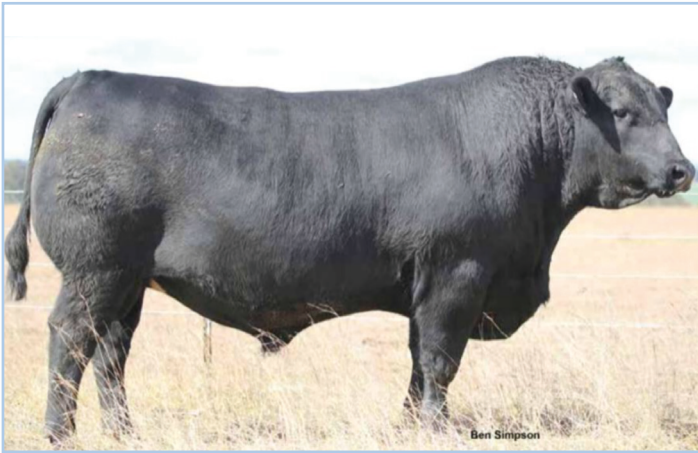
Clunie Range Legend NBHL348