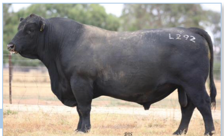
Topbos Leading Edge DBLL292