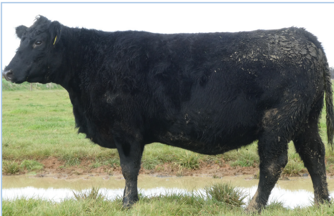
Anvil Malvern Pride, Dam of Lot 8