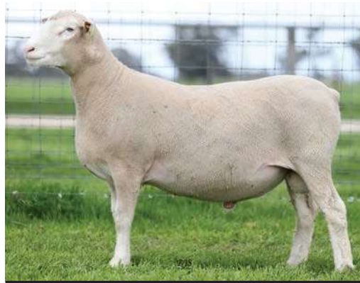
POLL DORSET Lot 48 095 TW