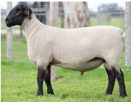
SUFFOLK Lot 5 954