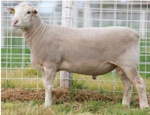
WHITE SUFFOLK Lot 27 246 TW