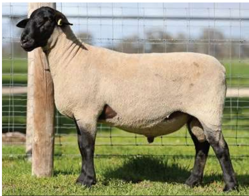
SUFFOLK Lot 4 951 TW