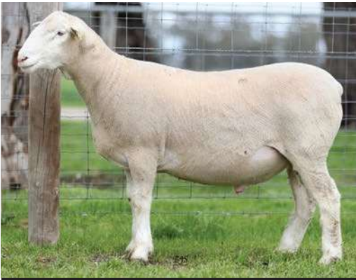
POLL DORSET Lot 47 272