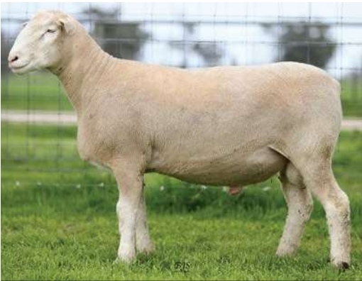
POLL DORSET Lot 35 361 TW