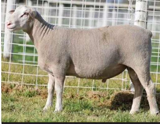
WHITE SUFFOLK Lot 19 297