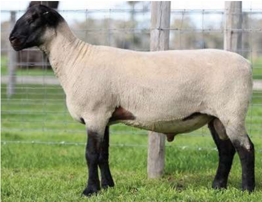
SUFFOLK Lot 9 840