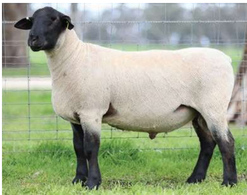
SUFFOLK Lot 6 827 TW