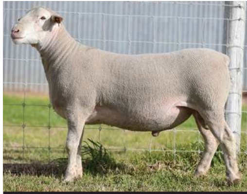
WHITE SUFFOLK Lot 22 135 TW