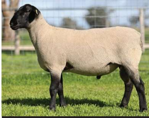
SUFFOLK Lot 14 756 TW