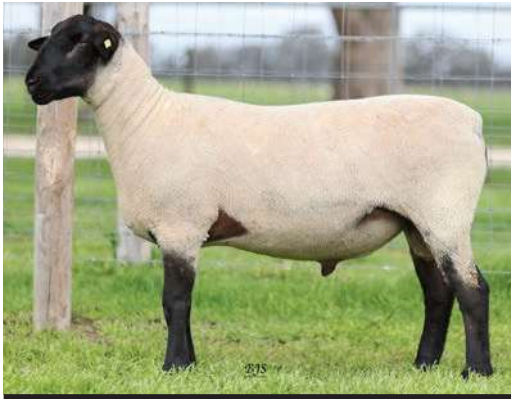
SUFFOLK Lot 15 858