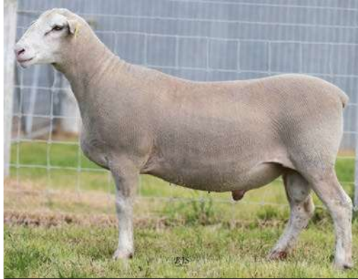
WHITE SUFFOLK Lot 26 517 TW