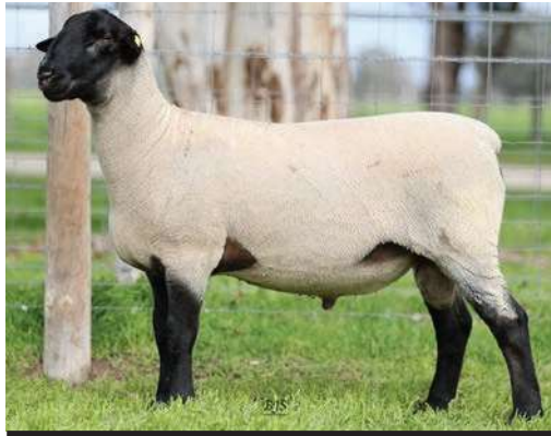
SUFFOLK Lot 16 968