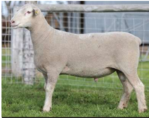
WHITE SUFFOLK Lot 18 089 TW