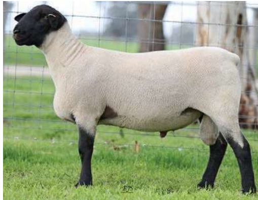
SUFFOLK Lot 10 804