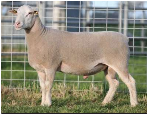
WHITE SUFFOLK Lot 23 268