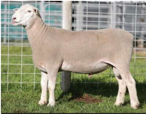
WHITE SUFFOLK Lot 17 107 TW