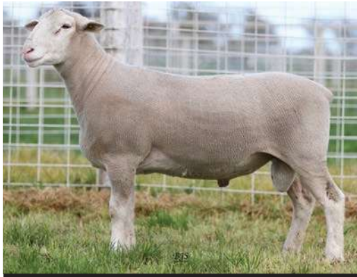
WHITE SUFFOLK Lot 21 378