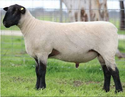
SUFFOLK Lot 7 859