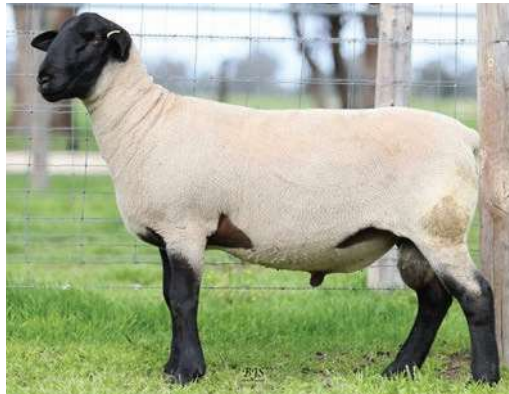
SUFFOLK Lot 12 922