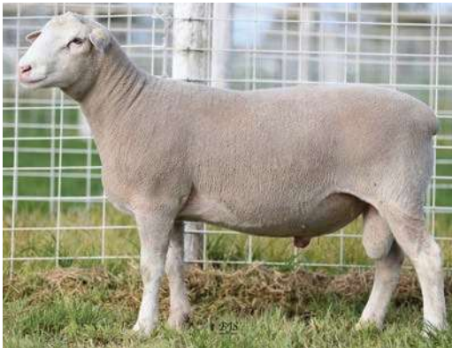
WHITE SUFFOLK Lot 29 055 TW