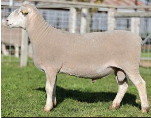
WHITE SUFFOLK Lot 32 233