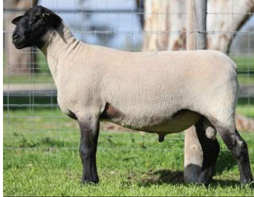
SUFFOLK Lot 8 802 TW