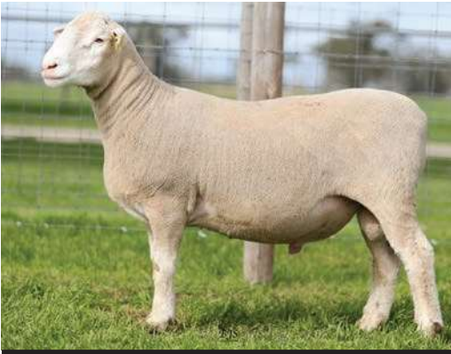
POLL DORSET Lot 45 183 TW