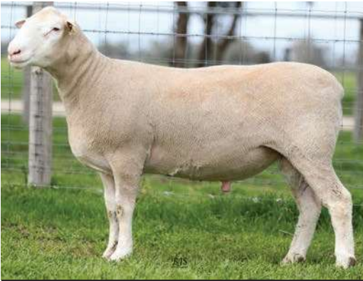
POLL DORSET Lot 33 194