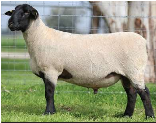
SUFFOLK Lot 2 953 TW