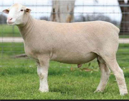
POLL DORSET Lot 43 287 TW