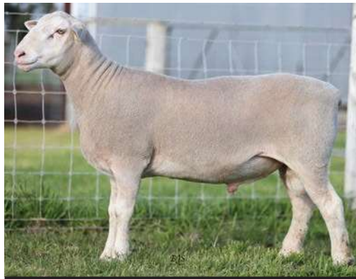
WHITE SUFFOLK Lot 24 088 TW