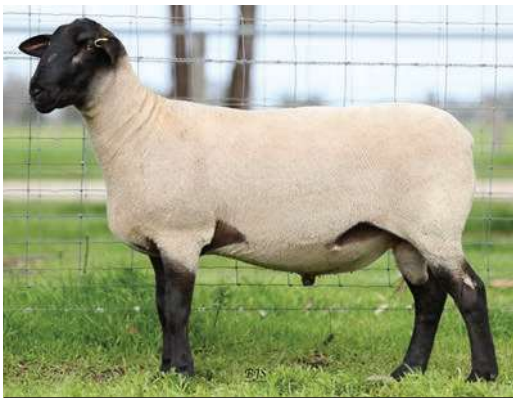
SUFFOLK Lot 3 955