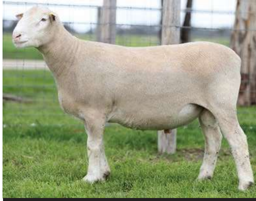
POLL DORSET Lot 44 322