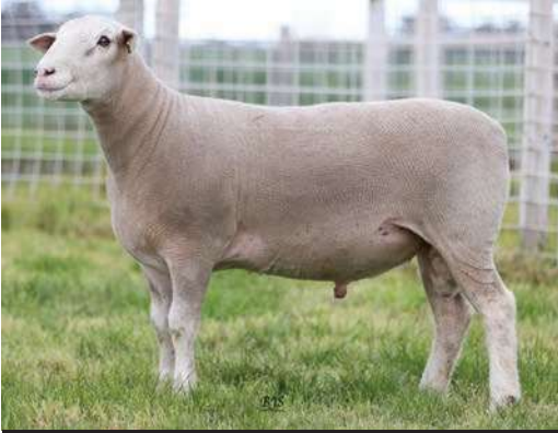
WHITE SUFFOLK Lot 31 333 TW