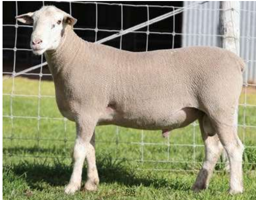
WHITE SUFFOLK Lot 28 143 TW