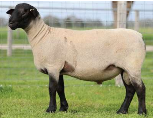
SUFFOLK Lot 11 958 TW