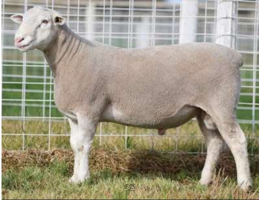
WHITE SUFFOLK Lot 25 300