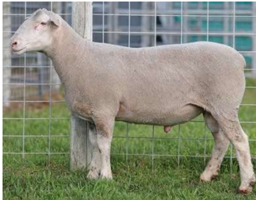
WHITE SUFFOLK Lot 30 061 TW