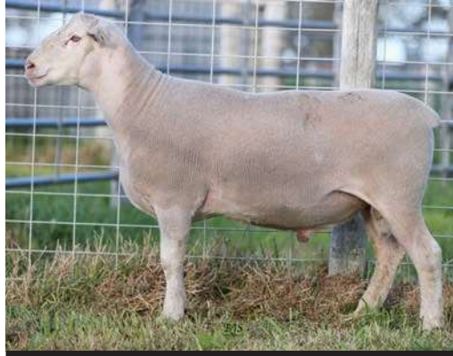
WHITE SUFFOLK Lot 20 066