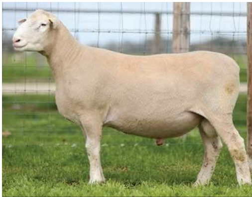
POLL DORSET Lot 36 149 TW