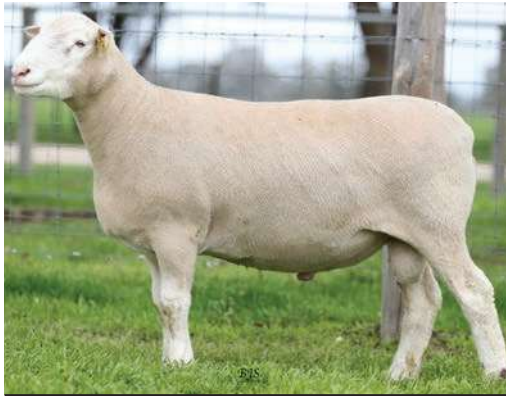
POLL DORSET Lot 34 163