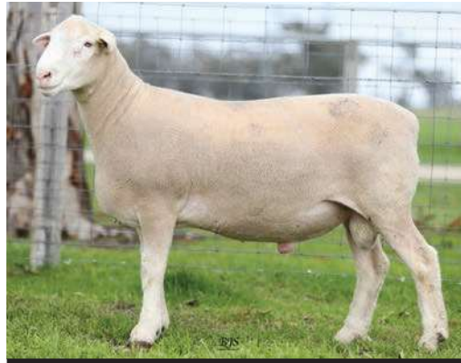
POLL DORSET Lot 46 159