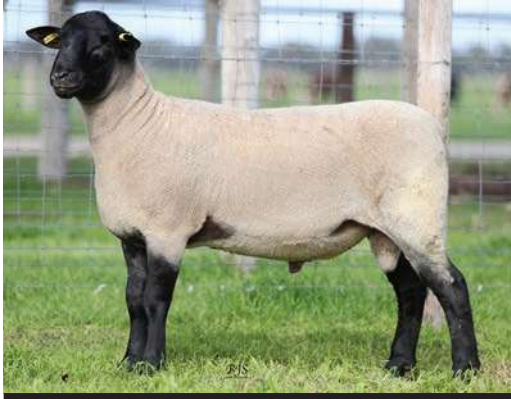
SUFFOLK Lot 13 864 TW