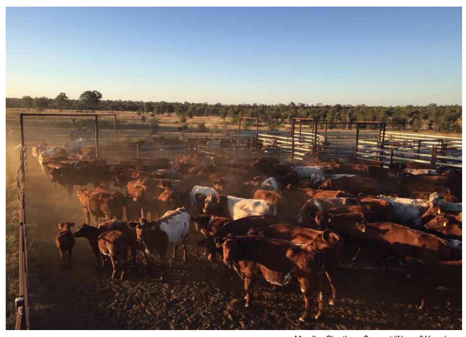
Marellan Shorthorn Cows at "Nunya" Yamala