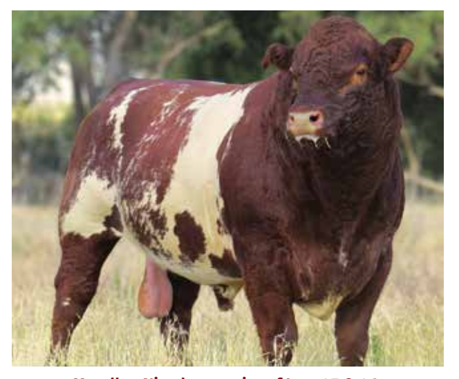
Marellan Nicodemus, sire of Lots 45 & 46.