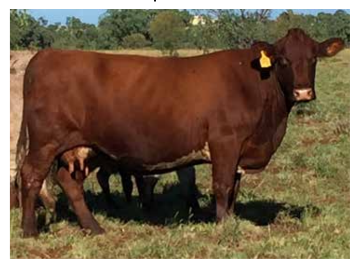
Marellan Camelot 0078, dam of Lots 29, 45 & 46.