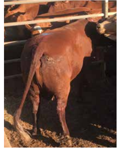
Our 11yr old Brahman X Shorthorn cow was awarded the heaviest cow of the show and set the all-time record at 900kg.