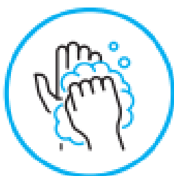
Hygiene and cleaning