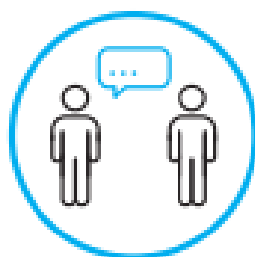
Wellbeing of staff and customers