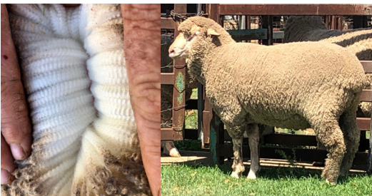
Grandson 18-0479. Used extensively in the Stud