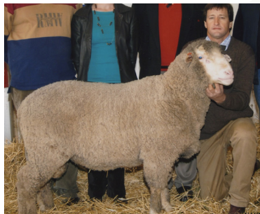
Animal ID: MACQUARIE - 174342

Reference sire MD Majestic 17-4342 .... highest ranked 2017 drop Registered Dohne ram. Retained for stud use.