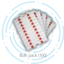
Bulk pack (100)