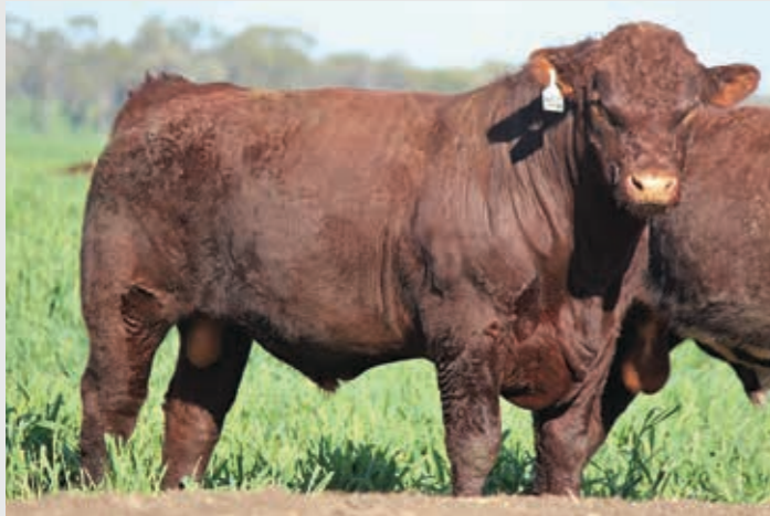
LOT 22 THE GROVE NEWPORT Q0289 (P)