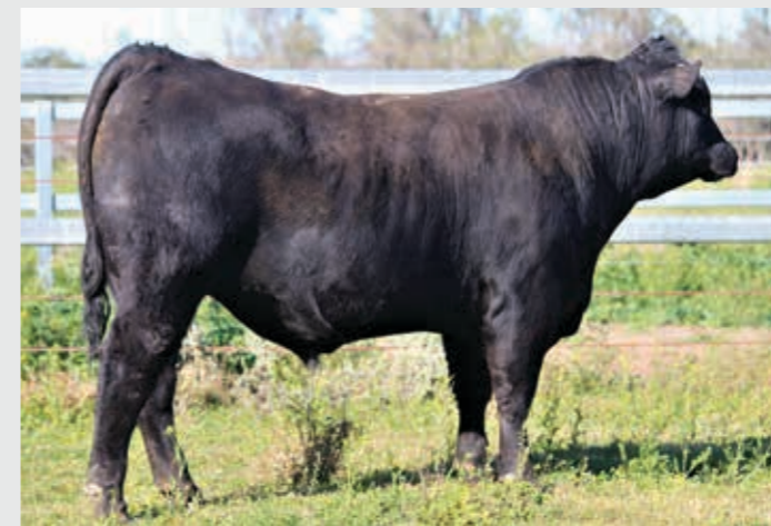
LOT 122 THE GROVE R0097 3/4 AA 1/8 SE (DR) (P) (AI)