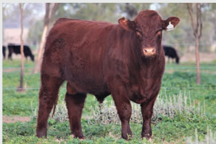
LOT 117 THE GROVE MAJOR R0086 (P) (AI)