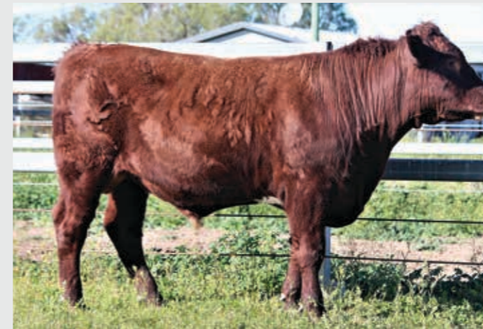
LOT 118 THE GROVE TERABYTES R0092 (P) (AI)