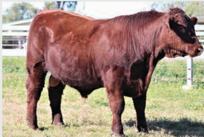
LOT 112 THE GROVE SPECIAL R0100 (P) (AI)