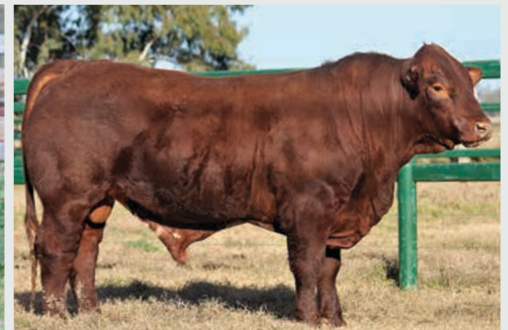
LOT 142 THE GROVE Q0859 1/4 SENEPOL (DR) (P)