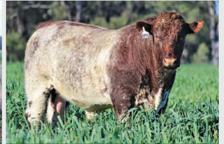
LOT 14 THE GROVE ANDROID Q0993 (P) (AI)