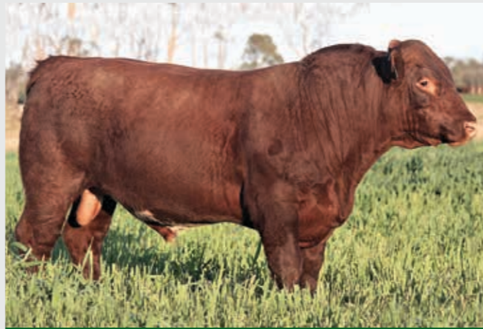
LOT 35 THE GROVE HARDWARE Q0874 (P)