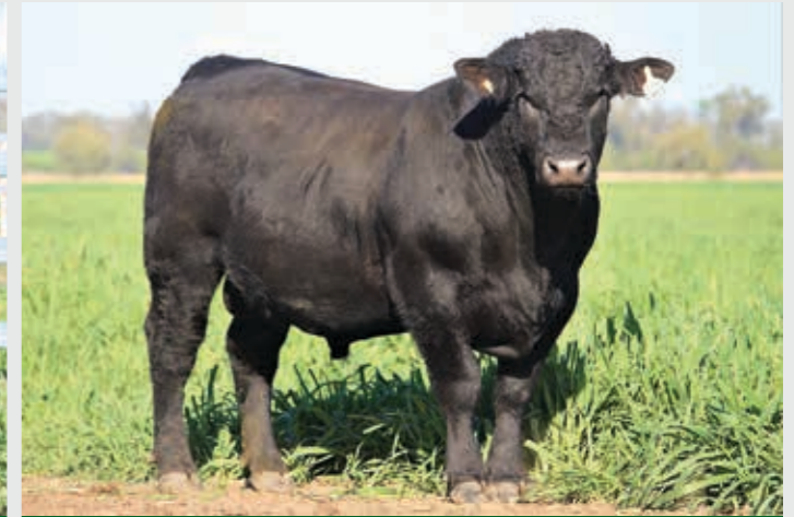
LOT 124 THE GROVE Q0787 3/4 ANGUS (DR) (P) (AI)