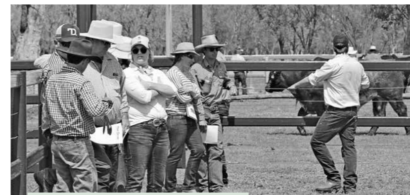
The Grove 2020 Bull Sale

IMF: Intra-muscular Fat Percent EBV (%) is an estimate of the genetic difference in the percentage of intra-muscular fat at the 12/13th rib site in a 300kg carcase. Depending on market targets, larger more positive values are generally more favourable.