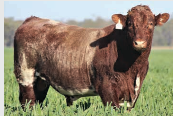
LOT 82 THE GROVE CHAINLINK Q0918 (H) (AI)