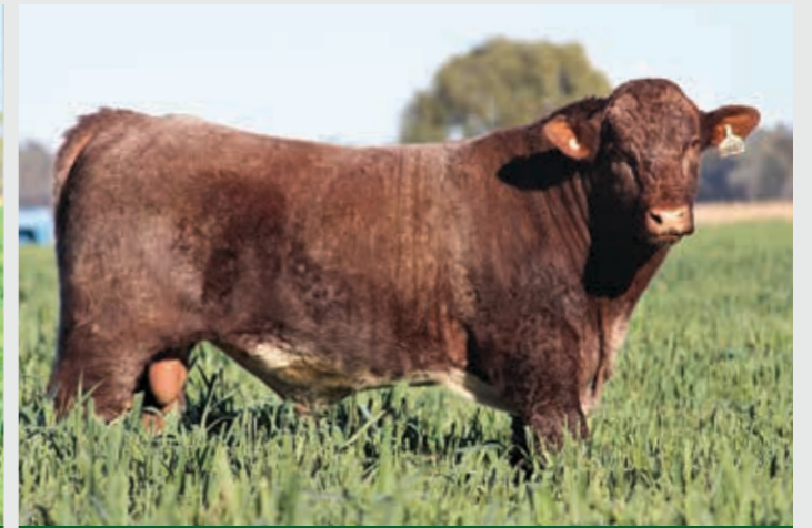
LOT 91 THE GROVE MEGABYTES Q1001 (P) (AI)