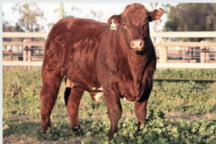
LOT 111 THE GROVE GOODAR R0105 (P) (AI)