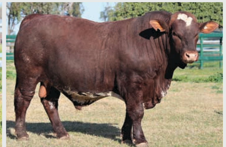
LOT 143 THE GROVE Q0904 1/4 SE 1/8 BB (DR) (S)