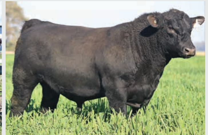
LOT 123 THE GROVE Q0532 3/4 ANGUS (DR) (P)