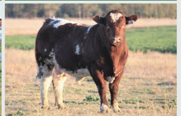
LOT 19 THE GROVE XBOX Q0738 (P)