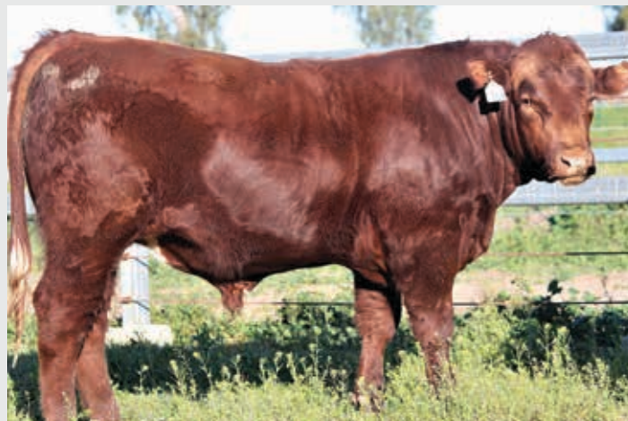
LOT 110 THE GROVE R0081 1/8 AA 1/8 SE (DR) (P) (AI)