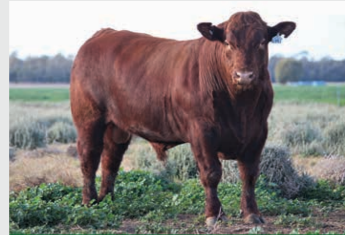
LOT 2 THE GROVE BELMONT Q0391 (P) (AI) (ET)