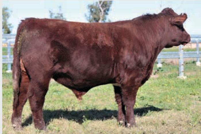
LOT 113 THE GROVE SPECIAL R0099 (P) (AI)