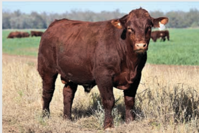
LOT 46 THE GROVE ANDROID Q0577 (P)