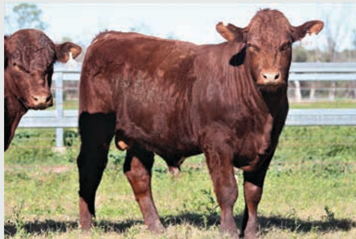
LOT 107 THE GROVE GOODAR R0103 (P) (AI)