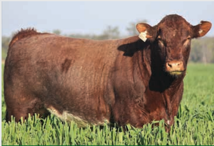
LOT 20 THE GROVE KILOBYTES Q0356 (P)