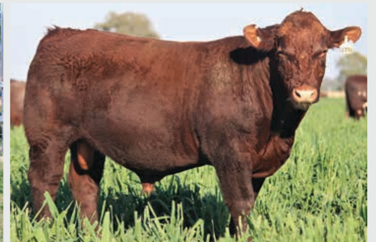
LOT 10 THE GROVE ANDROID Q0991 (P) (AI)