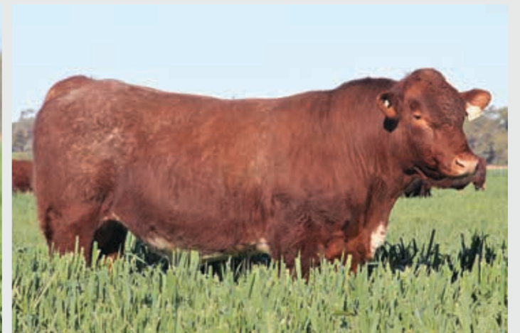
LOT 96 THE GROVE NIXON Q0211 (P)