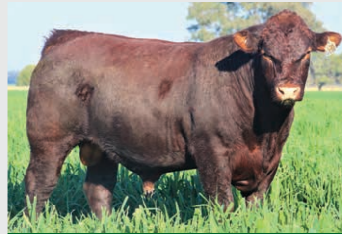
LOT 57 THE GROVE ANDROID Q0800 (P) (AI)