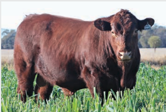
LOT 25 THE GROVE ##