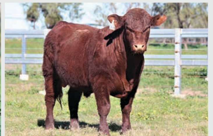
LOT 104 THE GROVE MAJOR R0094 (P) (AI)