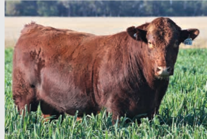
LOT 61 THE GROVE CHAINLINK Q0931 (P) (AI)