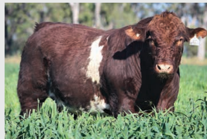
LOT 84 THE GROVE TREMAIN Q0907 (P) (AI)