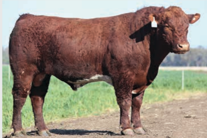
LOT 38 THE GROVE ANDROID Q0968 (P) (AI)