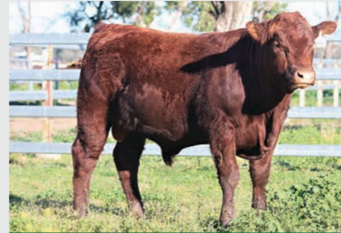
LOT 119 THE GROVE GOODAR R0093 (P) (AI)