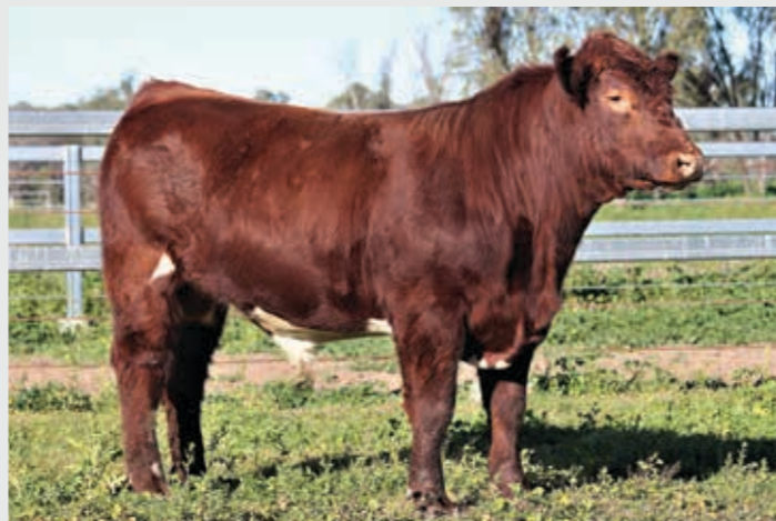
LOT 116 THE GROVE GOODAR R0091 (P) (AI)