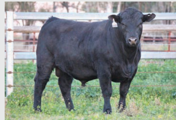
LOT 121 THE GROVE R0104 13/16 ANGUS (DR) (P) (AI)