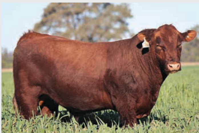
LOT 34 THE GROVE ANDROID Q0563 (P)