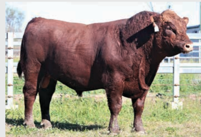
LOT 5 THE GROVE LEGENDARY Q0399 (S) (AI) (ET)