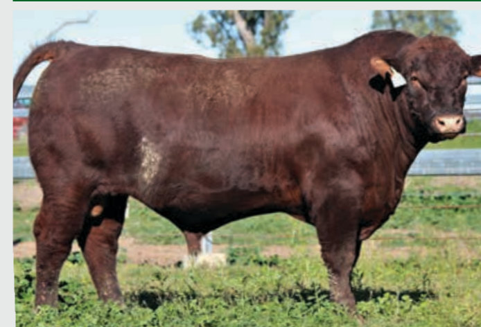
LOT 7 THE GROVE BLOTCHED Q0397 (P) (AI) (ET)