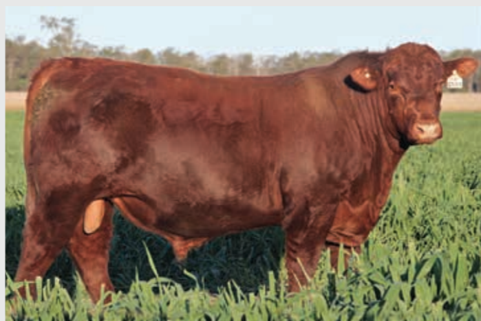
LOT 56 THE GROVE Q0889 3/8 ANGUS (DR) (P)