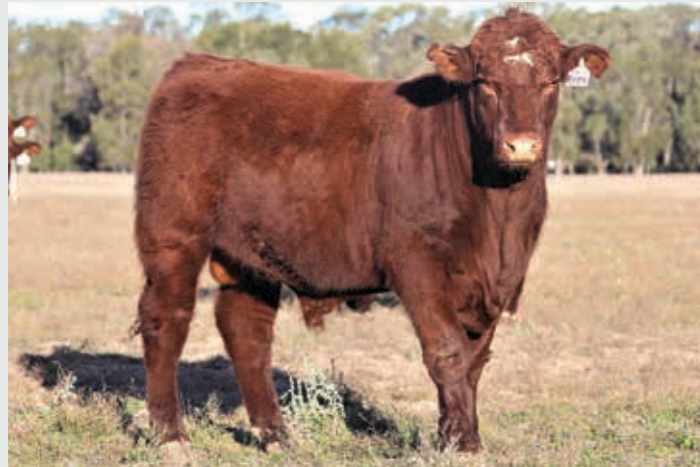
LOT 108 THE GROVE MAJOR R0095 (P) (AI)