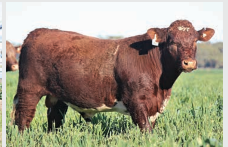
LOT 16 THE GROVE DEFECTOR Q0952 (P)