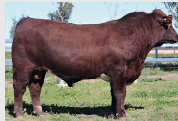
LOT 1 THE GROVE BLOTCHED Q0595 (P) (AI) (ET)