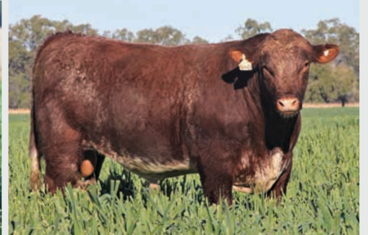
LOT 92 THE GROVE QUANTUM Q0410 (P)