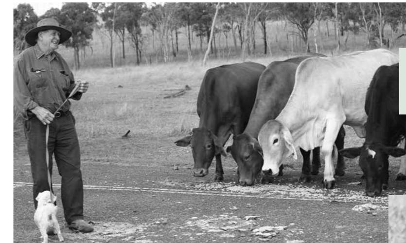
Clyde Hoffman successfully using The Grove Shorthorn bulls in a Cross-breeding program at Rockhampton