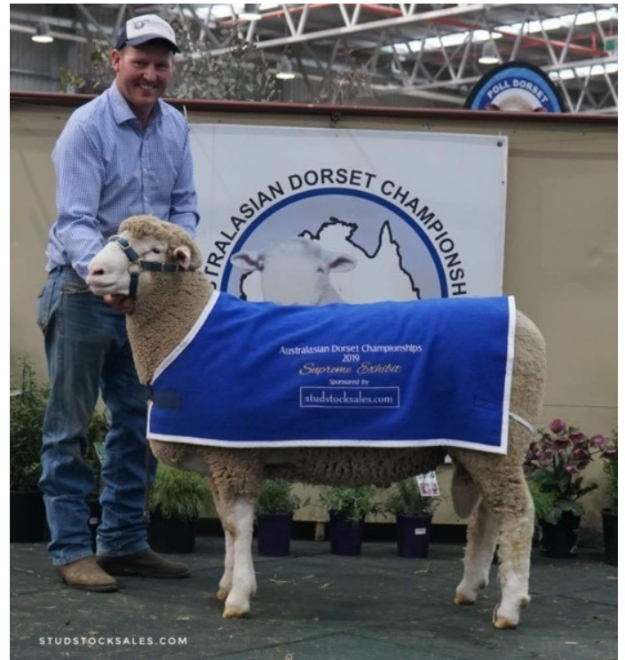
Supreme Exhibit Bendigo 2019