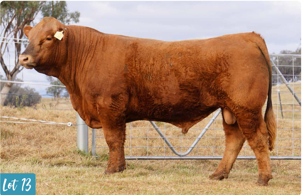
MALA-DAKI SHOCK N AWE Q5 (Pp) (AI) (B)