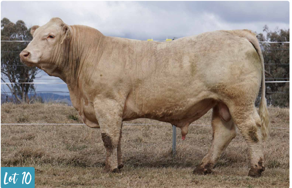
MALA-DAKI MIRACLE Q23 (PP) (AI) (R)