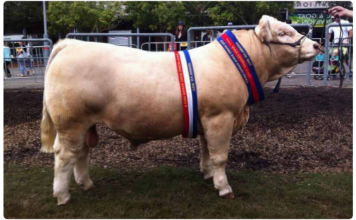
2014 SYDNEY ROYAL CALOONA PARK HERO