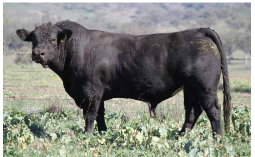
MALA-DAKI FERRARI M802