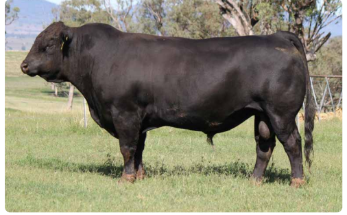
MALA-DAKI ELDORADO N33