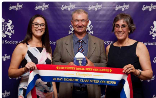
2019 RAS BEEF CHALLENGE