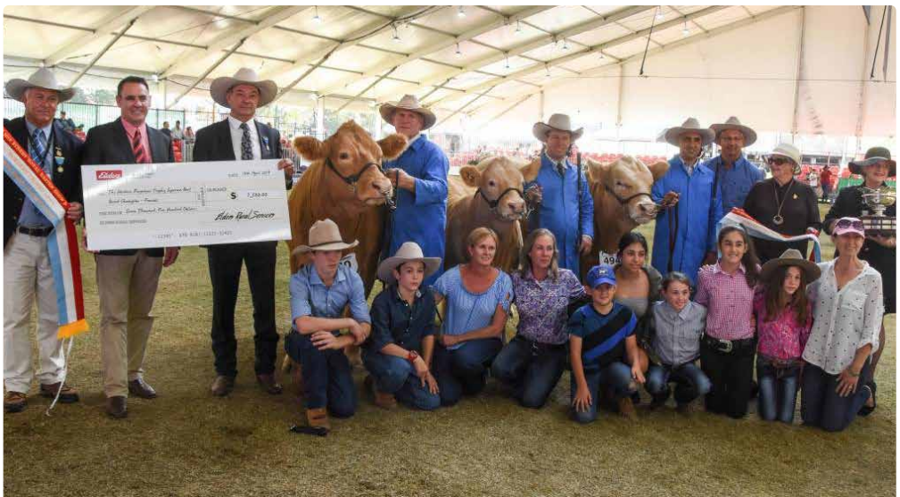
2019 SYDNEY ROYAL - THE HORDERN PERPETUAL TROPHY