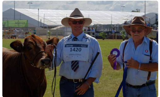
2021 BEEF AUSTRALIA - MD DREAMA Q51