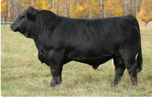
RJY SHOCK N AWE 5W (P) (B) (AI)