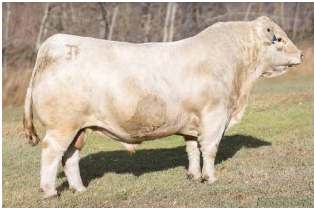
LT DEL REY 6161 P