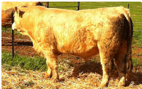
AIRLIE KIT K127E (AI) (P) A1SK127E (P)