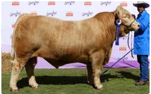
CALOONA PARK LITTLE HERO