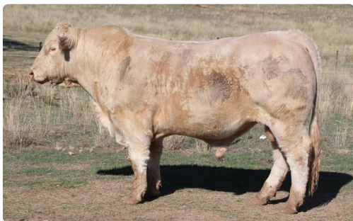
CALOONA PARK KODIAK (P) LSFK123E (P)