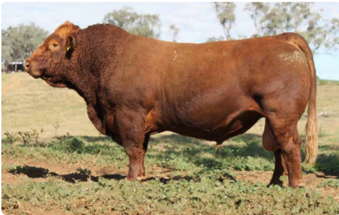
MALA-DAKI RED AMIGO K649 (PP) (AI)