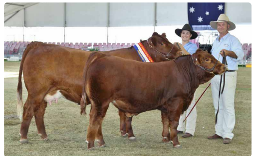
MD ROSANNE H565 & MD AMIGO K649