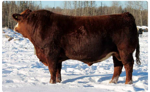
KOP SPARTAN 113A