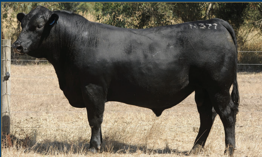
TE MANIA NEHILL N377