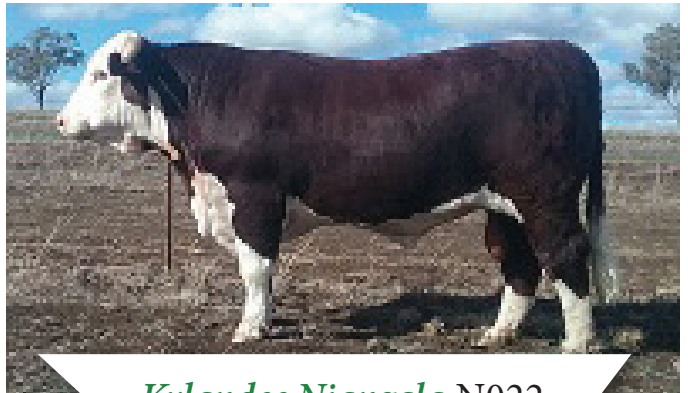
Kylandee Niangala N022