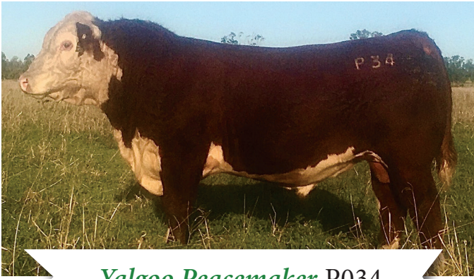
Yalgoo Peacemaker P034