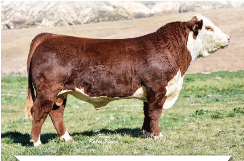
Churchill Gunpowder 657D ET (P)