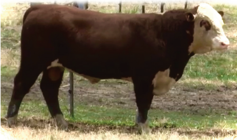
Yavenvale Midday M579 (PP)