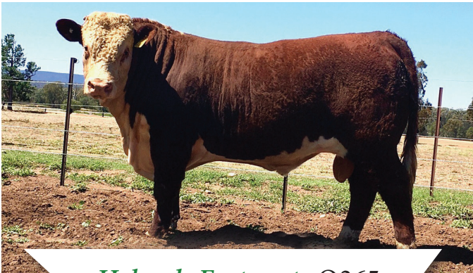
Hylands Fortunate Q265