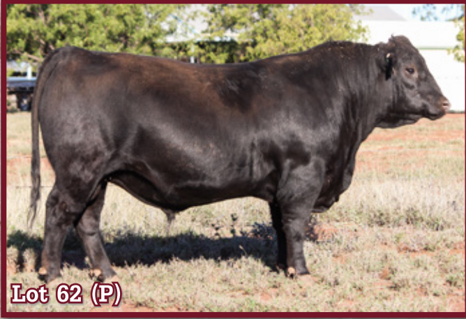
Lot 62 (P)