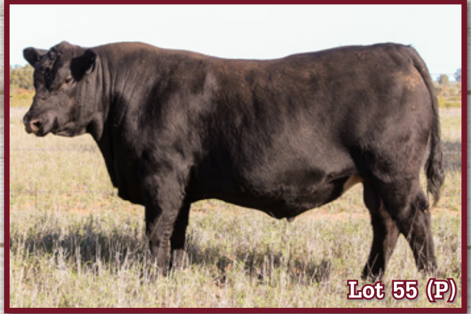
Lot 55 (P)