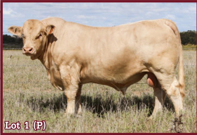
Lot 1 (P)