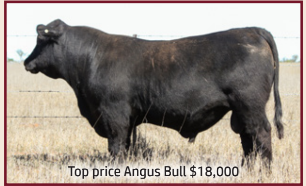
Top price Angus Bull $18,000