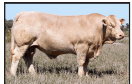
Lastovski Son - Lot 9.