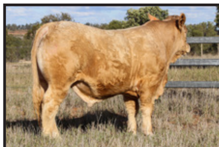
Lastovski Son - Lot 27.