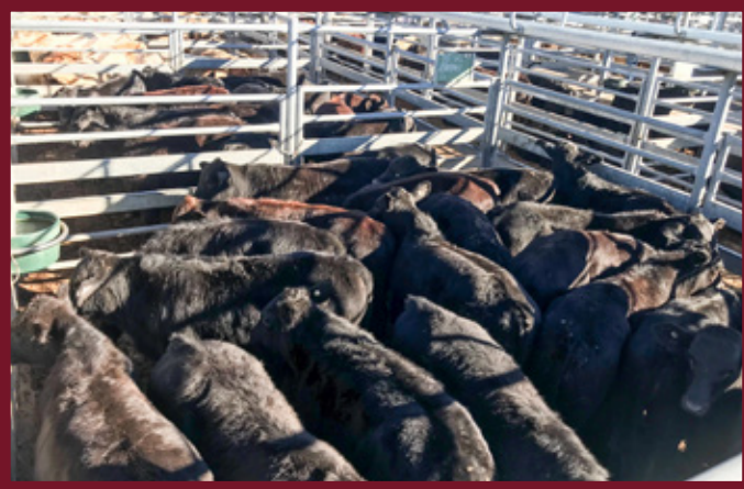
The Kirby family 'Eli Park' sold these EU Angus cross weaner steers for 610c/kg to weigh 319kg and return at a massive $1948/head off mum.