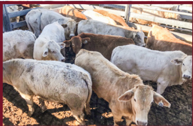
The Wall family sold these Charolais cross steers to 590c/kg.