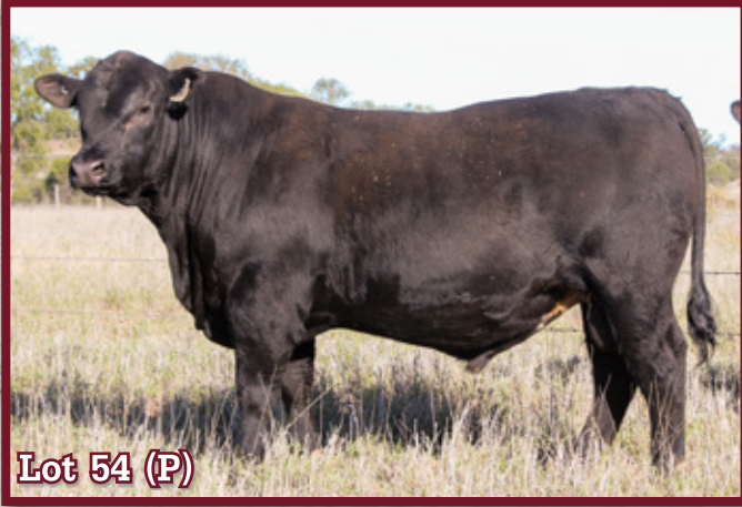
Lot 54 (P)