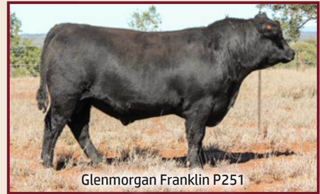
Glenmorgan Franklin P251