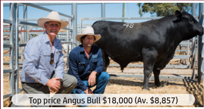
Top price Angus Bull $18,000 (Av. $8,857)