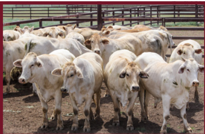
The Hicks Family, Mulgrave Grazing, Barcaldine, loaded out 6 decks of grass fed No.9 Charolais cross bullocks that averaged 673kg. (Also pictured in top banner)