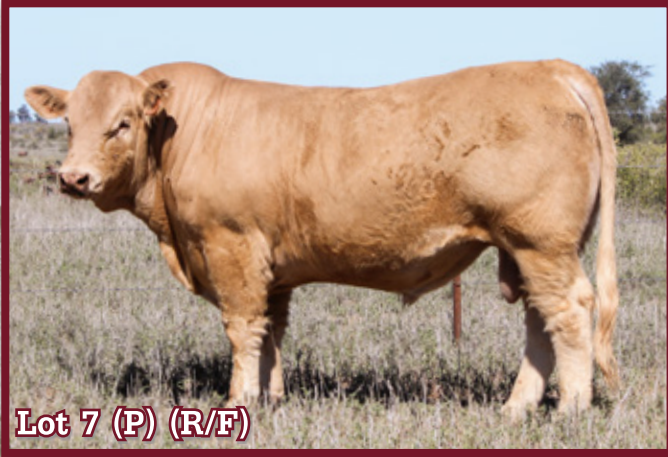
Lot 7 (P) (R/F)