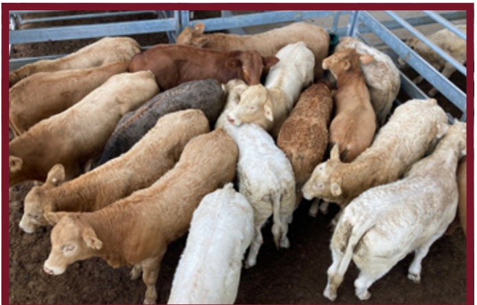
Dan Black sold 368kg weaner steers straight off mum for 568c/kg to return $1861/head. Congrats on your new property purchase at Alpha, Dan!