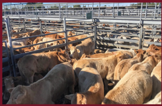
The Whitehead family, 'Satellite' recently sold these Charolais cross steers for 680c/kg.