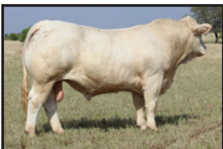
Lastovski when purchased at 24 months.

Lastovski was purchased in 2017 for $37,000, one of the most impressive bulls we have ever seen set foot in a sale ring. Lastovski is a proper beef bull with tremendous length, thickness and constitution. He displays a good sire's head, loose skin, super thick hindquarter & covers the cows with ease. We are very happy with the consistency Lastovski passes through to his progeny and now consider him as one of the best bulls we have ever used. Sons carry their sire's great carcass attributes and are ideal cross breeding machines whilst his daughters are beautiful roomy females with plenty of milk.