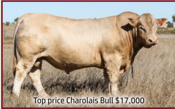
Top price Charolais Bull $17,000