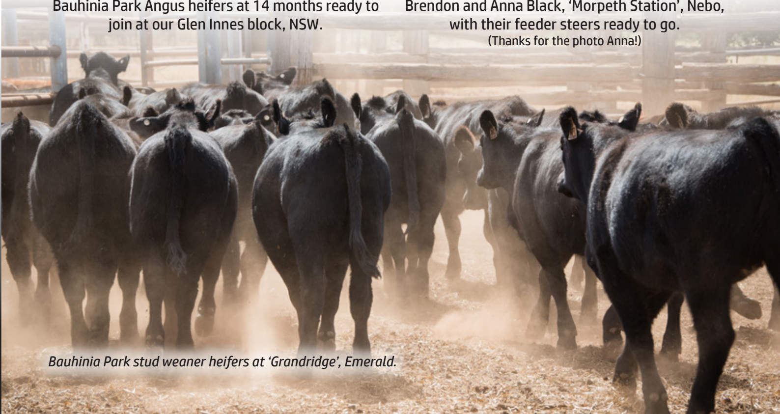
Bauhinia Park stud weaner heifers at 'Grandridge', Emerald.