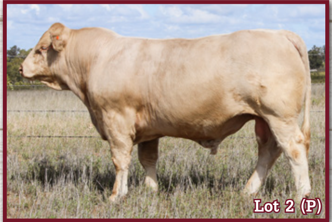
Lot 2 (P)