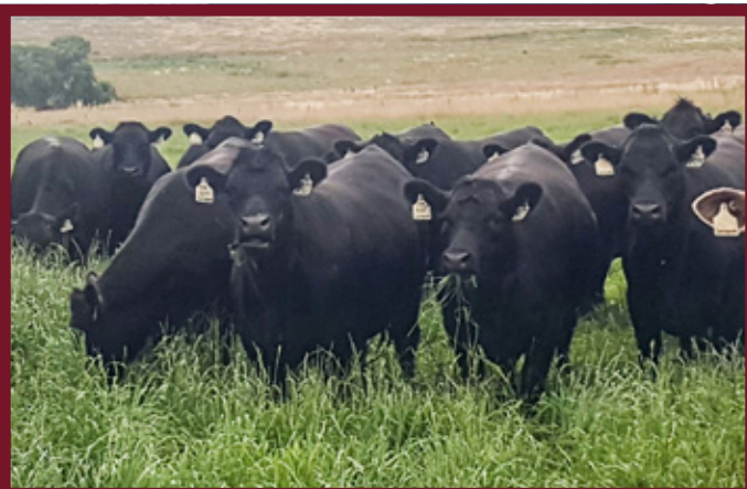
Bauhinia Park Angus heifers at 14 months ready to join at our Glen Innes block, NSW.