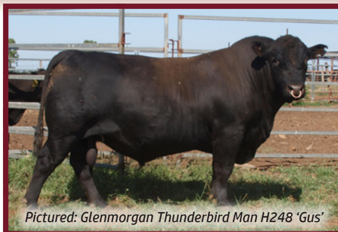
Pictured: Glenmorgan Thunderbird Man H248 'Gus'

S: Kansas Overlander Z239 Dam: Kansas Twiggy D134 D: Kansas Twiggy Z109