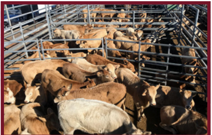
The Whitehead family, 'Satellite' recently sold these Charolais cross heifers for 536c/kg.