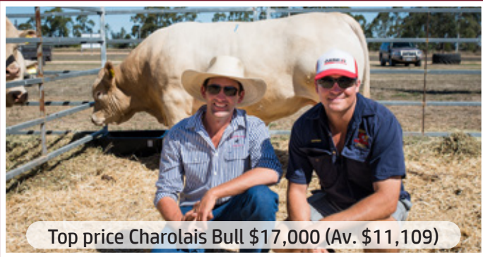
Top price Charolais Bull $17,000 (Av. $11,109)