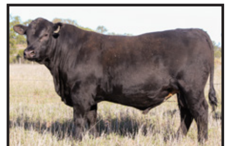
M38 Son - Lot 54 in this year's sale.