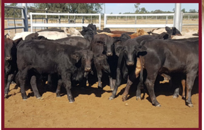
Mitch Stranks & Jackie Privett, 'Budgawillie', Willows, drafting weaners ready for the weaner sales.