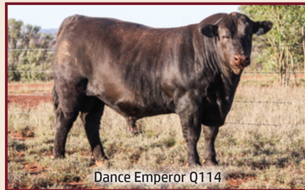
Dance Emperor Q114