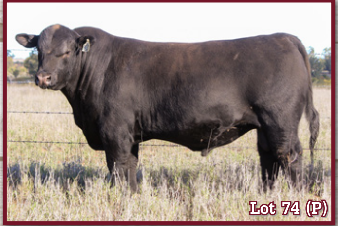
Lot 74 (P)