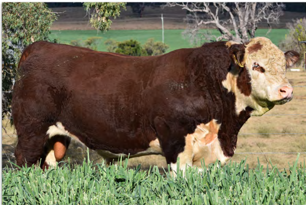
Lot 3 Mountain Valley Quota Q018 (PP)