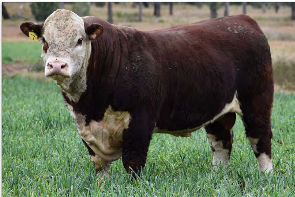
Lot 7 Mountain Valley Quickie Q106 (AI) (P)