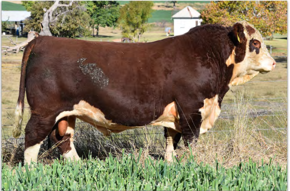
Lot 2 Mountain Valley Quantum Q016 (PP)