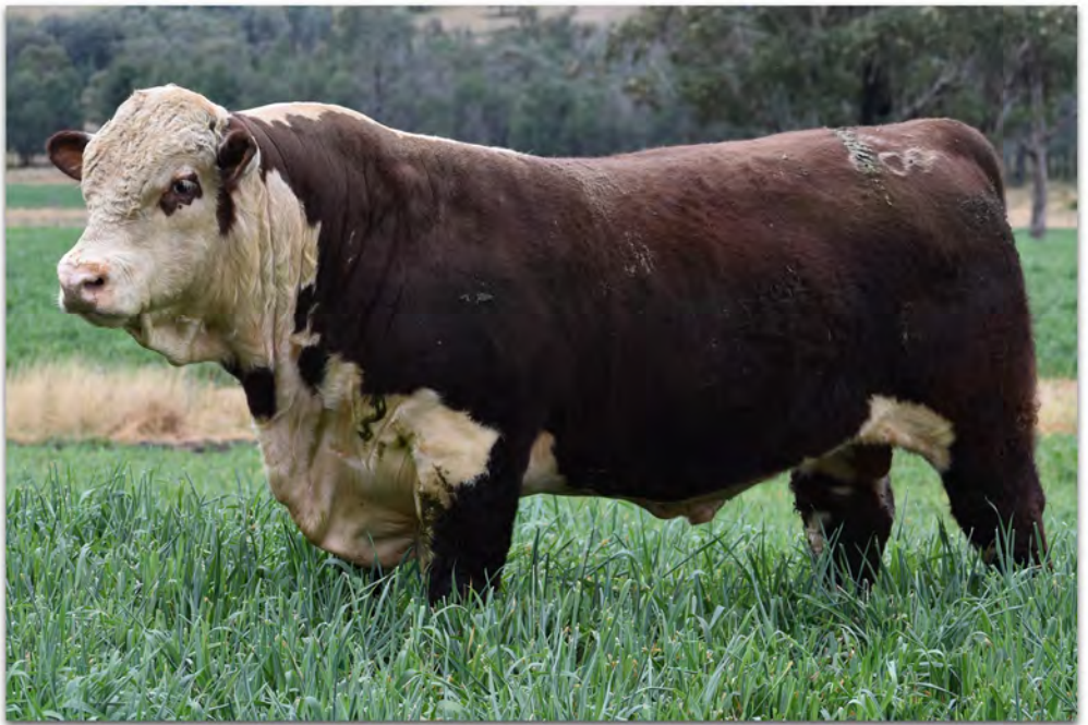
Lot 9 Mountain Valley Qualify Q099 (S)