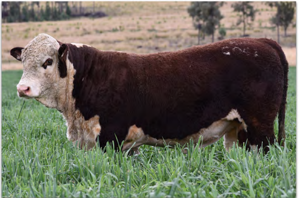
Lot 28 Mountain Valley Quarry Q041 (P)