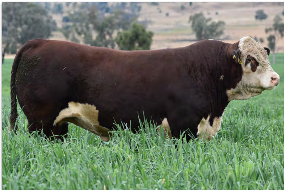
Lot 24 Mountain Valley Quarrel Q0450 (AI) (PP)