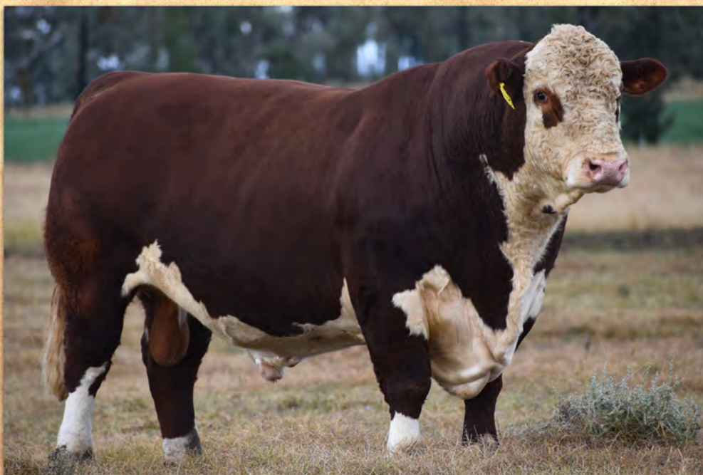
Lot 43 Mountain Valley Navara N268 (AI) (ET) (PP)