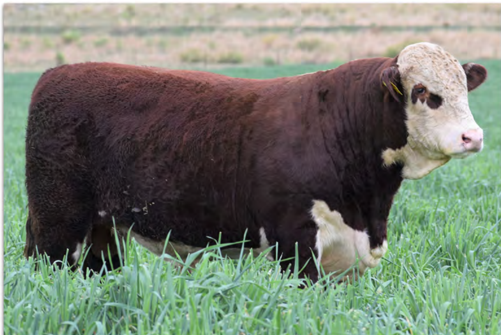
Lot 26 Mountain Valley Quigley Q044 (P)