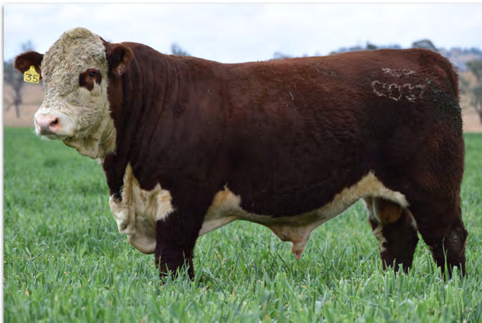
Lot 35 Mountain Valley Quaker Q037 (P)