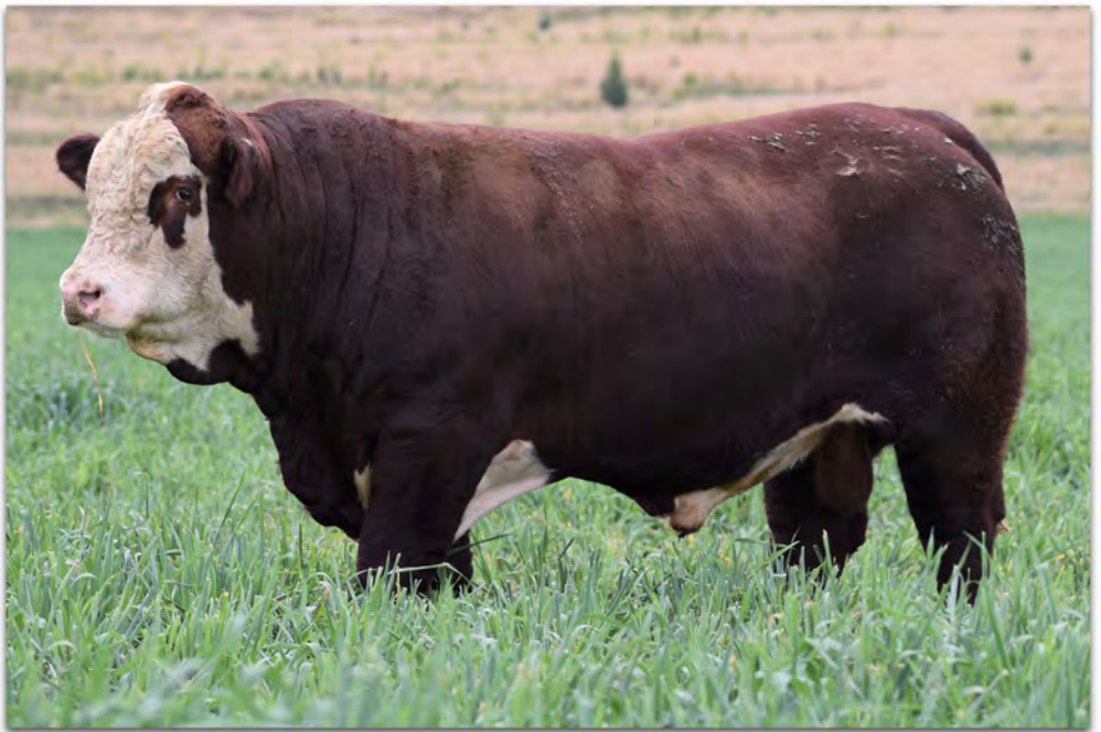
Lot 27 Mountain Valley Quill Q152 (AI) (ET) (P)