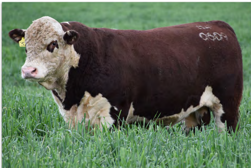
Lot 32 Commercial Q609 (P)