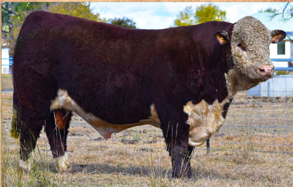
New Sire Mountain Valley Q-Ball SBDQ421 (AI) (ET) (PP)