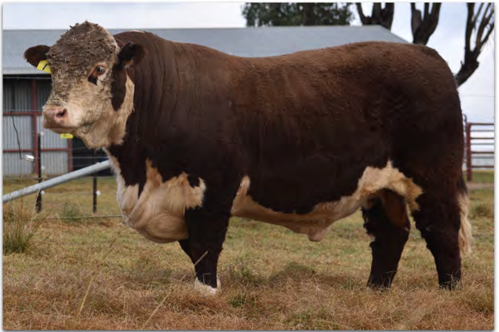
Lot 1 Mountain Valley Quintrex Q418 (AI) (ET) (P)