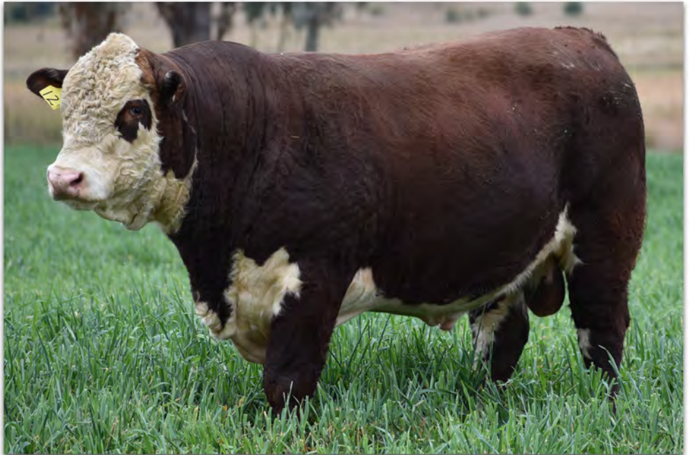
Lot 12 Commercial Q603 (P)