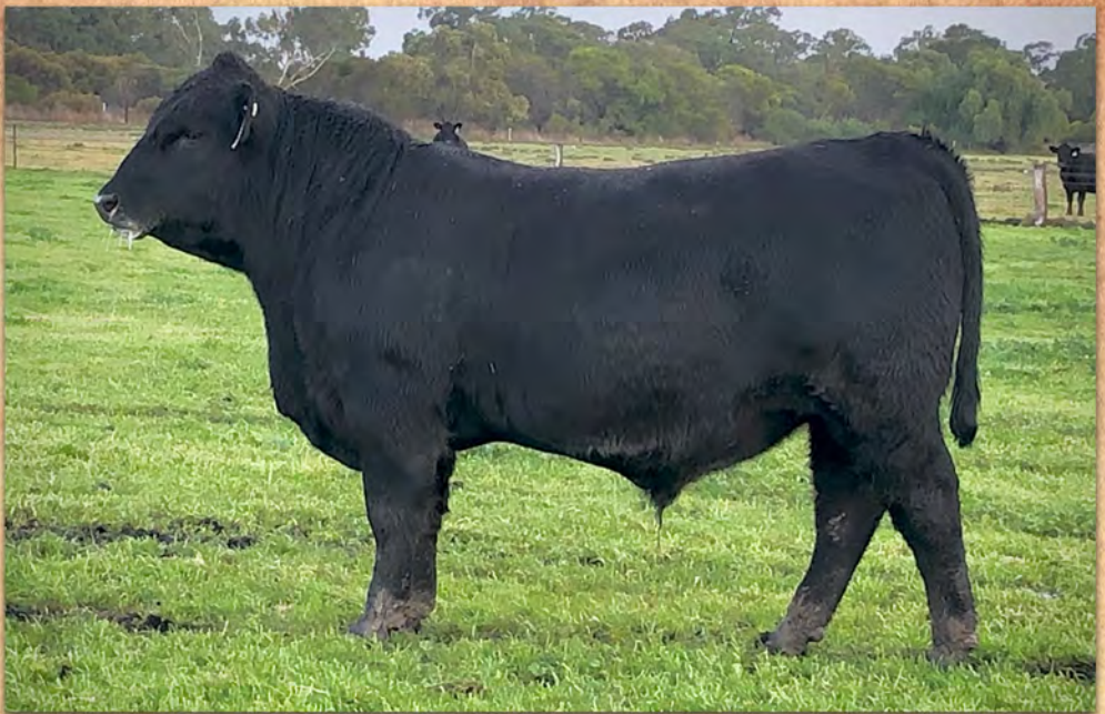
Sire Glatz Black Angus Wattle Street SJQQ127