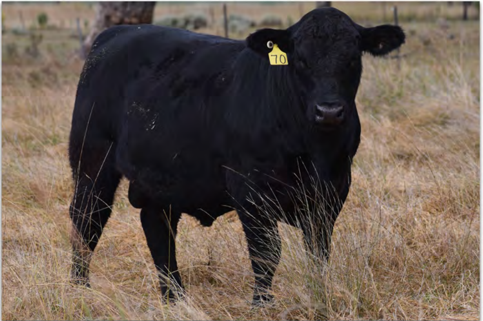
Lot 70 Mountain Valley Network R716 SV