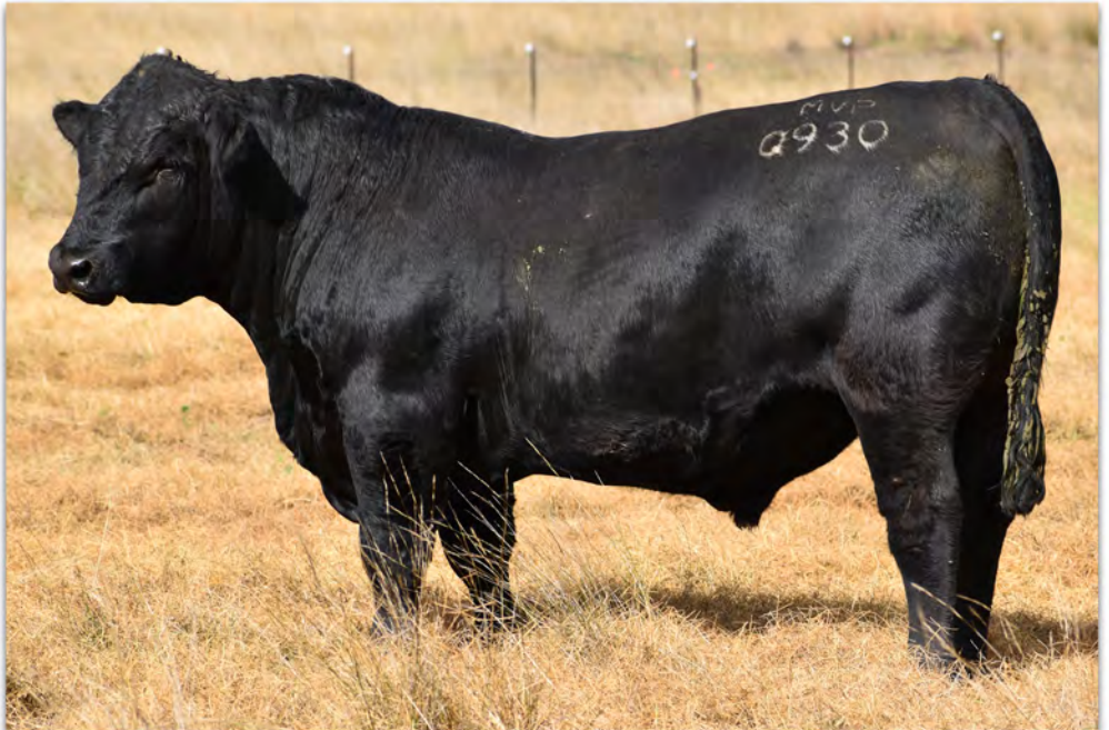
Lot 49 Mountain Valley Executive Q930 SV