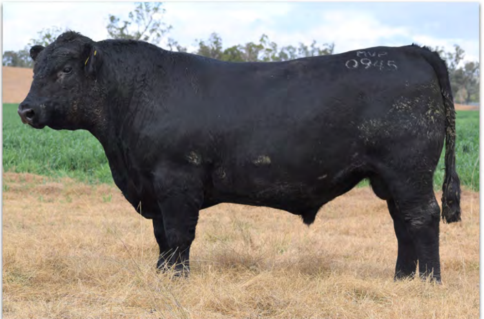
Lot 46 Mountain Valley Executive Q945 SV