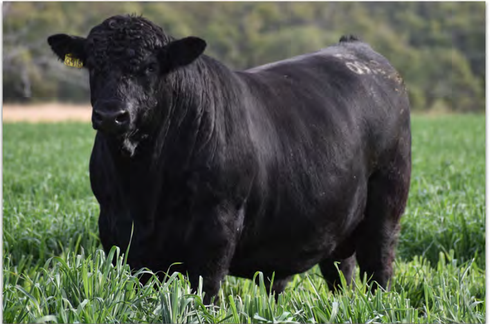
Lot 53 Mountain Valley Opinion Q918 SV