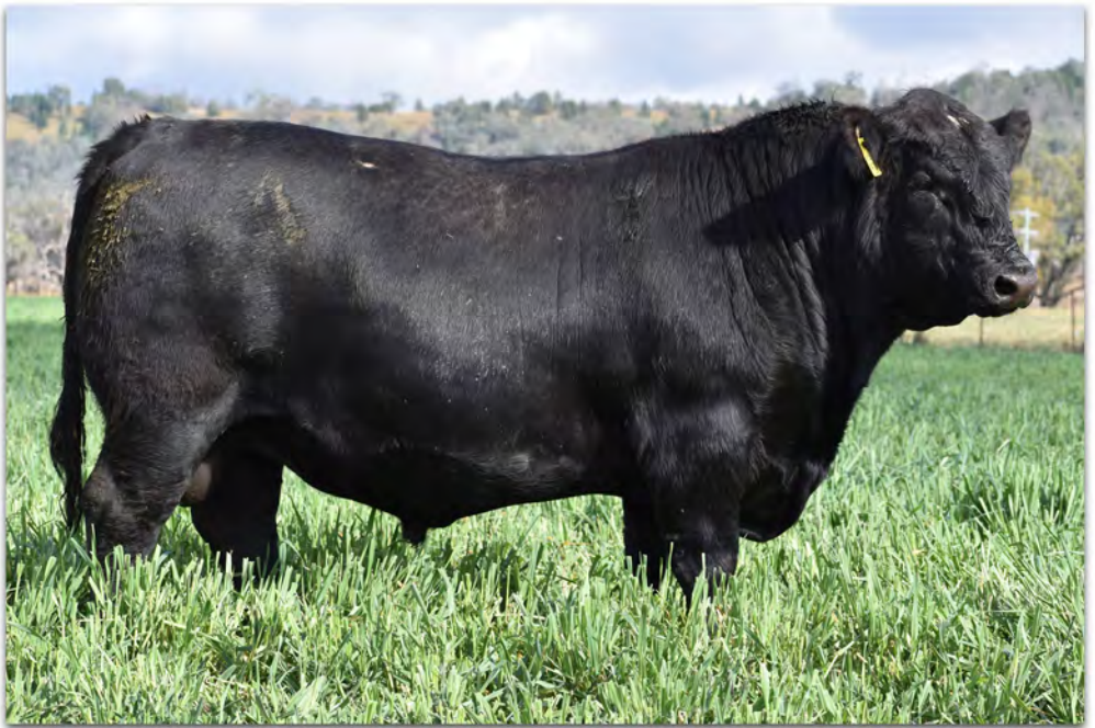
Lot 50 Mountain Valley Opinion Q906 SV