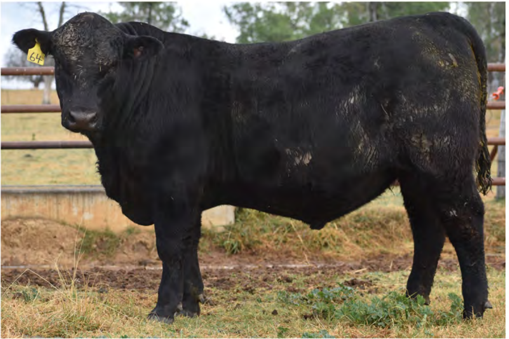
Lot 64 Mountain Valley Network R713#