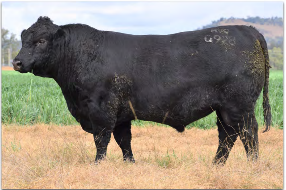
Lot 48 Mountain Valley Gabba Q928 SV