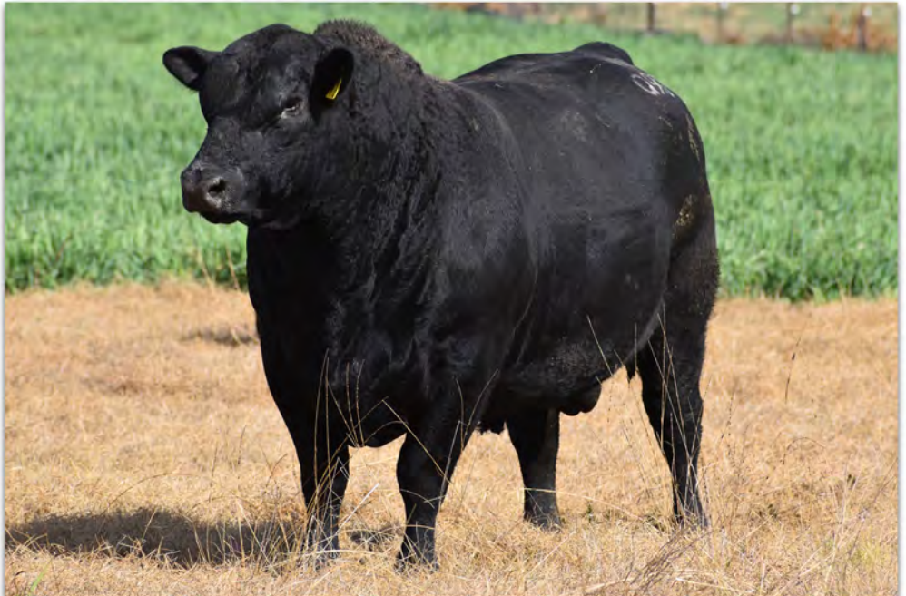
Lot 57 Mountain Valley Capitalist Q978 SV