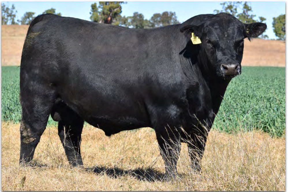
Lot 54 Mountain Valley Opinion Q921 SV