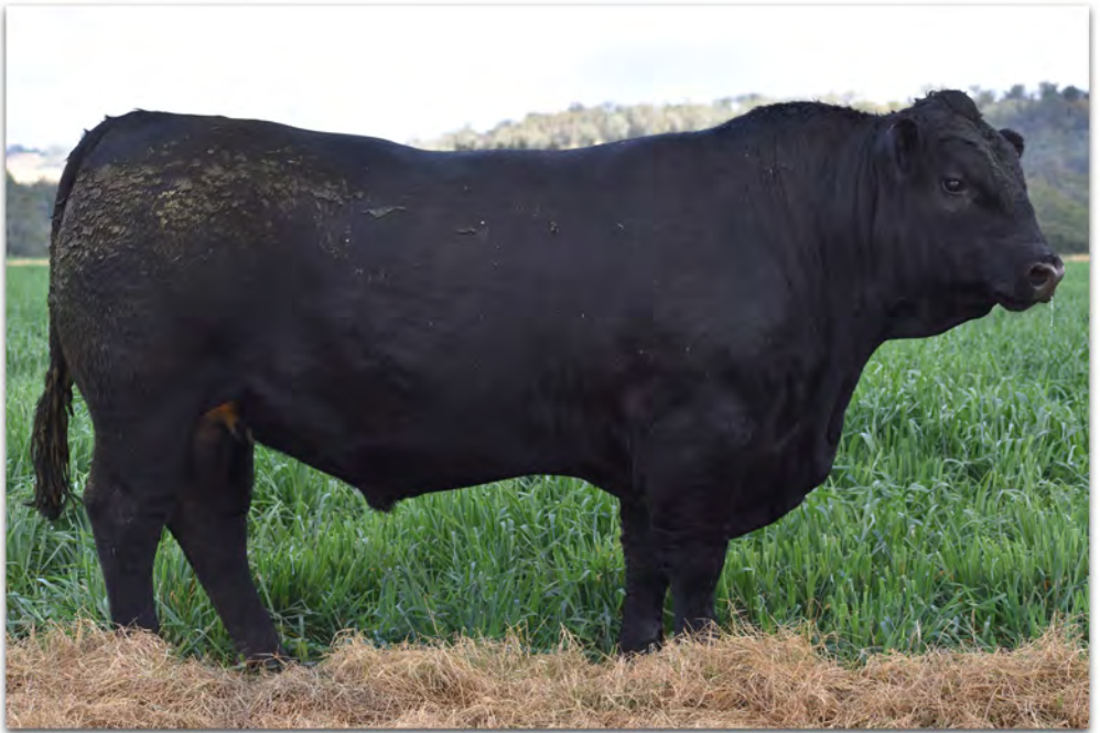
Lot 45 Mountain Valley Gabba Q995 SV