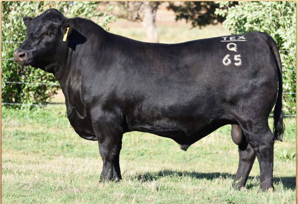
2021 AI Sire Texas Brad Pitt DXTQ065