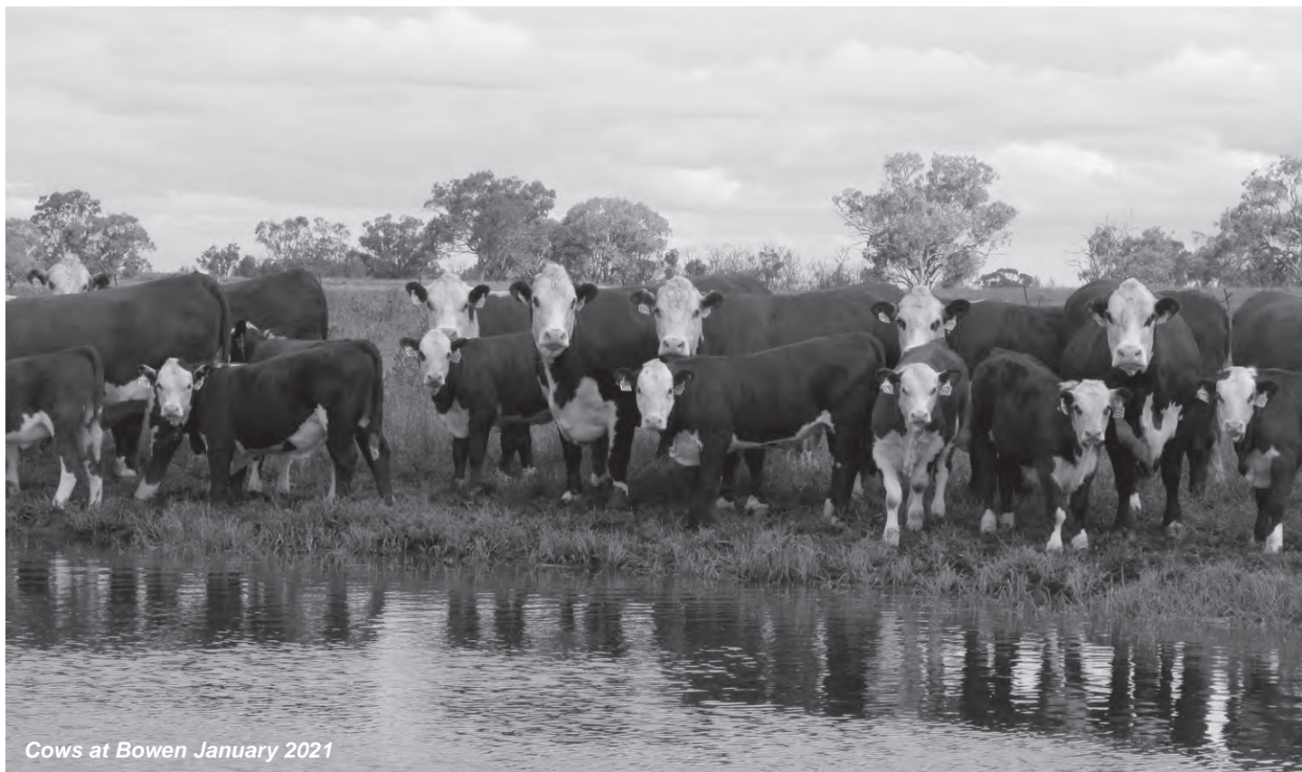
Cows at Bowen January 2021