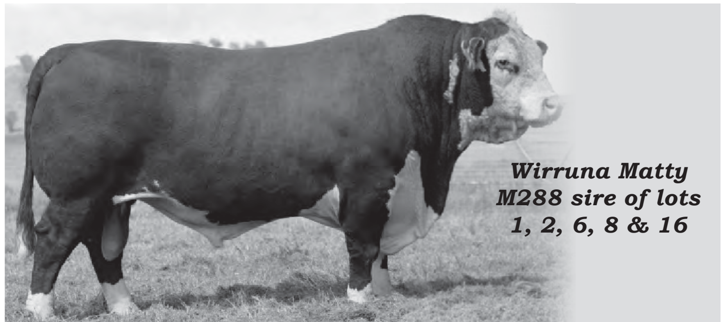
Wirruna Matty M288 sire of lots 1, 2, 6, 8 & 16