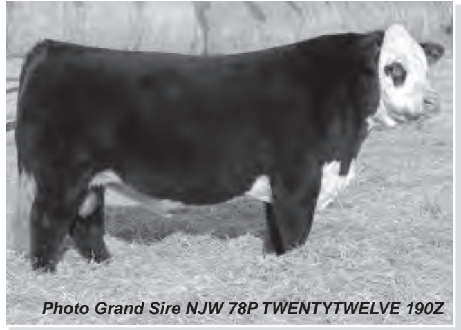
Photo Grand Sire NJW 78P TWENTYTWELVE 190Z

NJW 73S M326 TRUST 100W ET (IMP USA) (ET) (P) NJW 78P TWENTYTWELVE 190Z (IMP CAN) (AI) (ET) (P) NJW BW LADYSPORT DEW 78P ET (P) SIRE: BOWEN MACKLEN M91 (AI) (PP) BOWEN ESPLANADE E332 (AI) (PP) BOWEN MARLINE H194 (AI) (P) BOWEN MARLINE E109 (P) MSU OPTIMUM Z03 (IMP USA) (P) HEATHERDALE OPIUM U78 (AI) (P) NEILPO MARITANA 29 (P) DAM: BOWEN CORAL E18 (AI) (P) BOWEN VINCENT V1 (S) BOWEN CORAL B258 (AI) (P) BOWEN CORAL Y204 (P)