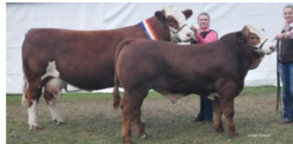
DAM - Grand Champion Simmental Female Royal Adelaide 2016

DOUBLE BAR D SPITFIRE 20X STARWEST TOTAL VALUE PHS POLLED WINFALL 27W GHS MR MONEY BLINKBOU MODIST WOONALLEE ROSY E227 WISP-WILL ROSY GIBBYS NICHOLAS 302N GIBBY'S REAL DEAL 25T GIBBEY'S NABRISKA 16N WOONALLEE LADY G34 BHR DRACO SA 628N WOONALLEE LADY B39 WOONALLEE V1