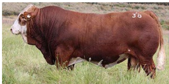
SIRE - Sire Woonallee Lagoon

DOUBLE BAR D SPITFIRE 20X STARWEST TOTAL VALUE PHS POLLED WINFALL 27W GHS MR MONEY BLINKBOU MODIST WOONALLEE ROSY E227 WISP-WILL ROSY TOPWEIGHT DIRECTOR WILLANDRA GOMEZ WILLANDRA DIANA Z26 WOONALLEE REGAL K131 WOONALLEE HADAU WOONALLEE REGAL E78 WOONALLEE REGAL