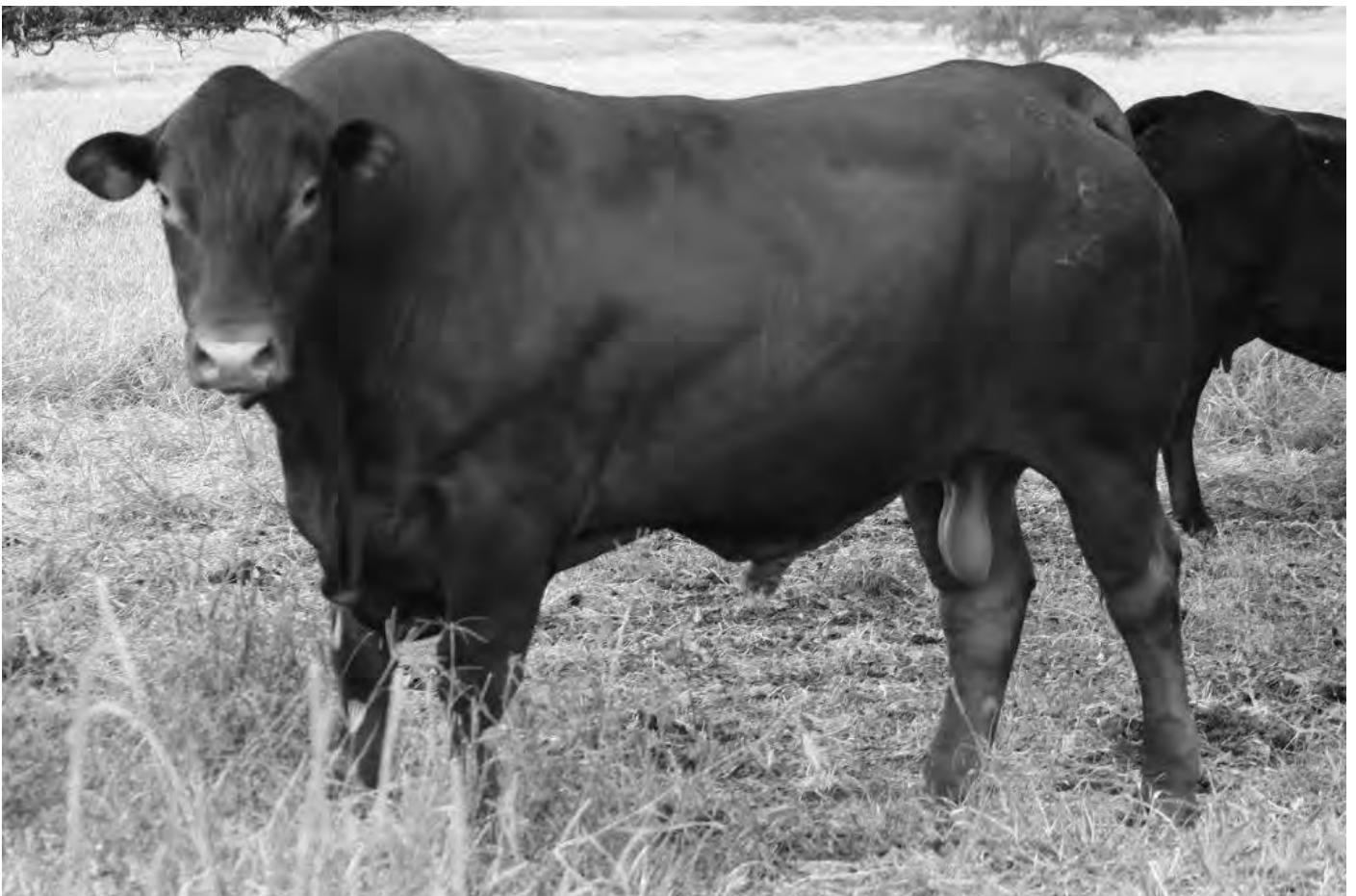
Below: GODK40048 Namoon King Kunta (@ 40 Months of age) Sire of Lots: 12, 13, 14, 15, 16, 17, 18, 20, 21, 24, 26, 30, 31, 34