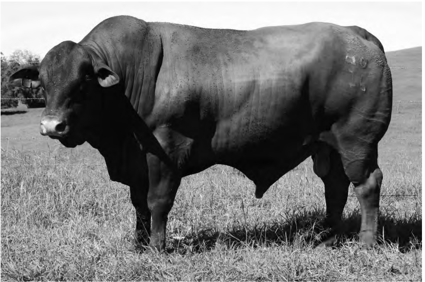
Above: GODM60020 Namoon Mitchell Pearce (@ 30 Months of age) sire of Lots: 2, 3, 5, 6, 7, 10