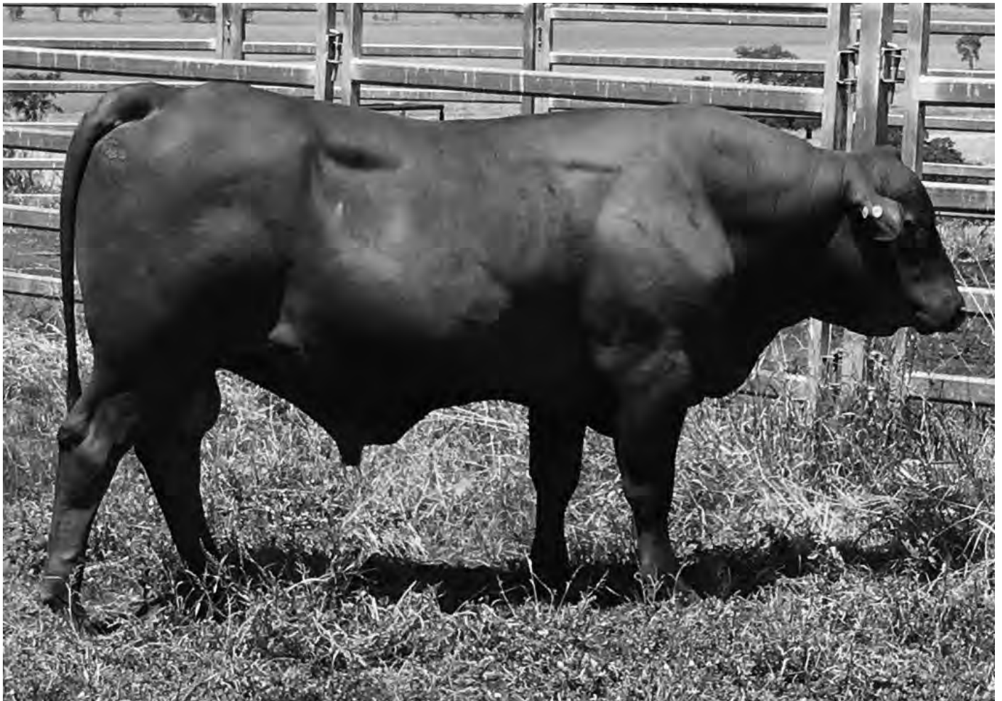
Below: GODL50088 Namoon Lleyton Hewitt (@ 36 months of age) Sire of Lots: 1, 22, 27, 28, 29,