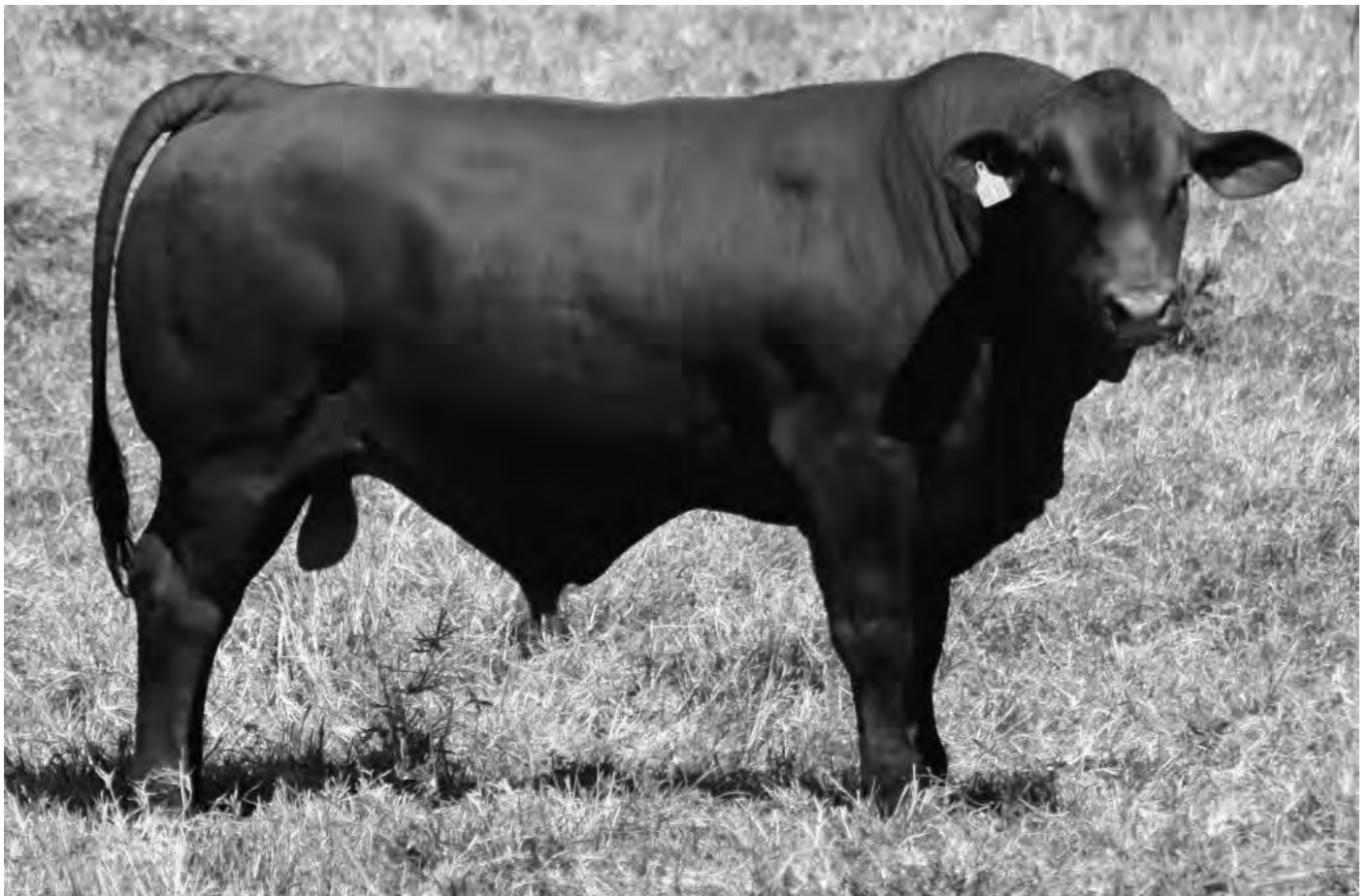
Above: GODH20036 Namoon Charles Barkley (@12 months of age) sire of Lots: 4, 8, 9, 11, 25, 32, 33, 35, 37, 45, 46