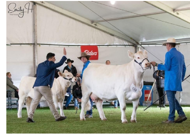
PLEASANT DAWN MVP 316Y