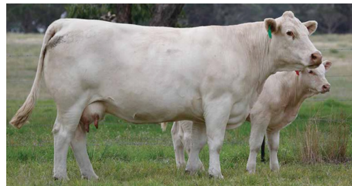
SILVERSTREAM EVOLUTION E168 (P) S: PALGROVE JUSTICE (AI)(P) PALGROVE AMY 36 (P)