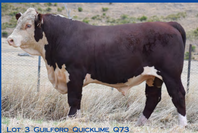
LOT 3 GUILFORD QUICKLIME Q73