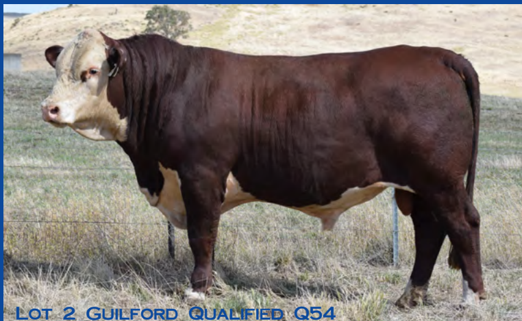
LOT 2 GUILFORD QUALIFIED Q54