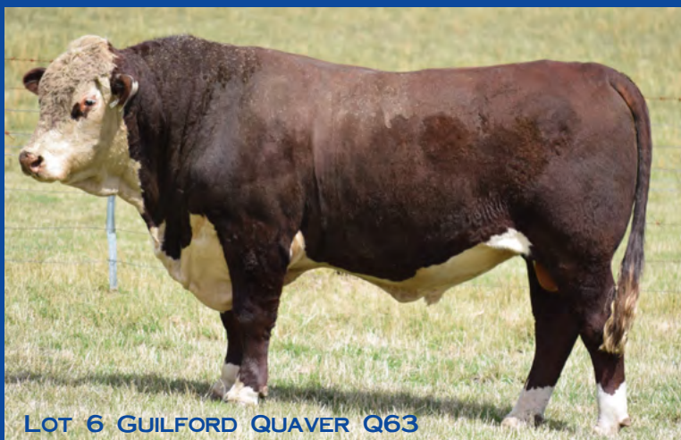
LOT 6 GUILFORD QUAYER Q63