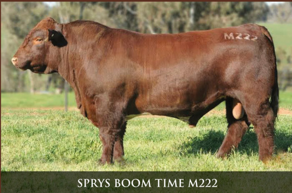
SPRYS BOOM TIME M222