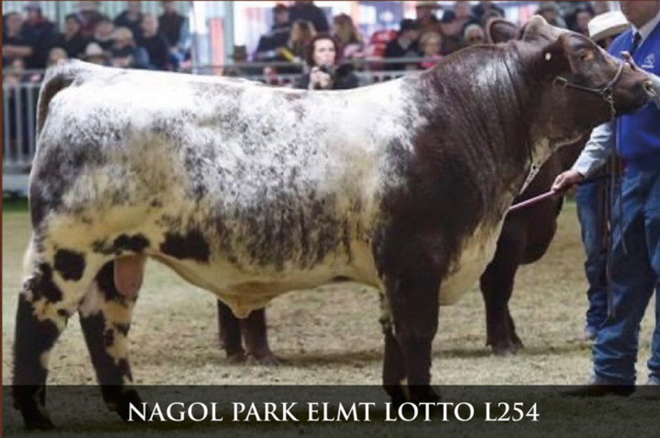
NAGOL PARK ELMT LOTTO L254