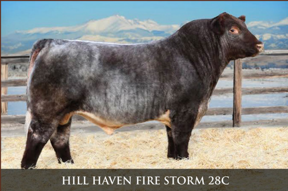
HILL HAVEN FIRE STORM 28C