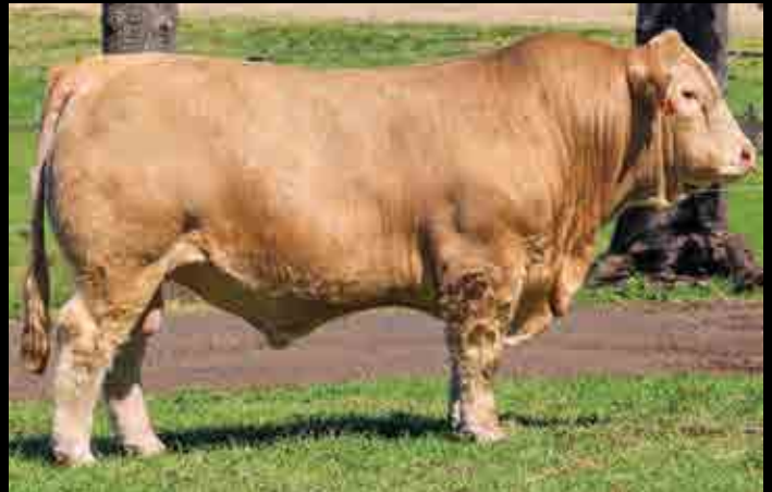
Glenlea Pheonix (P) R/F sold for $25,000 at our 2020 Clermont Bull Sale. Full Sibling to embryos Lot 38.