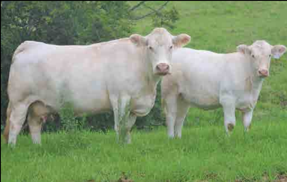
Paddock shot in the wet weather of VLW J1E (Full Flush Lot 3C) and CALF GLE R34E Lot 3A.