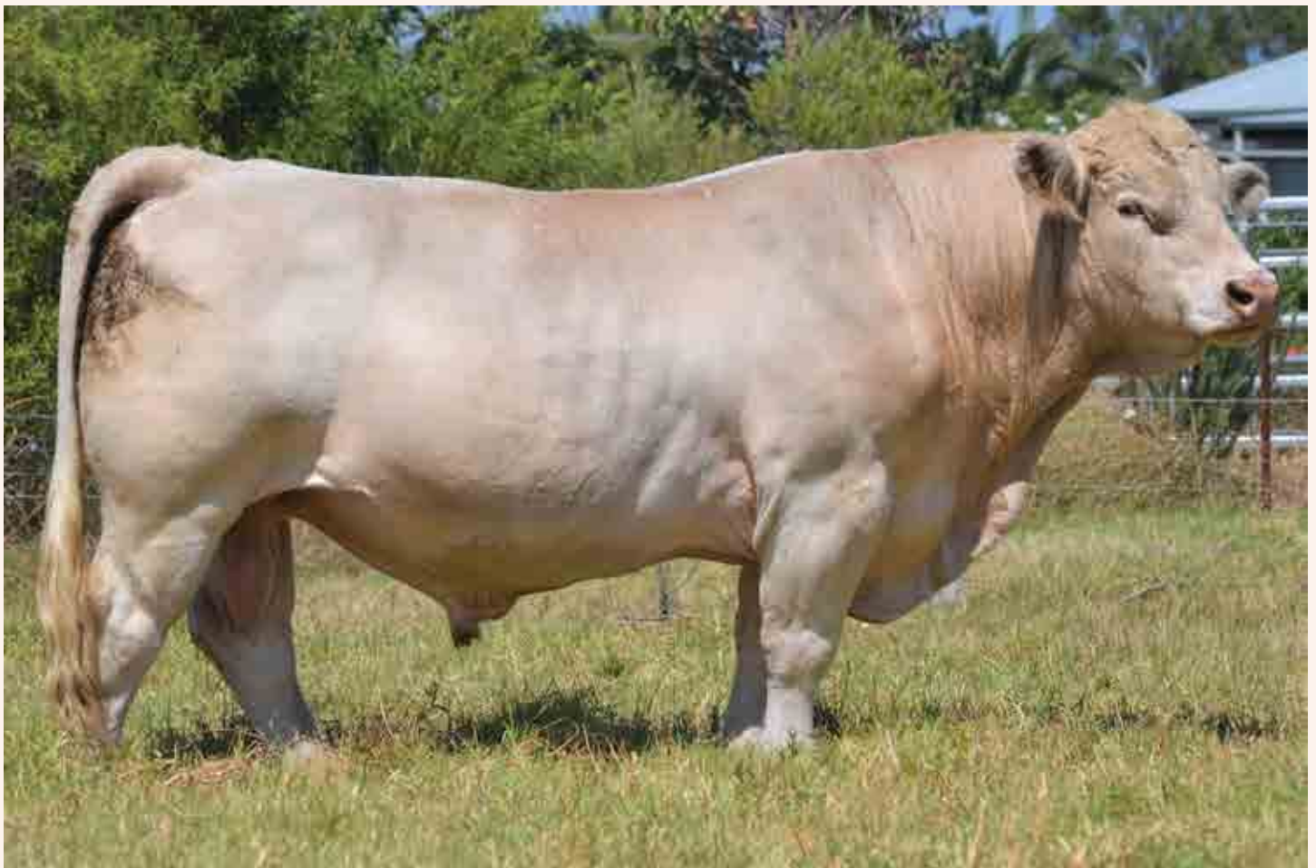
Lone Ranger at 4.5 years old. Sire of Lot 34 and CAF of Lot 60.