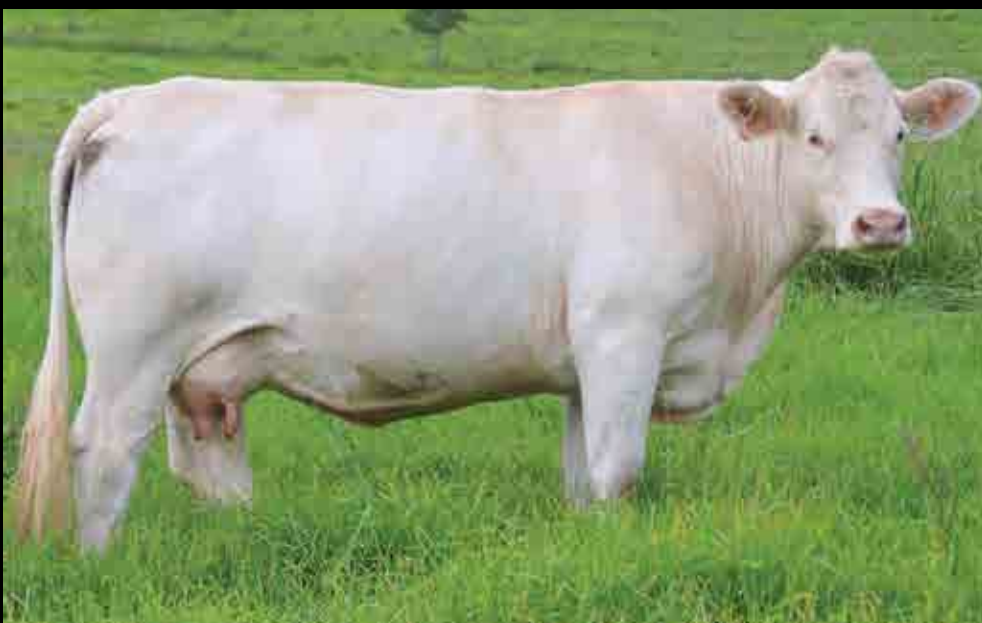
OW Glenlea Josie 2nd (P) Dam of LOT 16 and joined the Donor Herd in 2021.