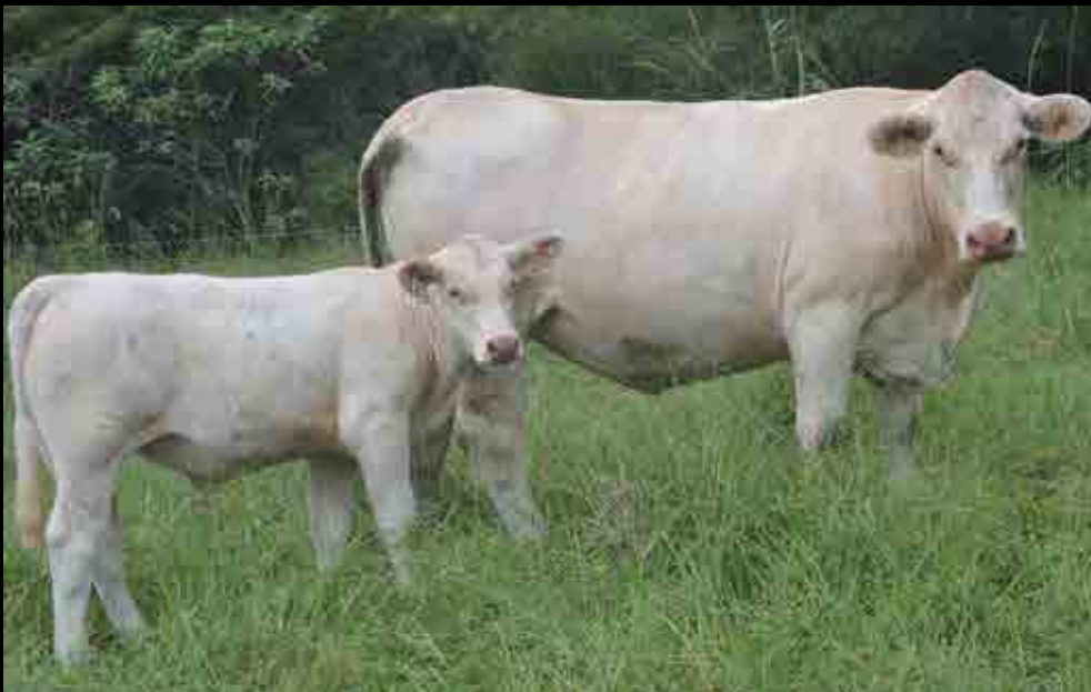
Lot 42 - 3 in 1 unit with stunning polled Louis Heifer calf at foot.