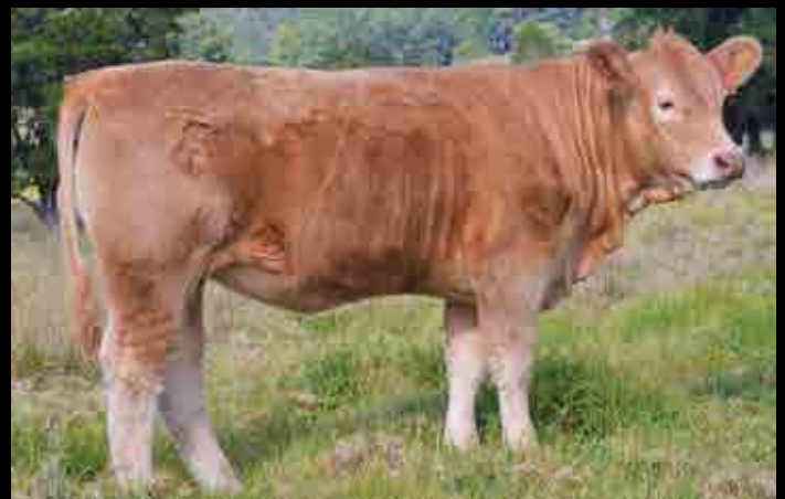
Glenlea Nanette (P) R/F

Homozygous Polled, 12 month old daughter of Lot 2C. Sired by Charnelle Louis (P) Reference sire. Photo Mid-Winter 2020.