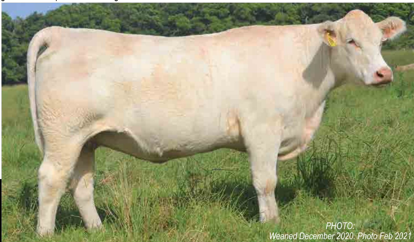
PHOTO: Weaned December 2020. Photo Feb 2021