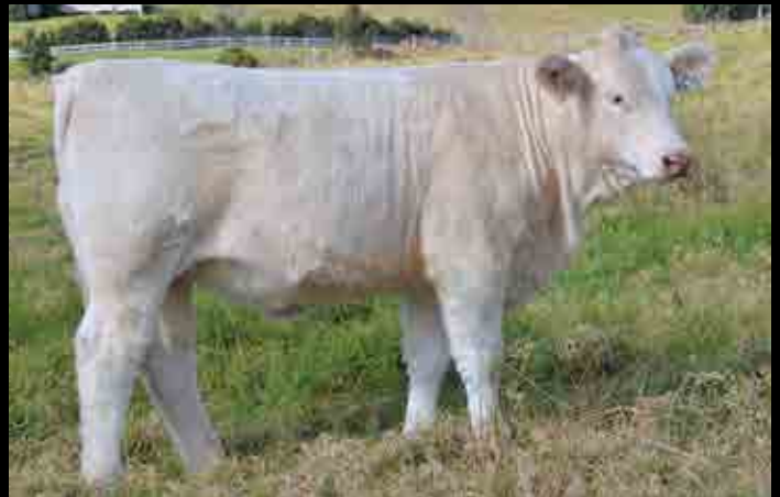
Glenlea Estella 16th (P) 10 month old. Homozygous Polled. Daughter of Dam Lot 38 Embryos. Mid winter 2020.