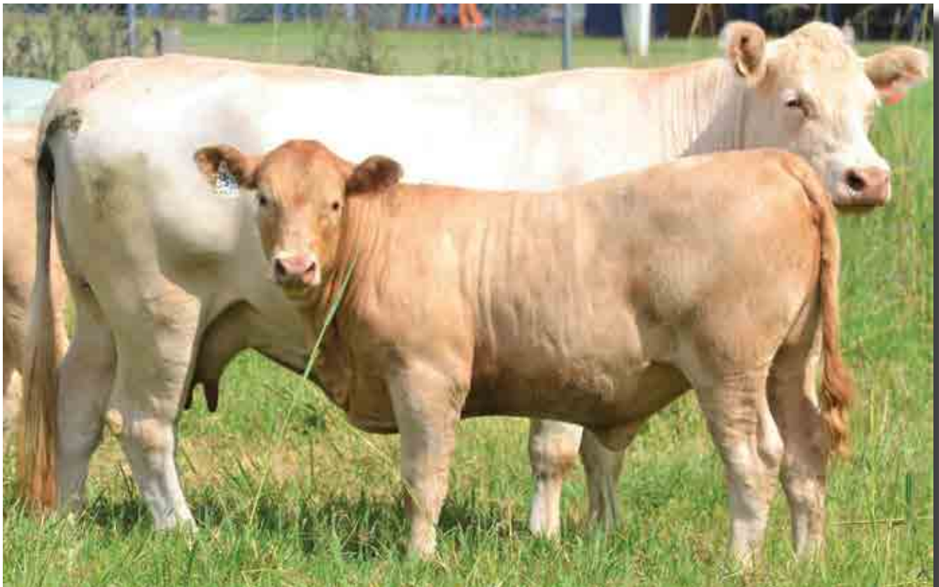
Lot 8A: 7 month old calf sired by Glenlea Just Red and her Dam Lot 8B.