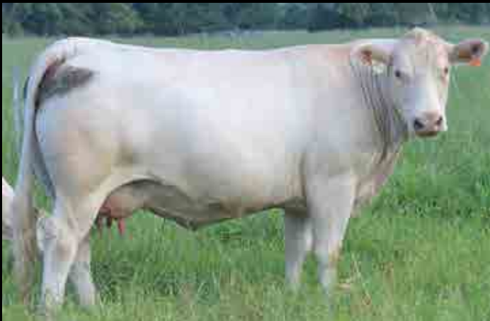
Glenlea Charol 72nd (P) GLE J8E.

These are real stud herd cows, great bloodlines, EBV's and types to suit every market and environment. Offered ready to enter an A.I. program or join to your sire. We are happy to discuss ideal mating choices with any purchaser.