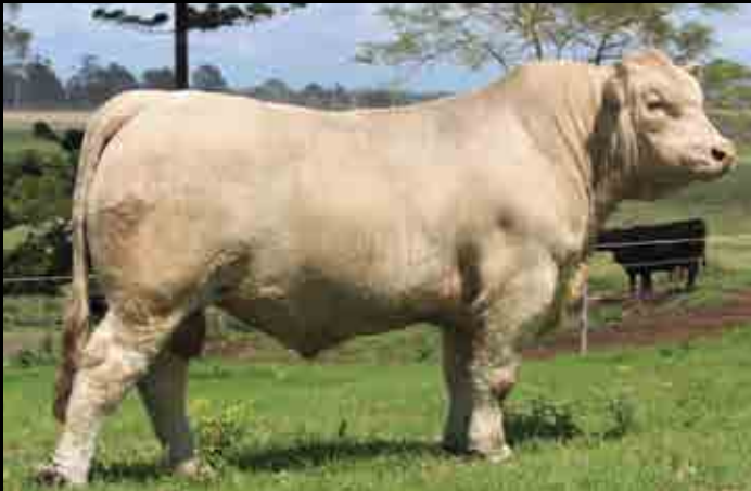
Glenlea Pluto (P) joining sire in this sale. Full sibling to embryos in Lot 39.

These cows and calves, mostly 3 in 1 units have all been run on coastal properties, just west of Coffs Harbour on grass only and are presented in working paddock condition feeding big calves. If these cattle were at west of the range they would have higher body condition. Exception is Lots 43,44 and 45, these three have been at our Dorrigo property, and have higher body condition due to the more nutrient rich pastures of the Dorrigo plateau. A selection of bloodlines and exciting joining sires make these proven breeders very attractive to add to your herd, the matron cows are all very sound and will continue to produce for several years as many of our herd matrons have from previous sales. If they are still in the Glenlea Herd as mature females it's because they are good!