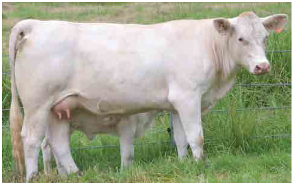
PHOTO: 1 year older sister to GLE Q80E, Lot 99 is a copy of her older sister.

COMMENTS: Great type, medium framed, good overall carcass, fine hair, very sound footed. Dam is a great Gobongo Matron, offered as Lot 54. Sired by "Kenworth" Reference sire. EBV's below breed average BW, gentle growth curve with all positive carcass traits.