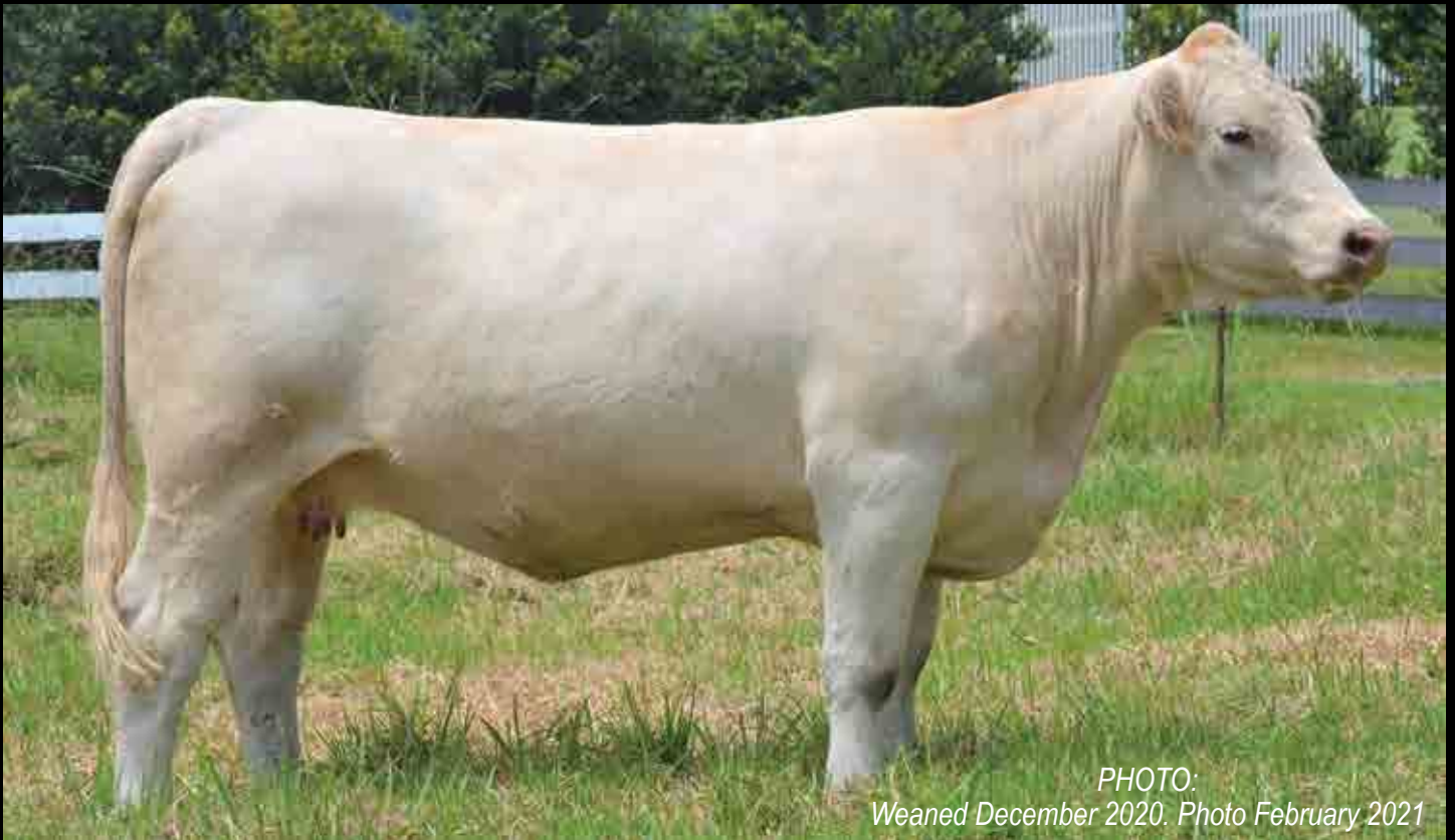
PHOTO: Weaned December 2020. Photo February 2021