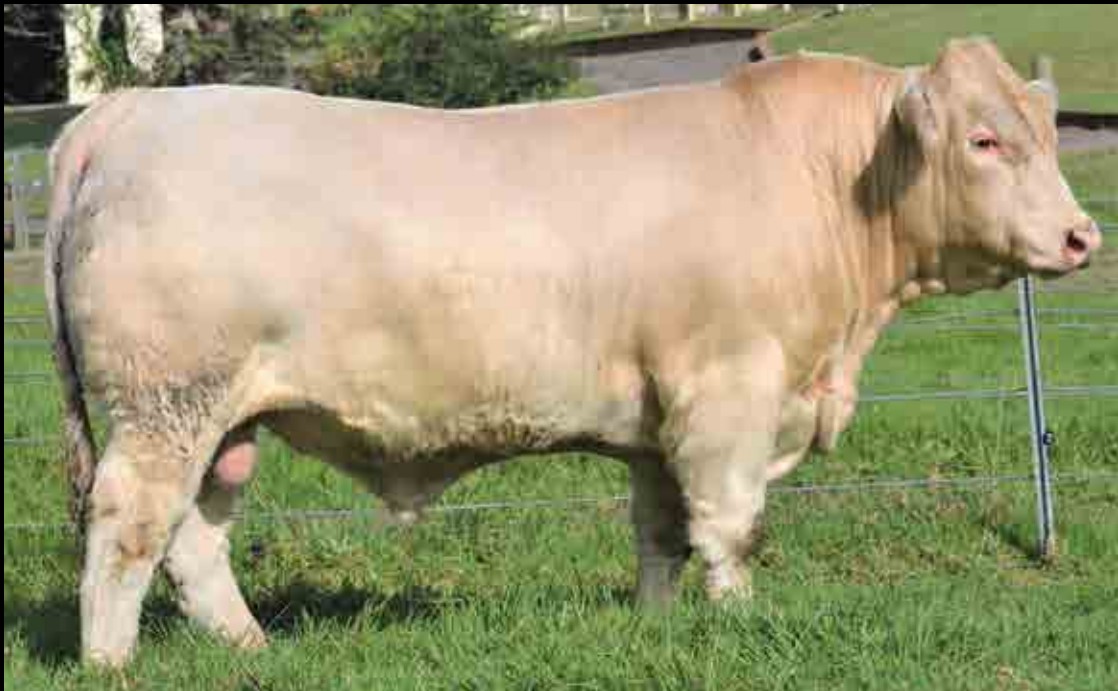
Glenlea Pistol (P) - GLE P55E. Pistol is an E.T. son of Lot 3C. Sired by Silverstream Holster (P). Sold to Allednaw Charolais in 2020 as stud sire, and sire of Lot 4A. Photo at 20 months and 850kg.