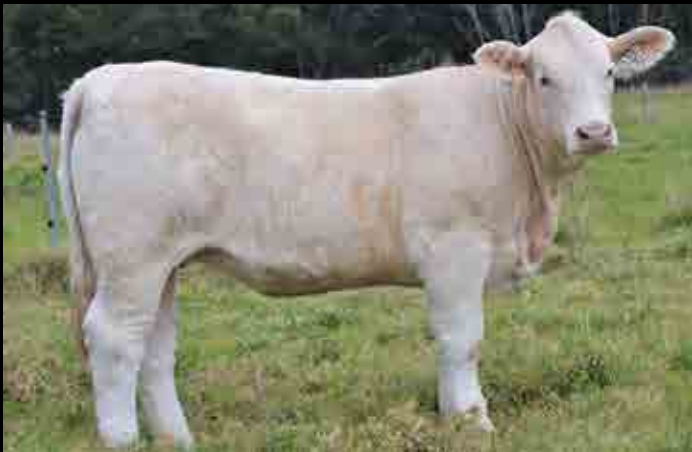
Glenlea Rebbby 16th (P) 15 month old. Homozygous Polled. Daughter of Dam Lot 39 Embryos. Mid winter 2020.