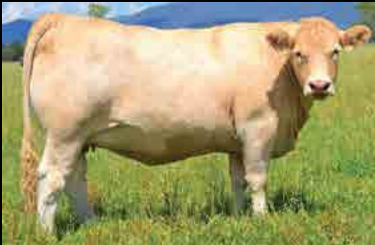
GLE Q2E at 25 months. February 2021