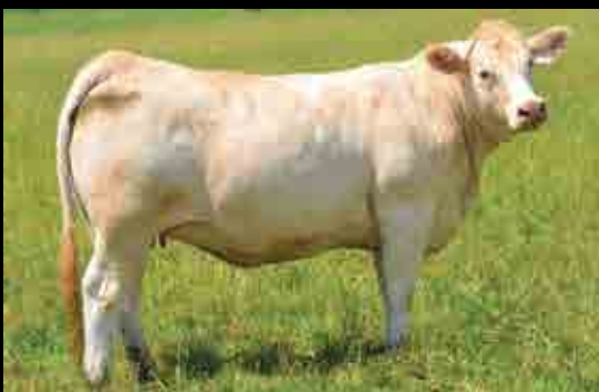
GLW Q2E at 25 months. February 2021