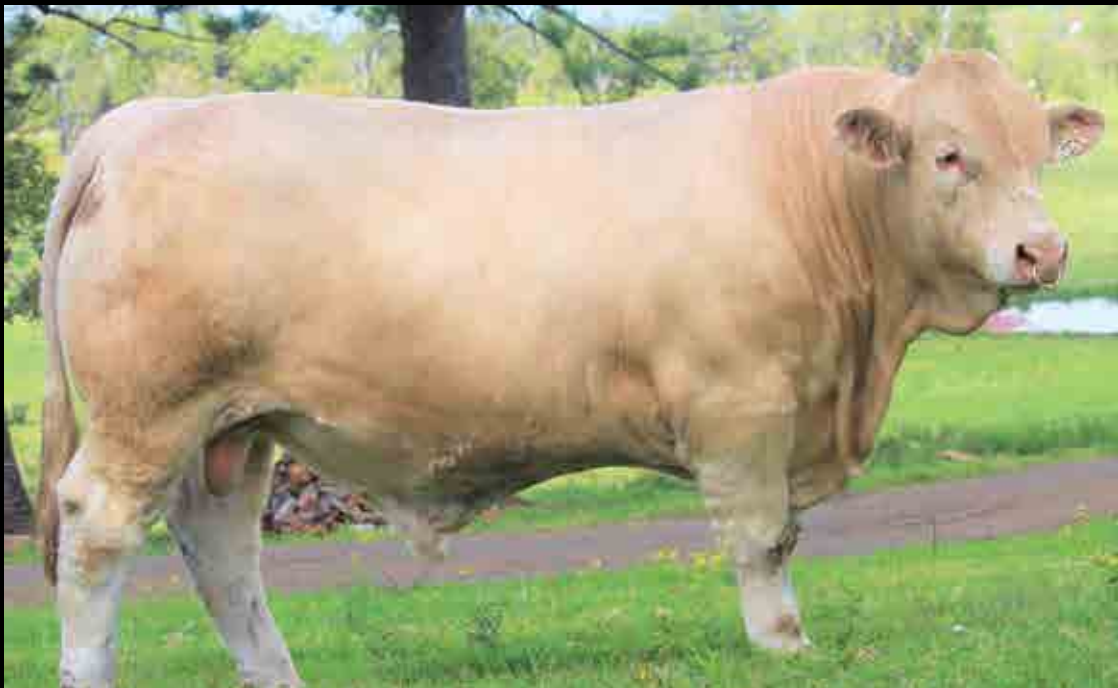
Glenlea Quartermaster (P) (R/F) - GLE Q44E. 2019 natural calf of Lot 3C. Sired by Glenlea Honorable (P) R/F. Sold to Charnelle Charolais as stud sire at our 2020 Clermont Bull sale for $18,000. Photo at 19 months and 900kg.