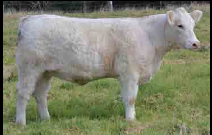
Glenlea Charol 114th (P)

Dam of OW GLENLEA NORTH (P) Reference sire in this sale. Dam of Lot 41. DONOR Dam. Homozygous Polled. Was top priced female at our 2019 DROUGHT BUSTER FEMALE SALE AT $12,250. Photo February 2021.