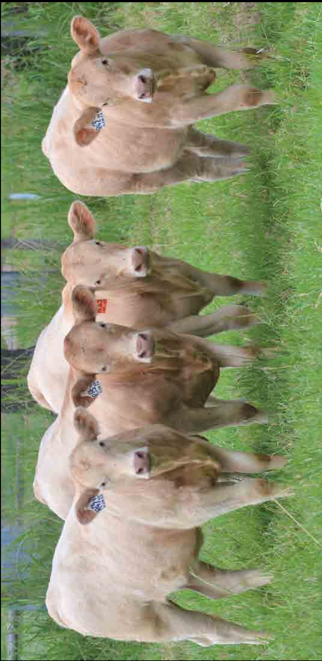
Four Glenlea Just Red Daughters, Lot 48 calf at foot, Lot 8A, Lot 7A and Lot 12A, 6 to 7 months