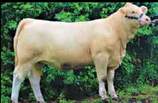
GLE Q10E at 14 months. Purchased March 2020 for $11,000