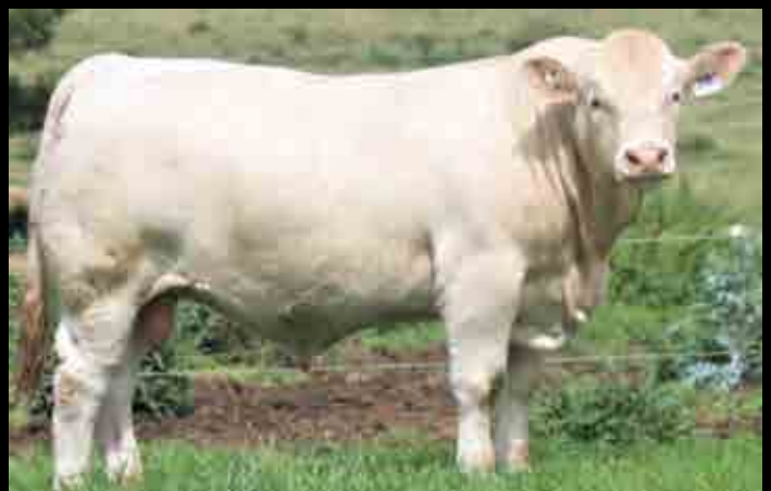
Glenlea Q-brick (P) sold for $15,000 at 16 Months to Minnie Vale Charolais. Full Sibling to embryos Lot 40.