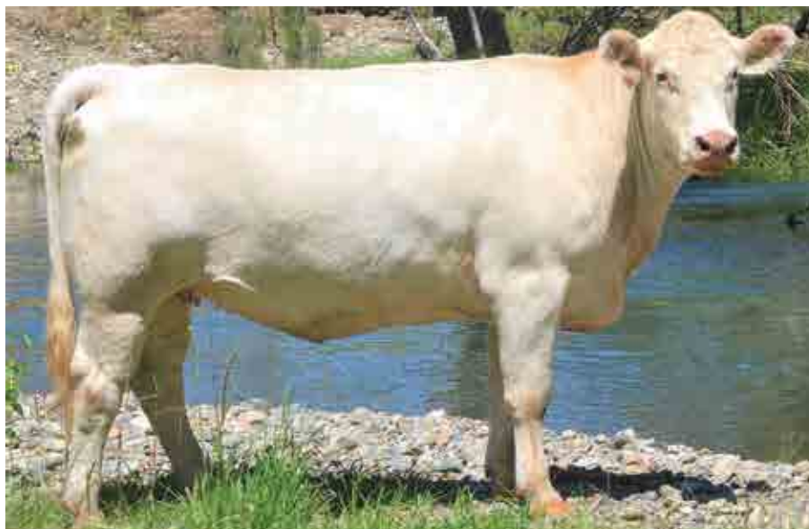
Will calve after sale.

COMMENTS: Classy female! Moderate framed, early maturing, good growth, fine coated, easy doing, excellent udder with good overall carcass and plenty of fat cover. A young female that has produced an excellent calf with her whole life in front of her. Dam is Donor cow who we have sold heifer progeny to $9000. Sire has produced a number of high selling progeny across Australia in last year or two. Friesia 1st is HOMOZYGOUS POLLED and we are retaining her 2020 heifer calf. We think calf from this mating will be special, Homozygous by pedigree and Red Factor! EBV's top 15% of breed for growth traits, moderate BW with all positive and well above breed average carcass traits