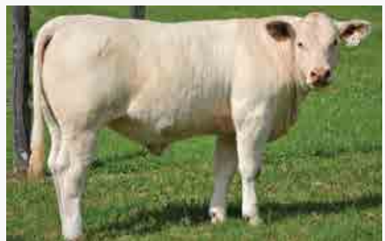
PHOTO: L44's first calf GLE P27E at weaning 2019. She is offered at Lot 18 in this catalogue with calf at foot and rejoined.

L44 will calve in February to Glenlea Just Red (P) R/F and we will be flushing her in May 2021. Purchasers responsible for all flushing and program costs, including semen as per sale conditions.