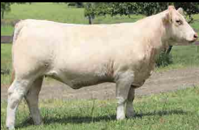
Glenlea Chiffon 24th (P) 15 month old. Homozygous Polled. Daughter of Dam of Lot 40 embryos. January 2021