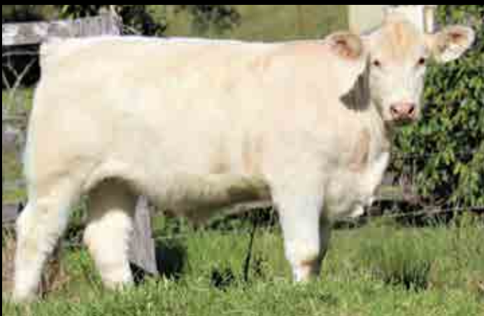
Glenlea Isabella 12th (P)

15 month old daughter of Charol 72nd. Homozygous Polled. Photo Mid-Winter 2020.