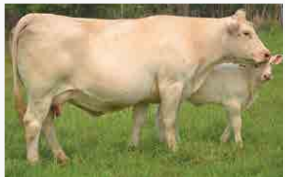
PHOTO: Estella H26 at 7 years with a 3 month old calf at foot, on coastal country.

PHOTO: Estella H26 at 9 years of age - 6 months in calf.