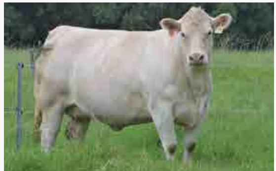
PHOTO: Chiffon J10 at 8 years old in calf 6 months

PHOTO: Chiffon J10 at 5 years, half way through pregnancy.