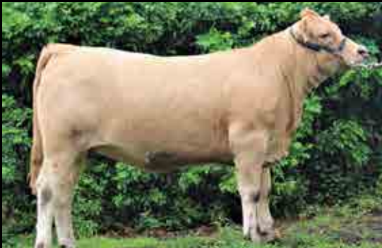
GLE Q2E at 14 months. Purchased March 2020 for $5000

Normal terms and conditions with the sale of frozen embryos - see sale conditions at front of catalogue. Never done an E.T. program? We have recipient cows we could transfer them into for you and deliver a pregnant cow for you to calve at your place!