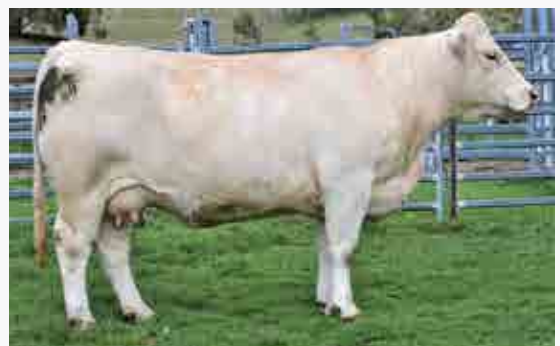
PHOTO: Age 5 years - the day of weaning her 2016 born bull calf.

PHOTO: Rebby H14 at 9 years close to calving.