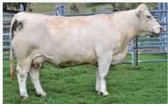
PHOTO: Age 5 years - the day of weaning her 2016 born bull calf.

PHOTO: Rebby H14 at 9 years close to calving.