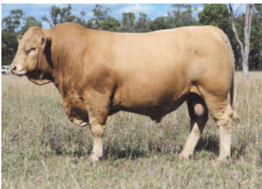
Son of Eclipse - Clare Gambler (P)(R/F) sold to Noller Charolais.