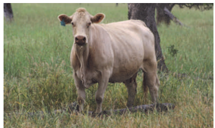
Shiloh Ever-Red-E. This cow is breeding soft, thick progeny and she is continuing to perform into her senior years.