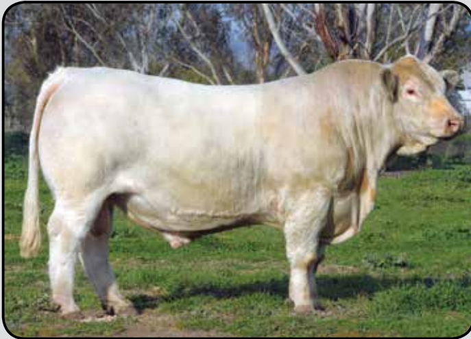
VENTURON MAXIMUM IMPACT (VE7 M60E) (P) Homozygous Poll Walking Rights sold to Winchester Charolais Semen exported to Canada & New Zealand Sire of

Winchester Lock N Load Q1E (P) Semen exported to Canada