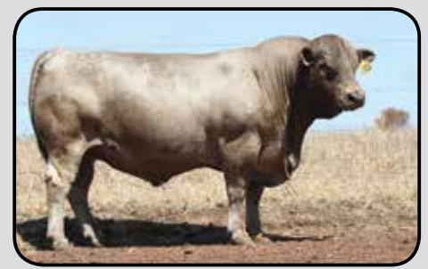
8 Murray Grey