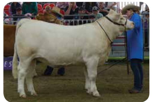
Dam: Venturon Mariah at 18 months

VENTURON KEYSTONE (VE7 K14E) (P) D: VENTURON MARIAH (VE7 M59E) (P) VENTURON JESSIE (VE7 J22E) (P)