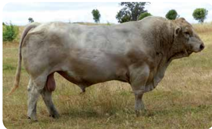
VENTURON FRANKIE (VE7 F10E) (P) Trait Leader: Birthweight