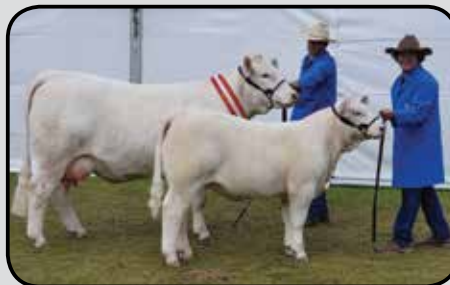
VENTURON NAUGHTY BUT NICE (VE7 N31E) (P) Supreme Charolais Exhibit Adelaide Royal 2019 Venturon Embryo Donor Dam of