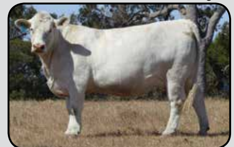
VENTURON GAYLE (VE7 G35E) (P) Venturon Embryo Donor Dam of