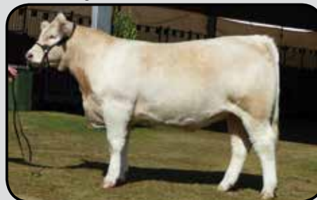
VENTURON HILLARY P27 (VE7 P27E) (P) Sire: Sparrows Kingston 137Y