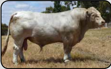
VENTURON KEYSTONE (VE7 K14E) (P) Trait Leader: 200 Wt, 400 Wt, 600 Wt Interbreed Junior Champion Male Perth Royal 2015 Sire of