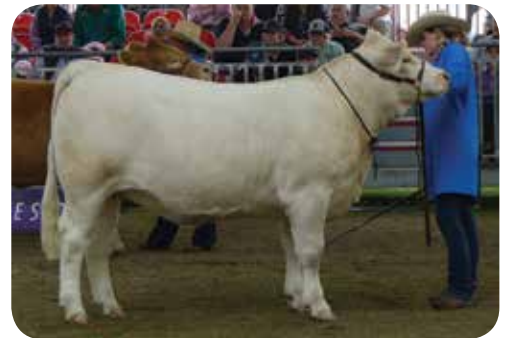
Dam: Venturon Mariah at 18 months

VENTURON KEYSTONE (VE7 K14E) (P) D: VENTURON MARIAH (VE7 M59E) (P) VENTURON JESSIE (VE7 J22E) (P)