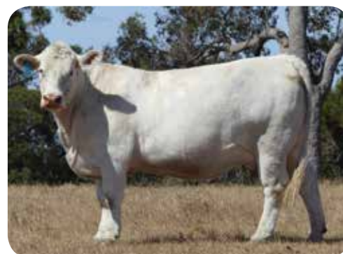
Granddam: Venturon Gayle

D: VENTURON JULIET (VE7 J13E) (P) VENTURON GAYLE (VE7 G35E) (P)