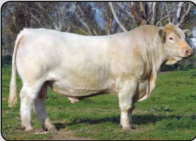
VENTURON MAXIMUM IMPACT (VE7 M60E) (P) Homozygous Poll Walking Rights sold to Winchester Charolais Semen exported to Canada & New Zealand Sire of