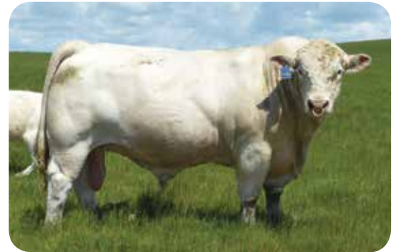
Sire: Elders Blackjack 788B

PALGROVE VENTURE (PK V187F) D: CHARNELLE DIGNA 81 (GKA D25E) (P) CHARNELLE DIGNA 18 (GKA V28E) (P)