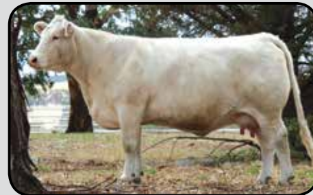
VENTURON HILLARY (VE7 H43E) (P) Homozygous Poll Venturon Embryo Transfer Donor Dam of