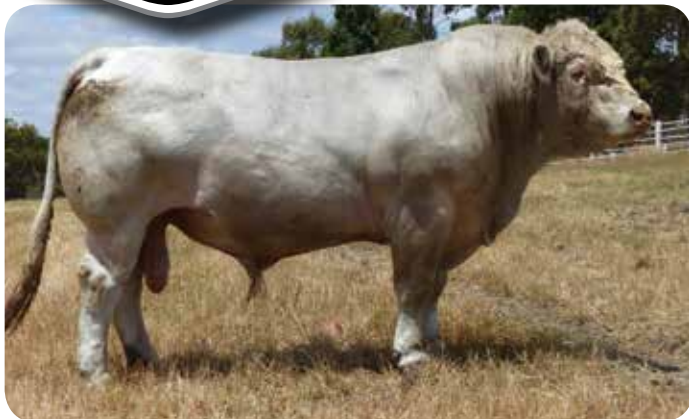
VENTURON KEYSTONE (VE7 K14E) (P) Trait Leader: 200 Wt, 400 Wt, 600 Wt

Sires of Influence in our Charolais program