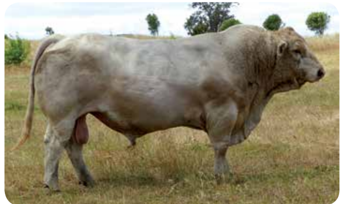
VENTURON FRANKIE (VE7 F10E) (P) Trait Leader: Birthweight