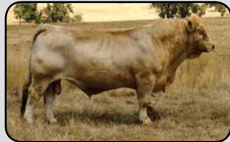
VENTURON CRUSTY DEMON (VE7 C5E) (P) Trait Leader: 200 Wt, 400 Wt, 600 Wt, Scrotal Size Sire of