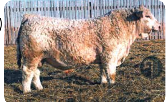
Sire: JWX Downtown 7C

IMPAIR (OAF N189F) D: ROSSO MARYANNE 2L (OAC W259E) (P/S) POOLEDALE WYNSOM GAL 39F (PED R9961E) (P)