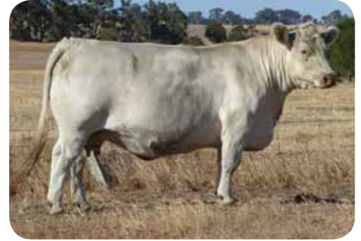
Granddam: Venturon Fiona

VENTURON CRUSTY DEMON (VE7 C5E) (P) S: VENTURON HAMISH (VE7 H6E) (P) VENTURON ELIZA (VE7 E8E) (P) GOBONGO G171E (GO G171E) D: VENTURON KIMBERLEY (VE7 K38E) (P) VENTURON FIONA (VE7 F23E) (P)