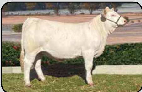
VENTURON CLEMENTINE Q11 (VE7 Q11E) (P) Donor Dam Black Dog Ride Promotion $15,000 of Embryos sold to support Mental Health Awareness.