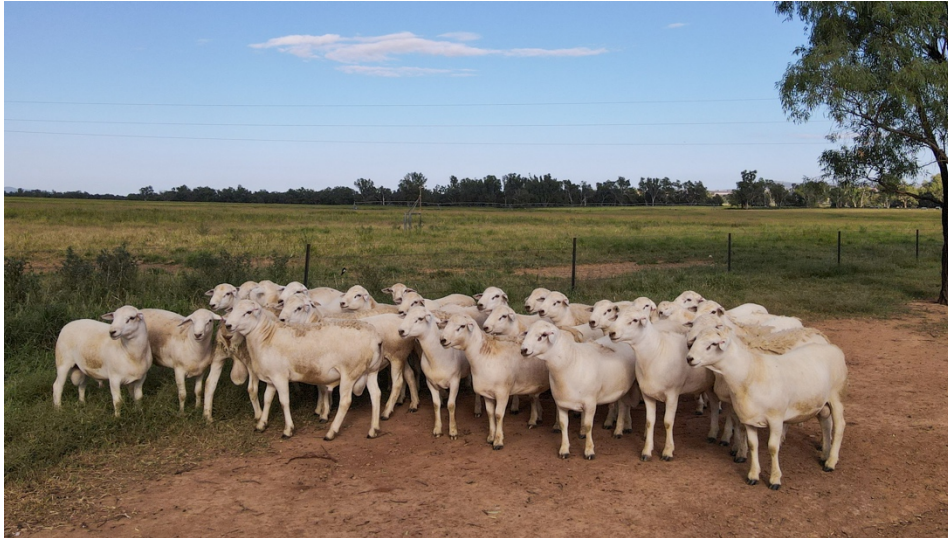
Flock Rams (Shorn)