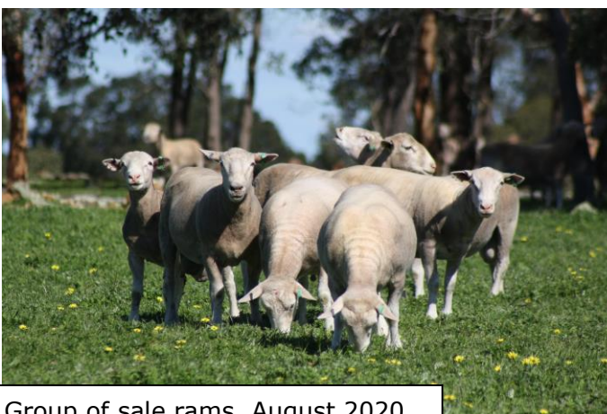
Group of sale rams, August 2020.