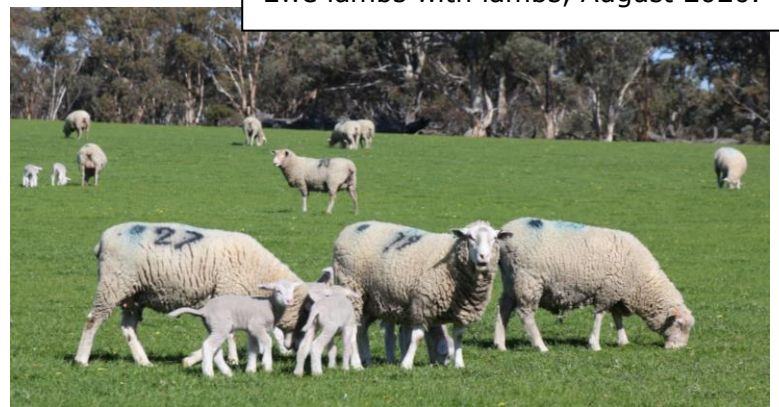
Ewe lambs with lambs, August 2020.