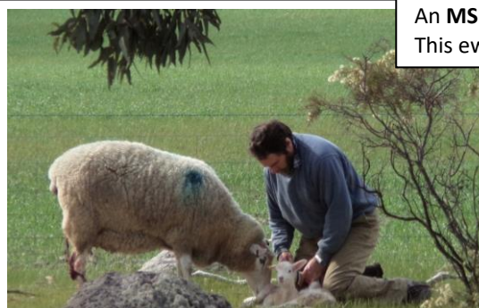
An MS10 ewe at lamb tagging time, 2013. This ewe produced natural triplets in 2014.

But generally, an outstanding mother is always an outstanding mother.