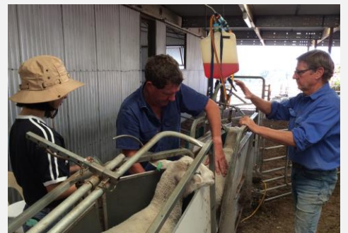
Collecting individual dung samples to determine genetic resistance to worms.