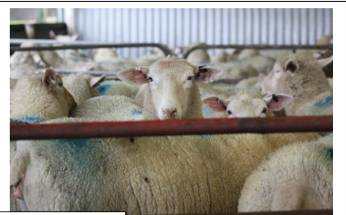
Murdoch trial ewe lambs.