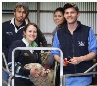
Murdoch research team in action.