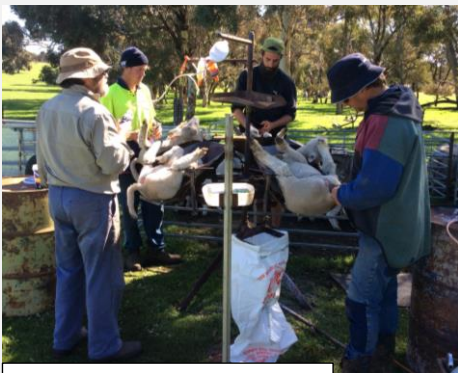
Lamb marking 2020.

Mount Ronan contributed 203 ewe lambs to the project, which also involved other breeding flocks around Australia. The Murdoch project will be continued for the next 3 years.