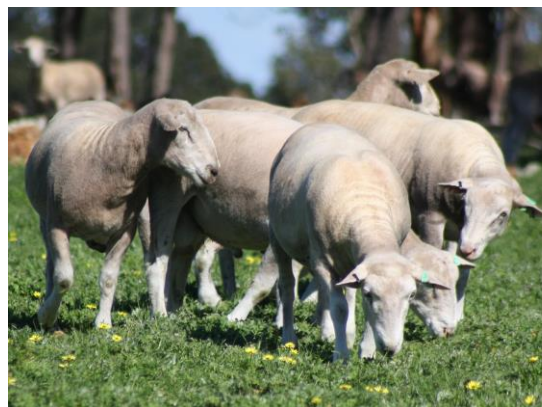
Group of 2020 sale rams. August 2020.

We will continue to collect faecal samples for individual worm analysis in order to improve the accuracy of the worm resistance ASBV (PFEC). Any outside sires we use in our AI or ET programs are all strongly or highly resistant to internal parasites.