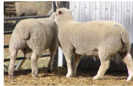
2006 drop White Suffolk lambs at Mount Ronan. Muscular, growthy, high-yielding genetics have always been the focus over the decades.

The hardy Mount Ronan White Suffolk genetics powers our Maternal program. These genetics go back directly to the outstanding Suffolk flock I founded in 1969.