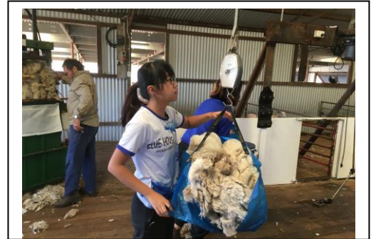
Weighing Maternal ram fleeces for analysis and wool testing.

Our main emphasis, however, continues to be on the provision of high, early-growth genetics for maximum prime lamb profitability. Modern Mount Ronan White Suffolk and Maternal sheep are the result of selection for constitutional strength, muscling, lambing ease, mothering ability, and high-profit lamb production over the past 52 years.