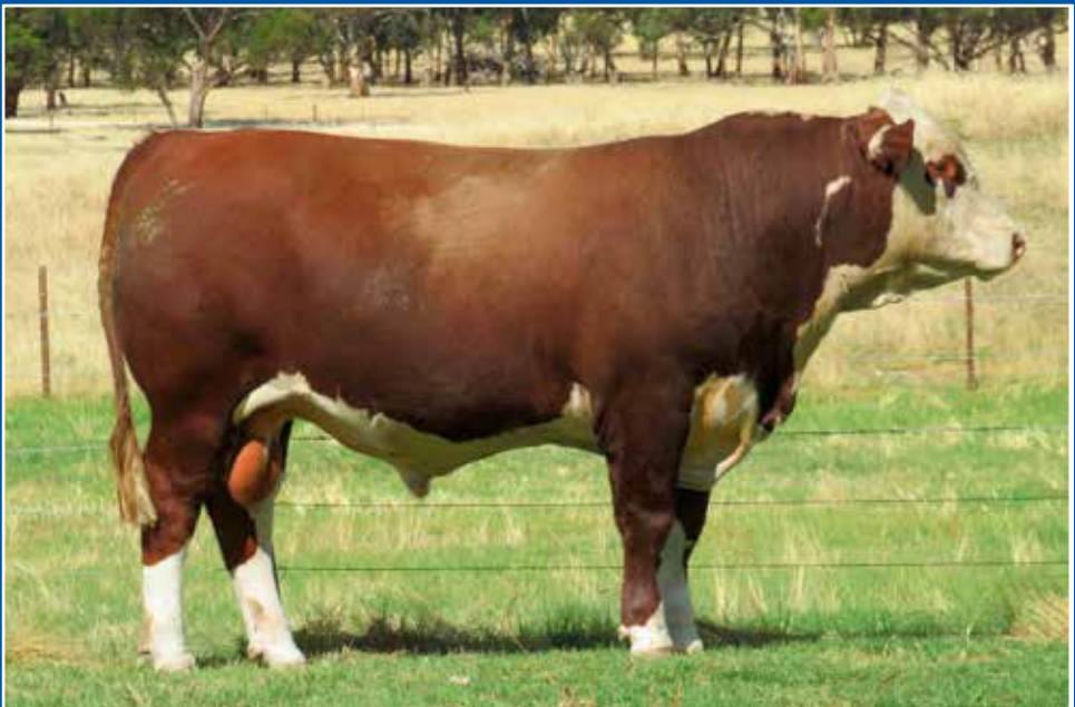
LOT 20 MORGANVALE QUELLA Q272 (PP) WLM Q272