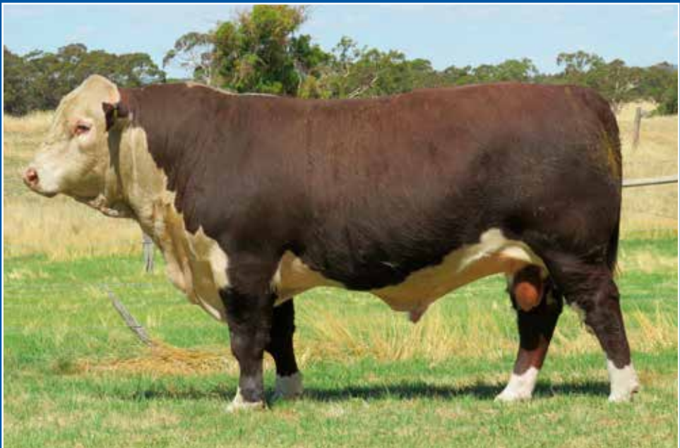
LOT 14 MORGANVALE QUIXOYE Q078 (PP) WLM Q078