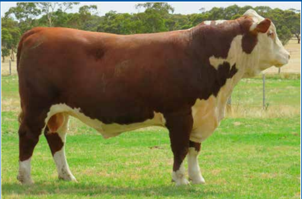
LOT 31 MORGANVALE Q301 (TW) (PP) WLM Q301