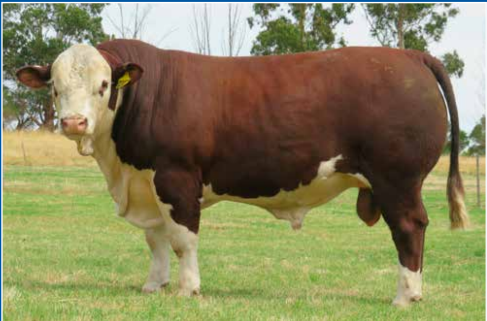
LOT 34 MORGANVALE QUETRO Q307 (PP) WLM Q307