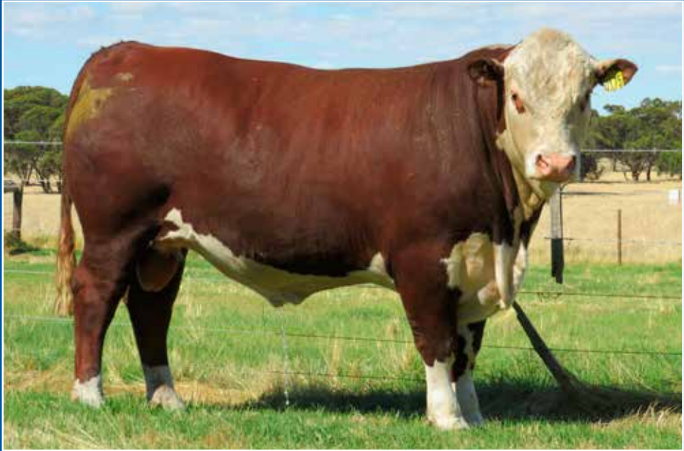
LOT 44 MORGANVALE QUIZZICAL Q175 (PP) WLM Q175