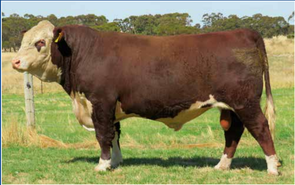
LOT 2 MORGANVALE QUIX Q40 (PP) WLM Q040