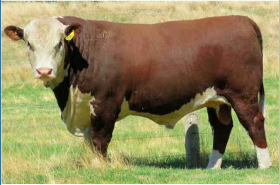
LOT 36 MORGANVALE QUIKKI Q50 (PP) WLM Q050