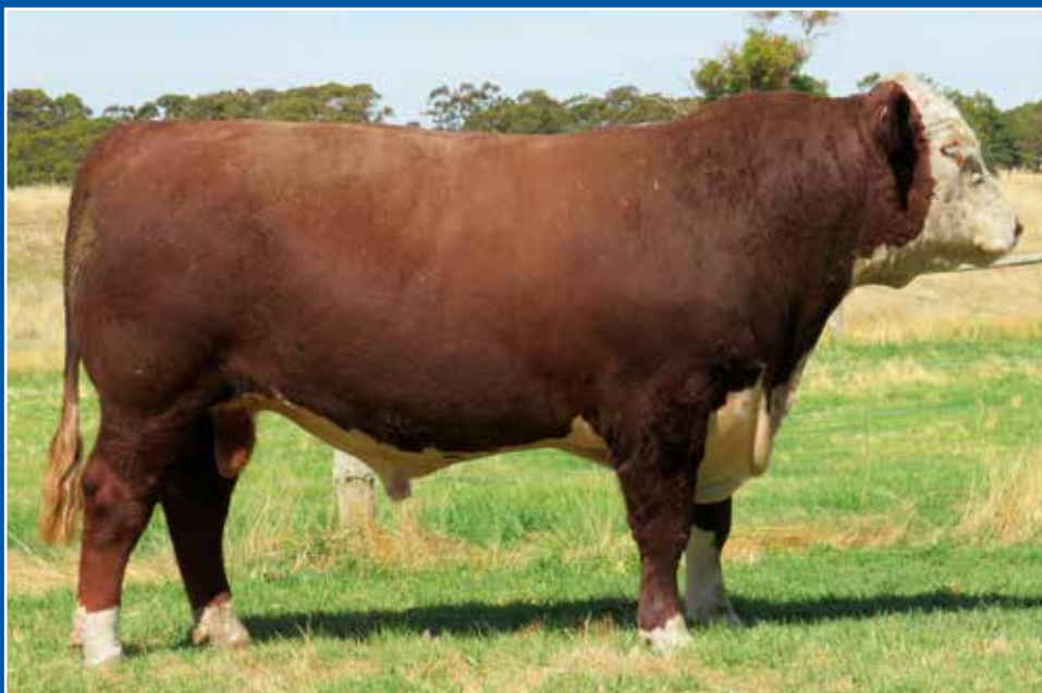
LOT 4 MORGANVALE QUIGGLE Q21 (PP) WLM Q021