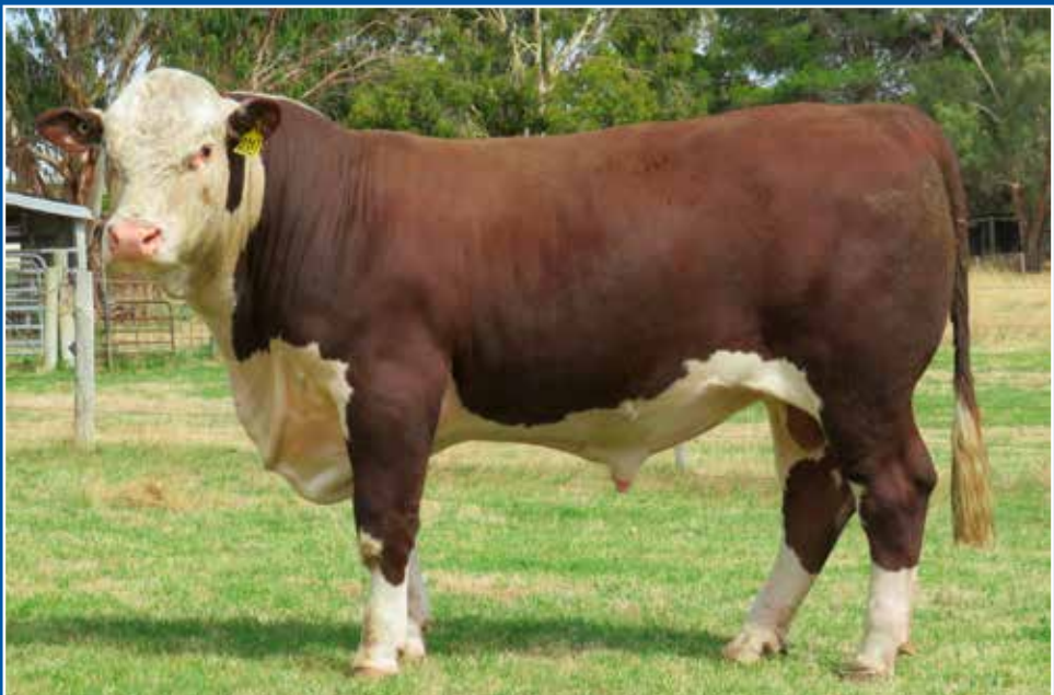
LOT 49 MORGANVALE QUAIL Q317 (PP) WLM Q317