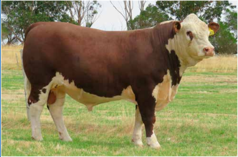
LOT 33 MORGANVALE QUALIFICATION Q361 (PP) WLM Q361