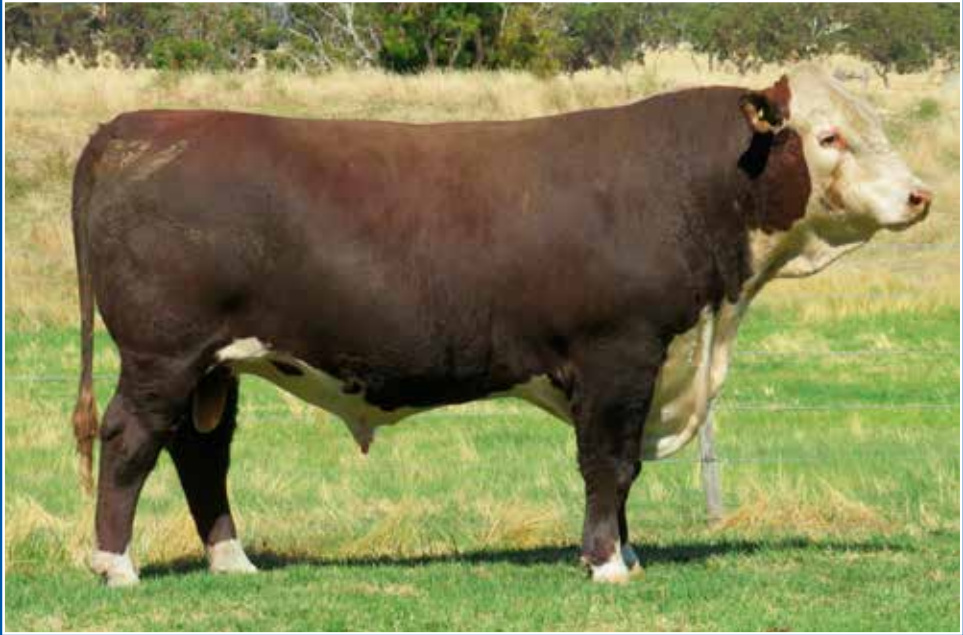
LOT 11 MORGANVALE QUIRKY Q062 (PP) WLM Q062