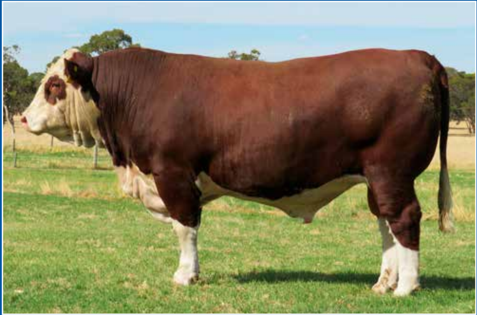
LOT 18 MORGANVALE QUATRIX Q291 (PP) WLMQ291