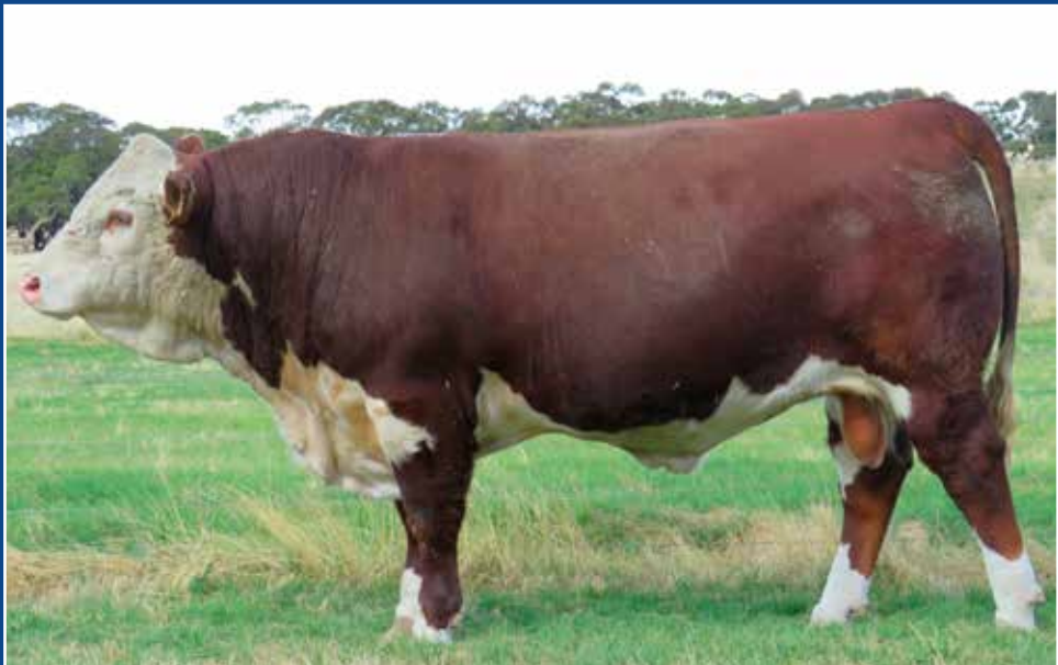
LOT 16 MORGANVALE QUIMBUS Q179 (PP) WLM Q179