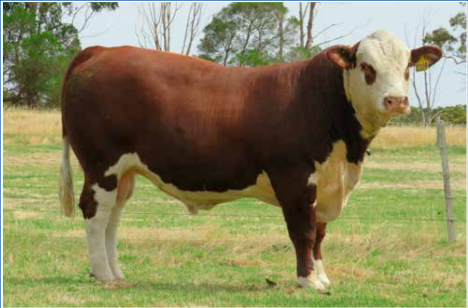
LOT 28 MORGANVALE QUICK DRAW Q329 (PP) WLM Q329