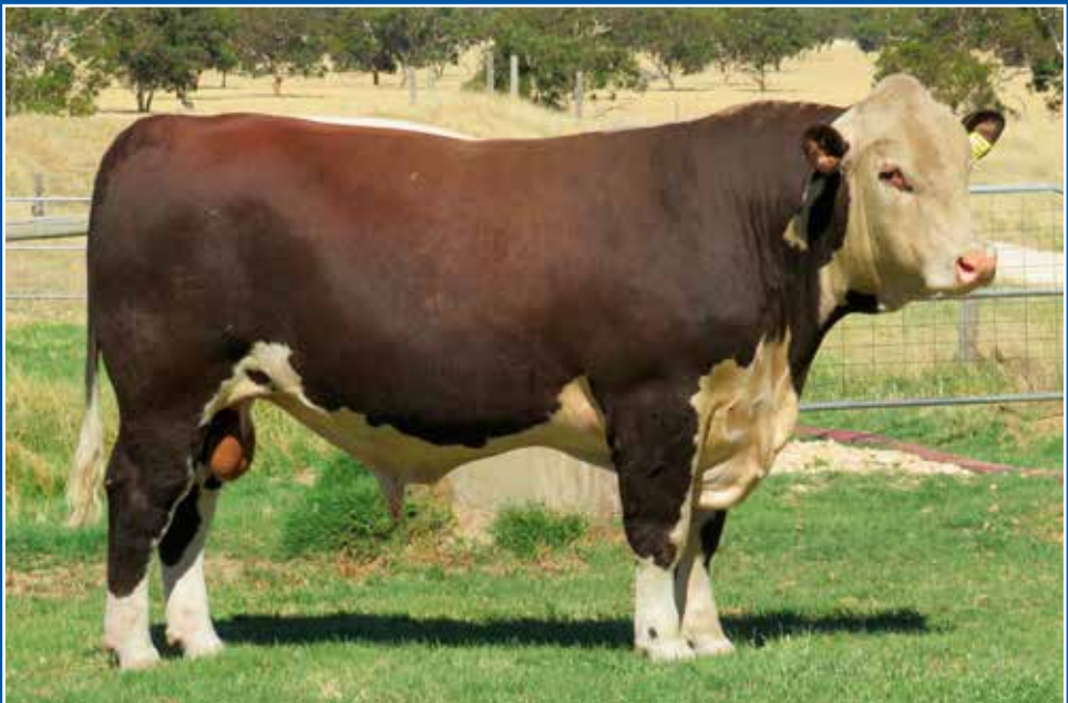
LOT 37 MORGANVALE QUIZZ Q127 (PP) WLM Q127