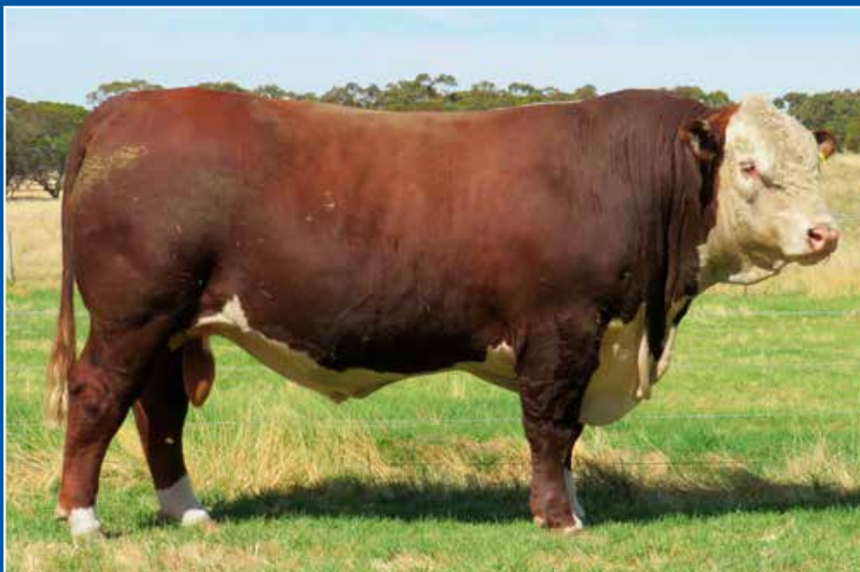
LOT 3 MORGANVALE QUIMICK Q60 (PP) WLM Q060