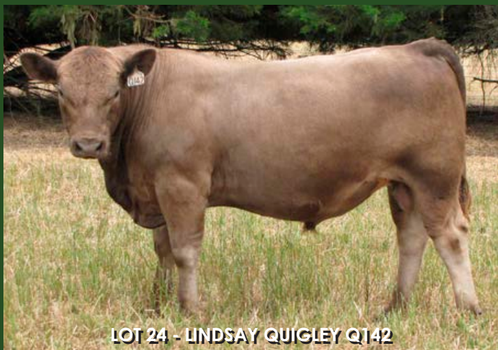
LOT 24 - LINDSAY QUIGLEY Q142