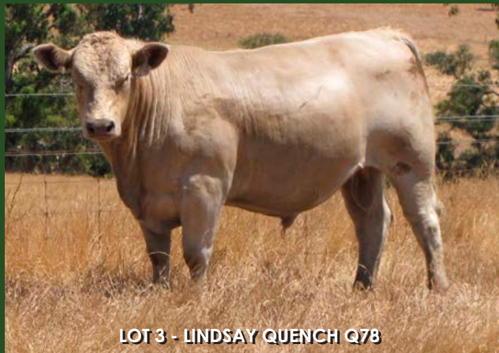
LOT 3 - LINDSAY QUENCH Q78