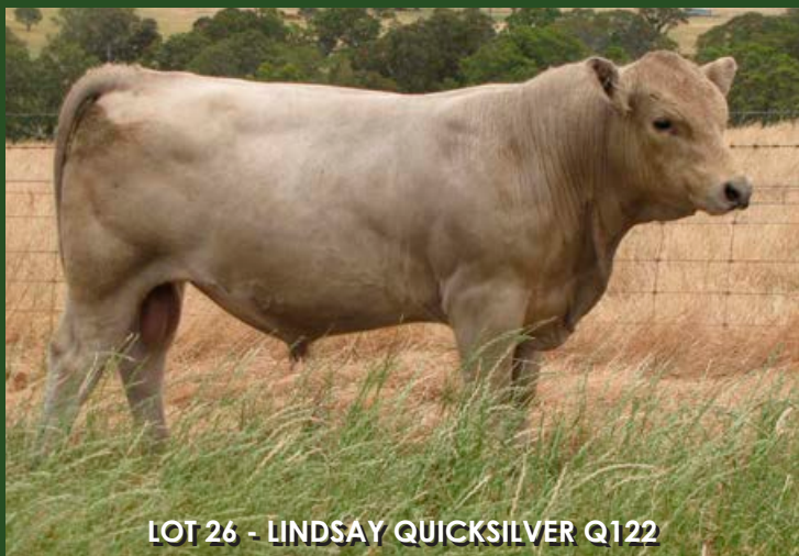
LOT 26 - LINDSAY QUICKSILVER Q122