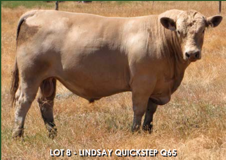
LOT 8 - LINDSAY QUICKSTEP Q65