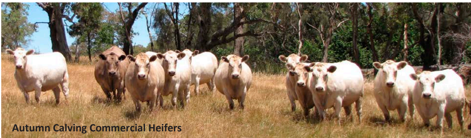
Autumn Calving Commercial Heifers

Commercial Heifers are not eligible for freight assistance, but maybe worked in on route with bulls if possible (no guarantees)