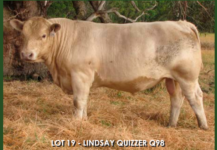
LOT 19 - LINDSAY QUIZZER Q98