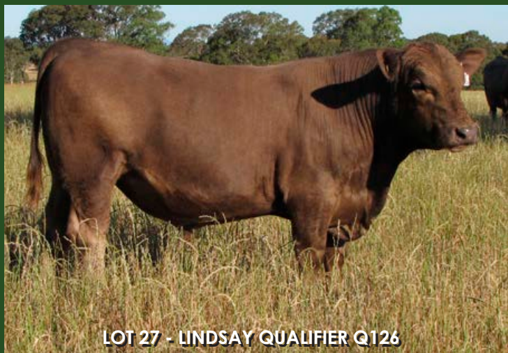
LOT 27 - LINDSAY QUALIFIER Q126