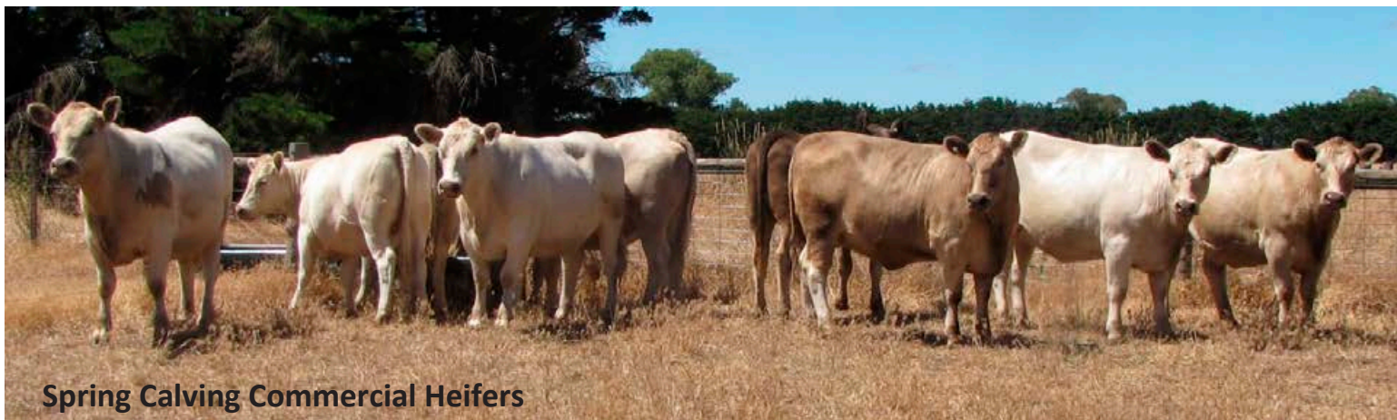
Spring Calving Commercial Heifers