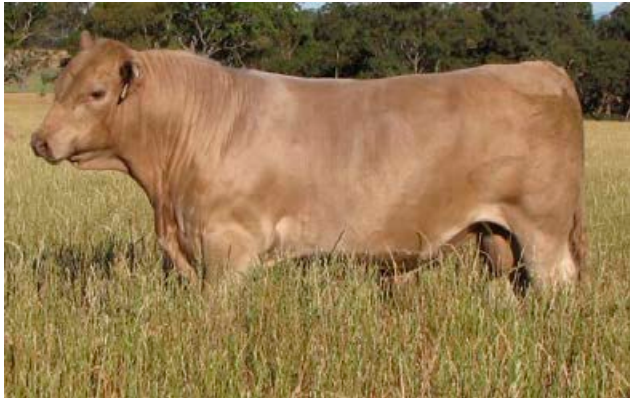
Lot 15 Lindsay Quadrant Q106