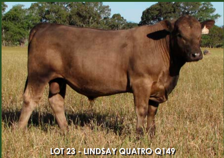
LOT 23 - LINDSAY QUATRO Q149