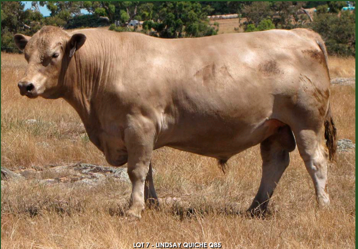
LOT 7 - LINDSAY QUICHE Q85