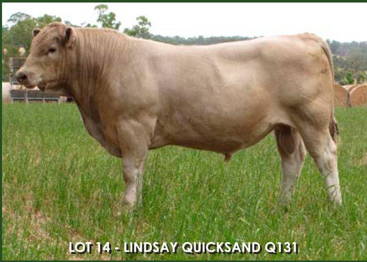
LOT 14 - LINDSAY QUICKSAND Q131