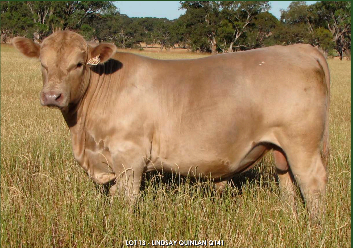
LOT 13 - LINDSAY QUINLAN Q141