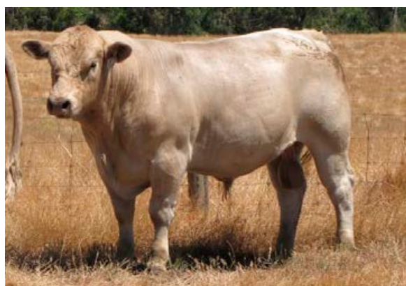
Lot 5 Lindsay Quebec Q61

From Naracoorte travel to Edenhope, then Harrow. From Harrow take the Coleraine Road for 17km. Property on the right.