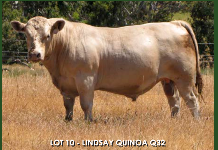
LOT 10 - LINDSAY QUINOA Q32