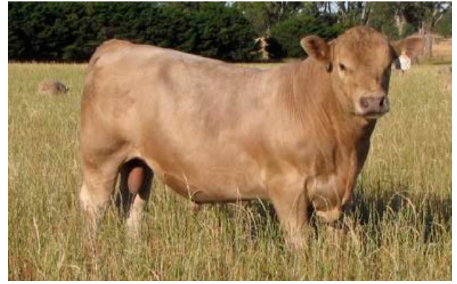
Lot 29 Lindsay Quidditch Q110