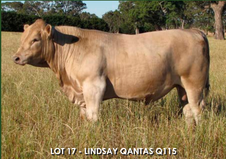
LOT 17 - LINDSAY QANTAS Q115