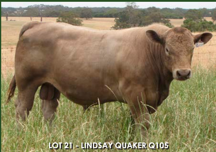
LOT 21 - LINDSAY QUAKER Q105