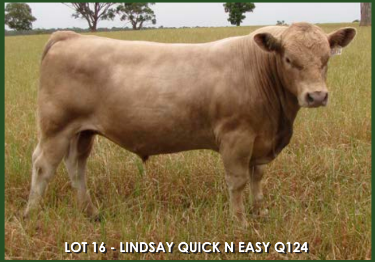
LOT 16 - LINDSAY QUICK N EASY Q124