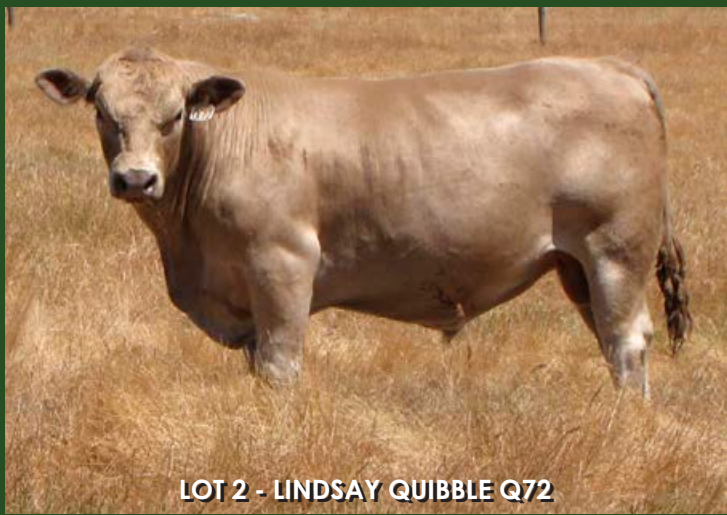
LOT 2 - LINDSAY QUIBBLE Q72