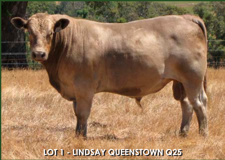
LOT 1 - LINDSAY QUEENSTOWN Q25