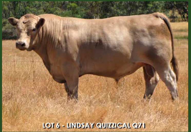
LOT 6 - LINDSAY QUIZZICAL Q71