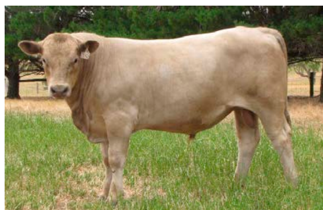
Lot 22 Lindsay Quartz Q150