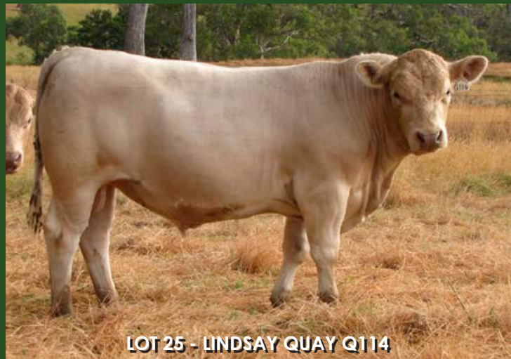
LOT 25 - LINDSAY QUAY Q114