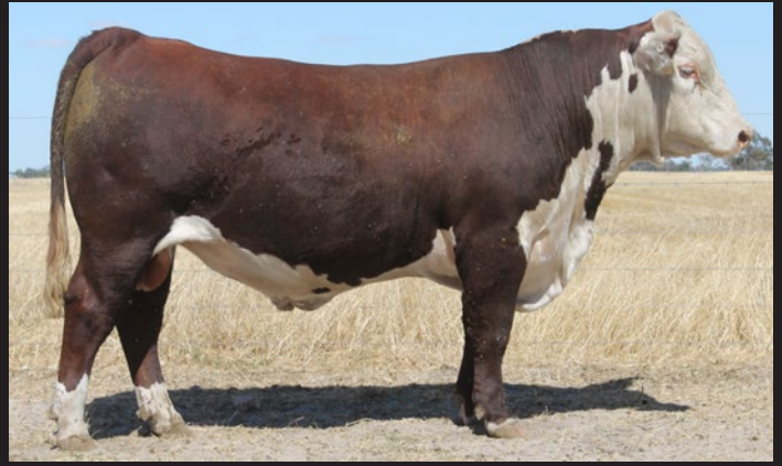
KERLSON PINES LOT 3