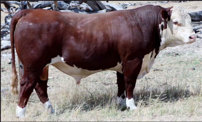
OAK DOWNS LOT 11