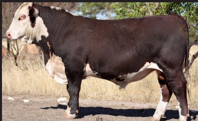
KERLSON PINES LOT 14