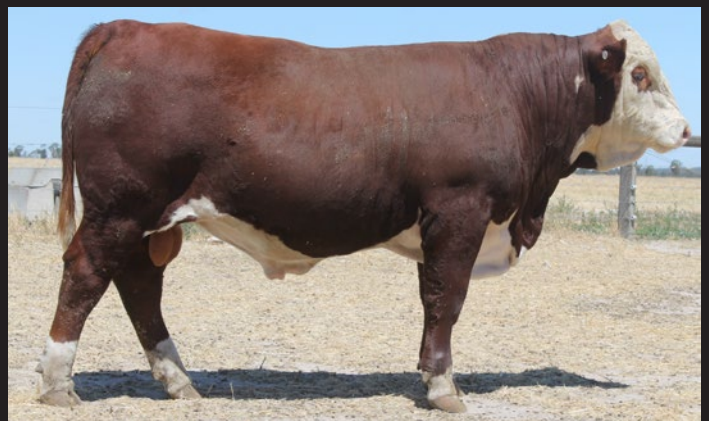
KERLSON PINES LOT 16