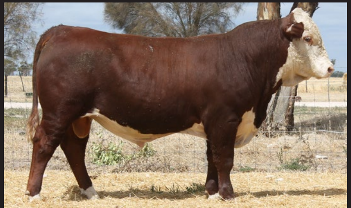
KERLSON PINES LOT 49