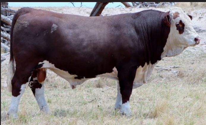
OAK DOWNS LOT 32