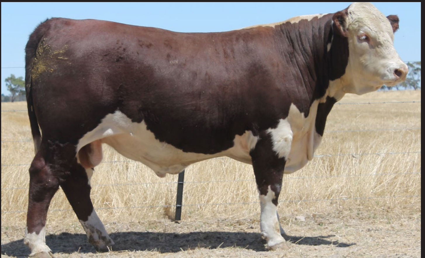
LOT 13 KERLSON PINES MILESTONE Q167