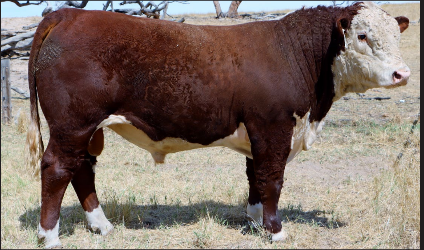
LOT 10 OAK DOWNS OYSTER Q135