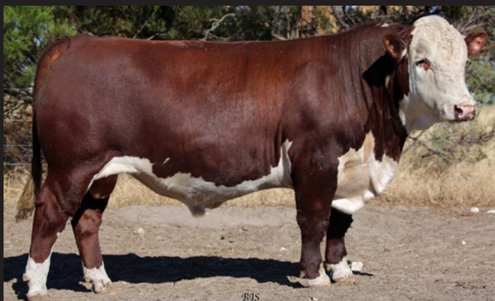
KERLSON PINES LOT 2