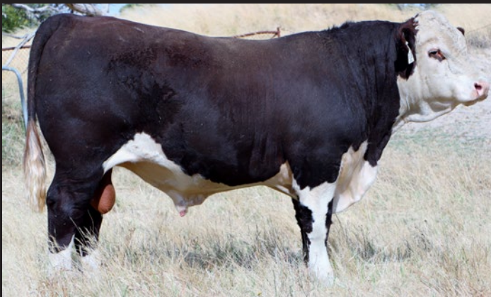
OAK DOWNS LOT 19