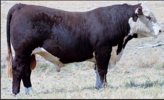
OAK DOWNS LOT 9