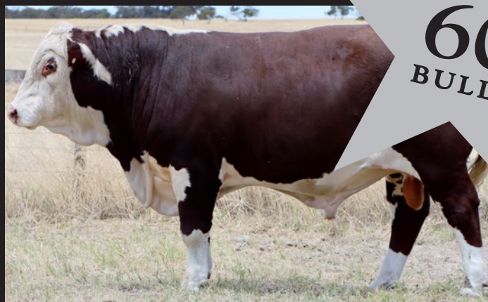
OAK DOWNS LOT 8