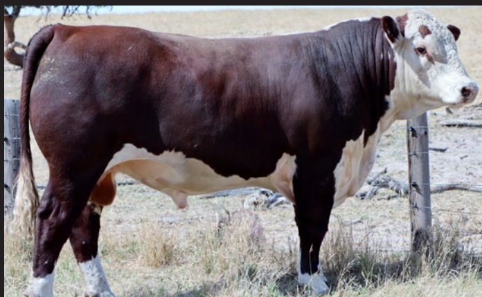
OAK DOWNS LOT 7