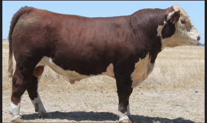
KERLSON PINES LOT 15