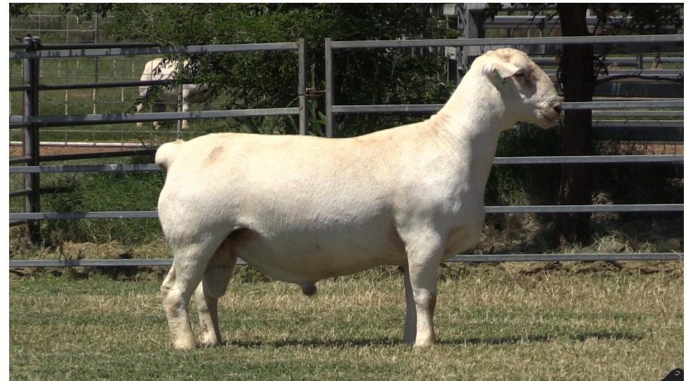
LOT 81 - AMARULA COOPER