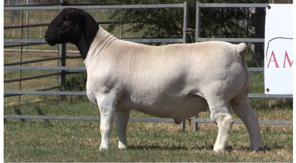
LOT 24 - AMARULA THUNDER