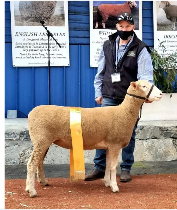
Supreme Poll Dorset exhibit Hobart Royal Show