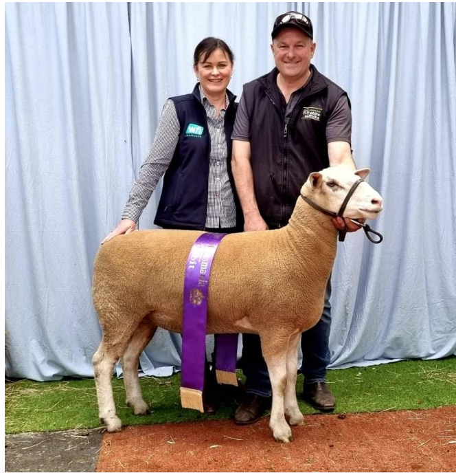
Supreme exhibit Hobart Royal Show